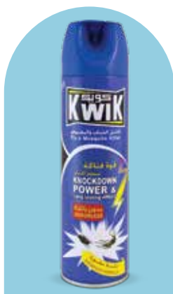
Fly Mosquito Killer Odourless Size: 400ml

Pyrethroid insecticide in the form of aerosol, with its advanced formulation, kills bed bugs on contact. With its dual use spray head, it effectively penetrates into cracks, crevices and folds or broad spaces where bed bugs harbor or move about. It is useful in controlling a variety of household pests such as fleas, ants, cockroaches, spiders, ticks, and mites.