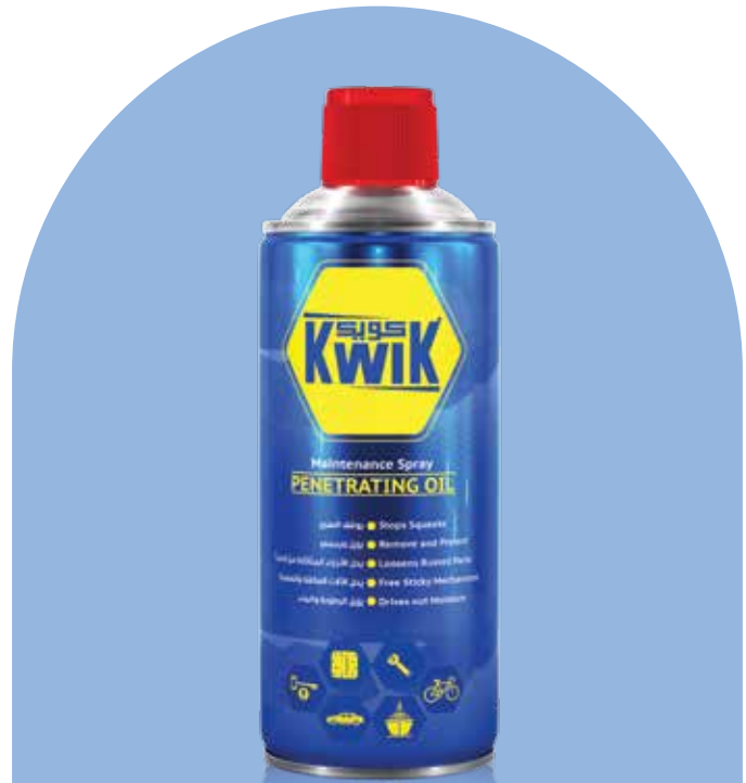
Maintenance Spray Size: 400ml