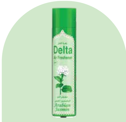
Arabian Jasmine Size: 300ml

Delta Air Freshener is a Dry base formulation with long-lasting fragrance, developed to fulfill oriental tastes. This traditional product range is popular in the Gulf region. Ideal to use on cloths, carpet, curtains, and furniture.