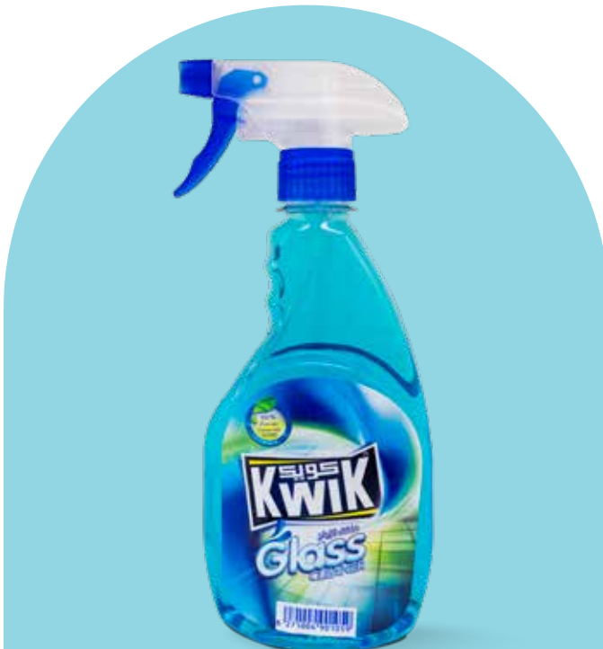
Glass Cleaner Size: 500ml

Use it to instantly stop squeaks, lubricate, clean, protect and remove stickiness.