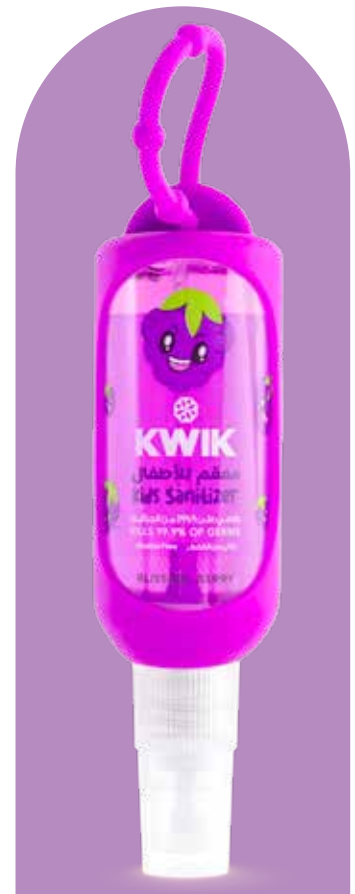
Blissful Berry Size: 50ml