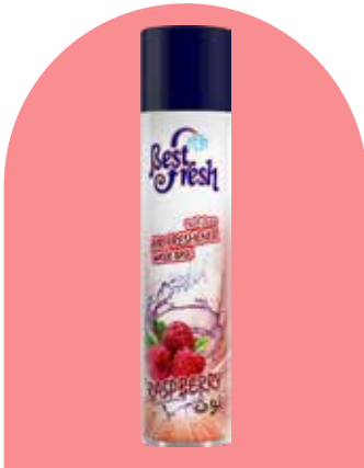
Raspberry Size: 300ml

Best Fresh air freshener is a Dry-base formulation with a competitive price range and offers wide range of fruit base fragrances.