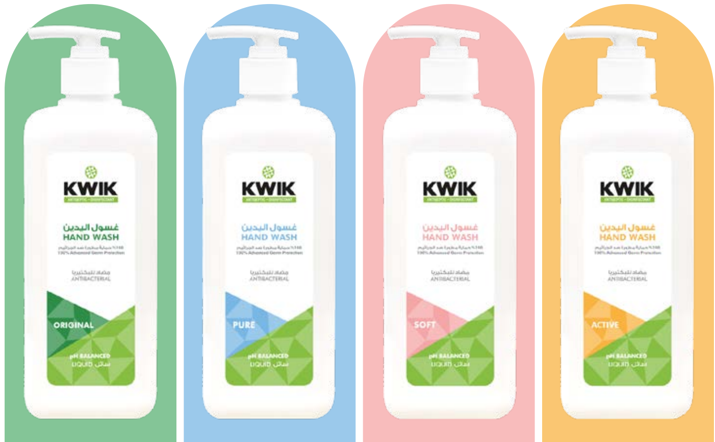
Hand Wash Original Size: 500ml

Especially formulated for personal use to help keep you safe from disease causing microorganism such as bacteria and viruses. Exceptionally mild, the product allows for frequent use, leaving hands 99.9% germ free, refreshingly clean, moisturized and pleasantly fragranced.