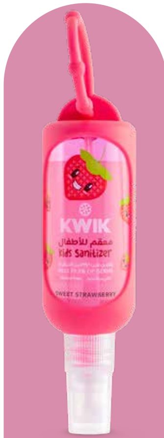
Sweet Strawberry Size: 50ml