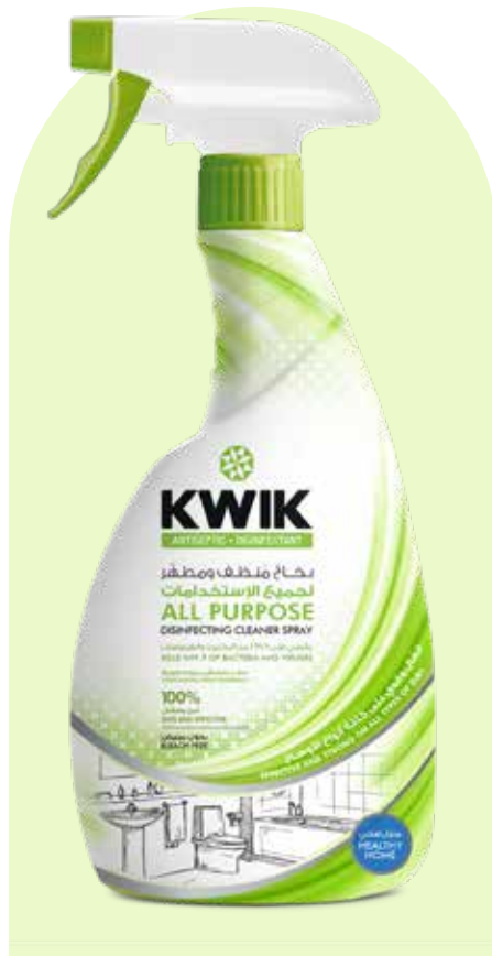
All Purpose Disinfecting Cleaner Spray Size: 500ml

Powerful disinfecting cleaner formula specially designed for superior cleaning action against all kinds of dirt. The formula kills 99.9% of germs such as disease-causing viruses and bacteria. The Disinfecting Cleaner Spray line includes All Purpose, Kitchen and Bathroom.