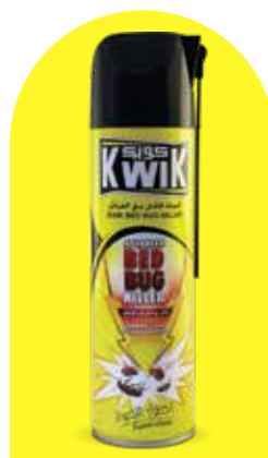
Knock Down Power Bed Bug Killer 400ml