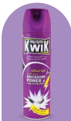
Knock Down Power FLYING/K Size: 300ml - 400ml