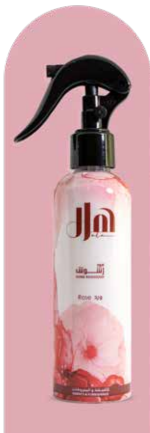
Rose Size: 195ml

It comes with 5 charming fragrances , each one takes you in a different fairy tale .