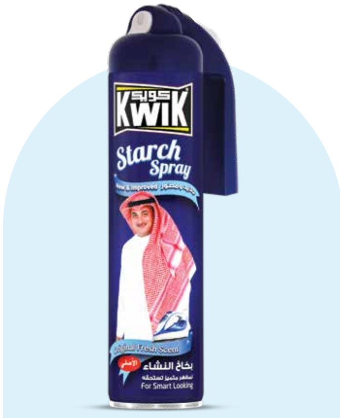
Shot Starch Size: 400ml

A non-perfumed formula used to eliminate static electricity that causes crackle and cling on all types of fabric. Recommended on clothes and fabrics.