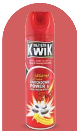
Knock Down Power All PUR/KLR Size: 400ml