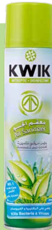
Air Sanitizer 300ml

It complies to the AOAC (1990) specifications for testing bacterial killer sprays.