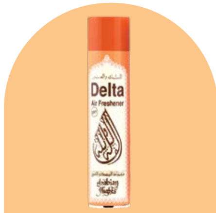
Arabian Night Size: 300ml