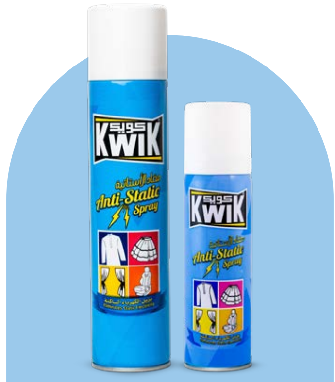
Anti-Static Spray Size: 70ml - 300ml