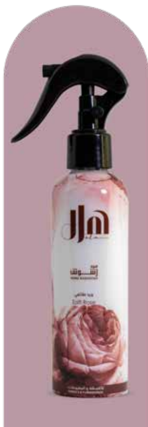
Taifi Rose Size: 195ml