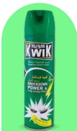
Knock Down Power CR/K. Size: 400ml