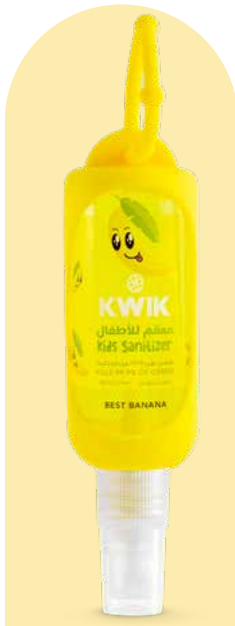
Best Banana Size: 50ml

Catering to the younger population, KWIK has introduced Kids Sanitizers in appealing fragrances like strawberry, berries, pineapple and banana. The formula is water-based, containing no alcohol, making it non-flammable and safe for kids.