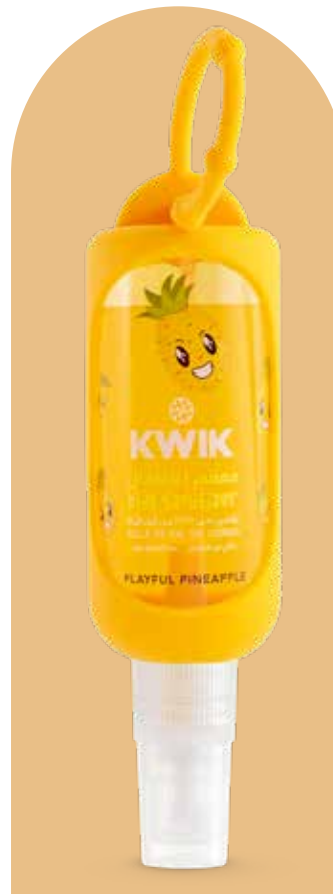
Playful Pineapple Size: 50ml