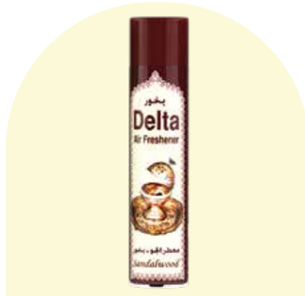
Sandal Wood Size: 300ml