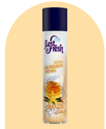
Orange Size: 300ml