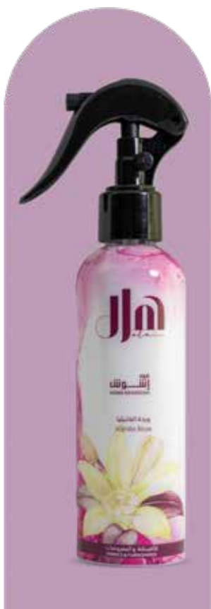
Vanilla Rose Size: 195ml