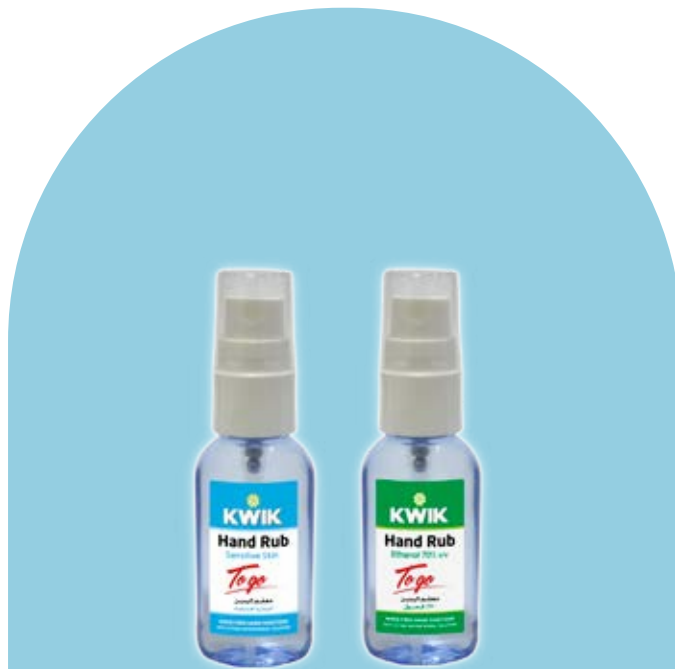
ToGo Hand Rub / ToGo Sensitive Hand Rub Size: 25ml