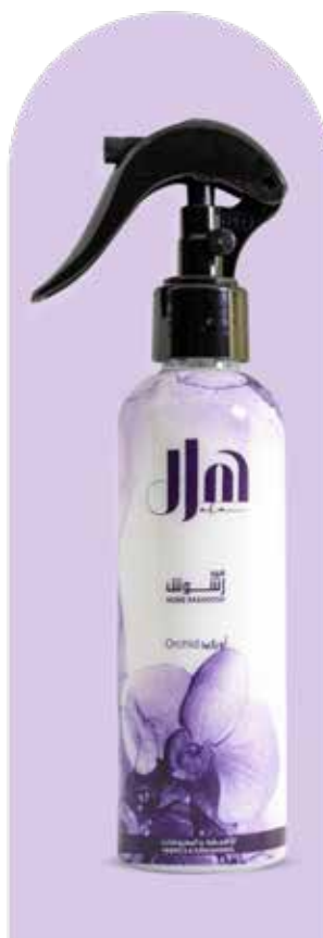
Orchid Size: 195ml