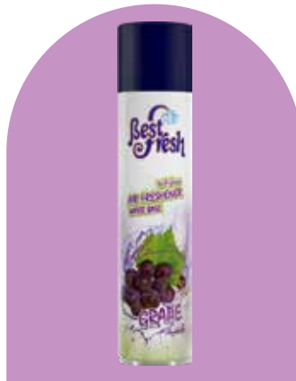
Grape Size: 300ml