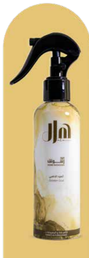
Golden Oud Size: 195ml