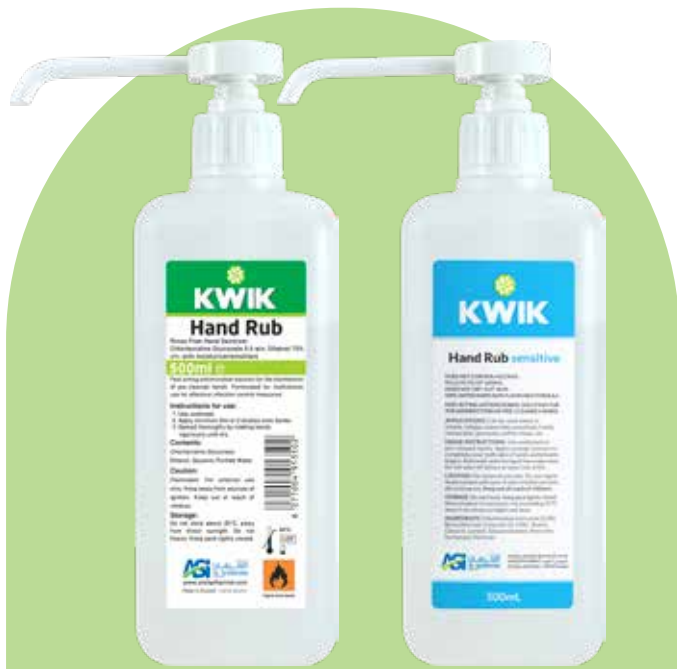
Hand Rub / Sensitive Hand Rub Size: 500ml

Fast acting antimicrobial solution for the disinfection of pre-cleaned hands.