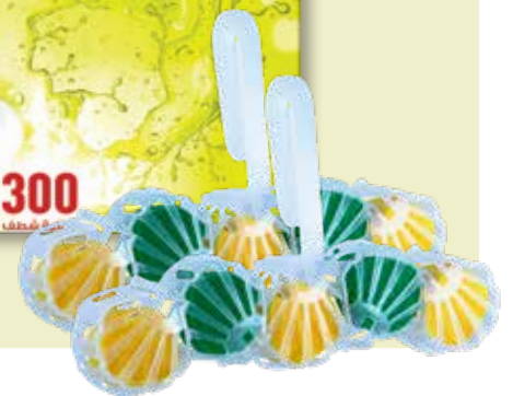
Lemon Size: 2 x 50g