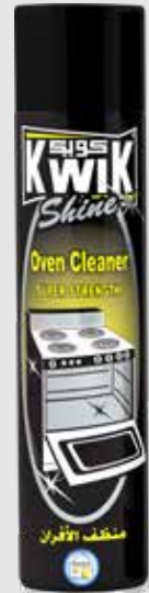
Oven Cleaner Size: 300ml