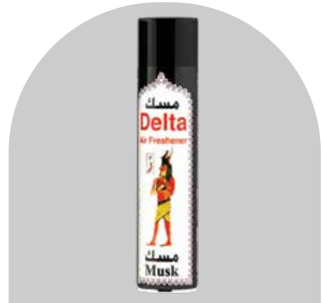
Musk Size: 300ml