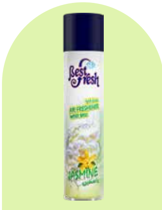
Jasmine Size: 300ml