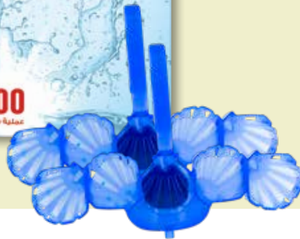
Aqua Size: 2 x 50g