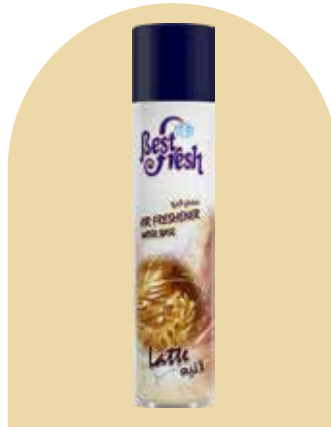
Latte Size: 300ml