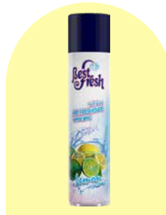
Lemon Size: 300ml