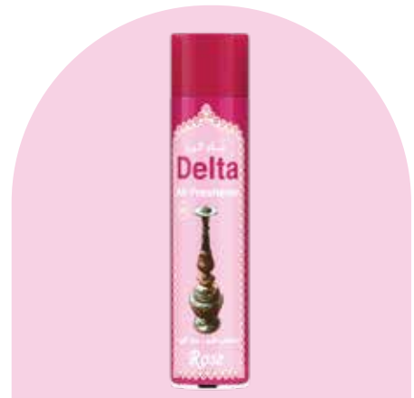
Rose Size: 300ml