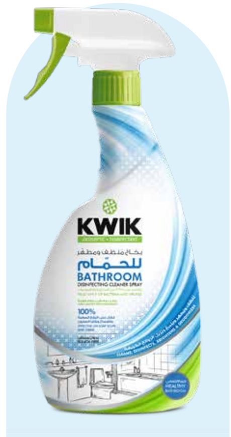
Bathroom Disinfecting Cleaner Spray Size: 500ml