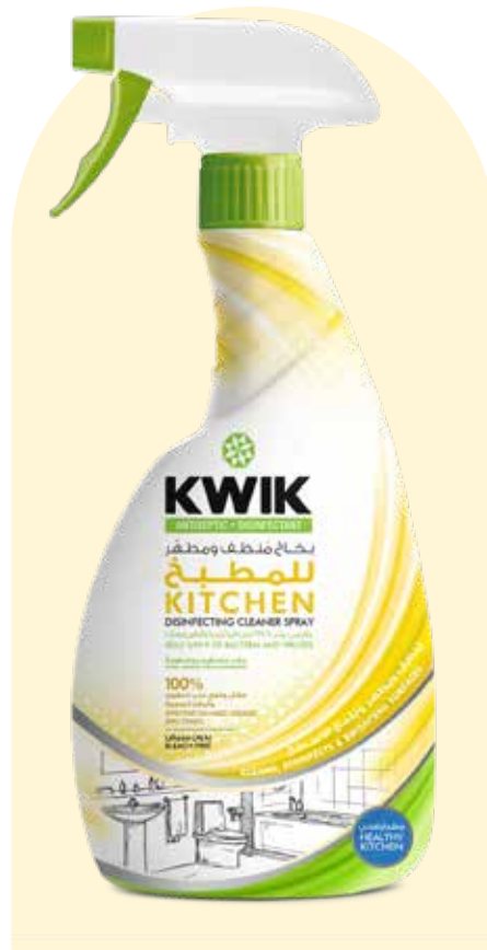
Kitchen Disinfecting Cleaner Spray Classic Size: 500ml