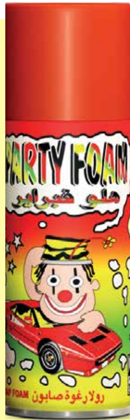
Party Foam Size: 150ml

For any kind of celebration or party, our Snow Party Foam adds that extra something to all your occasions. Now you can enjoy the wild fun of snow any time to make your special days more enjoyable and memorable. Our water-based foam spray will liven-up all special occasions but leave no mess at all! It is friendly on your skin and to your surroundings.