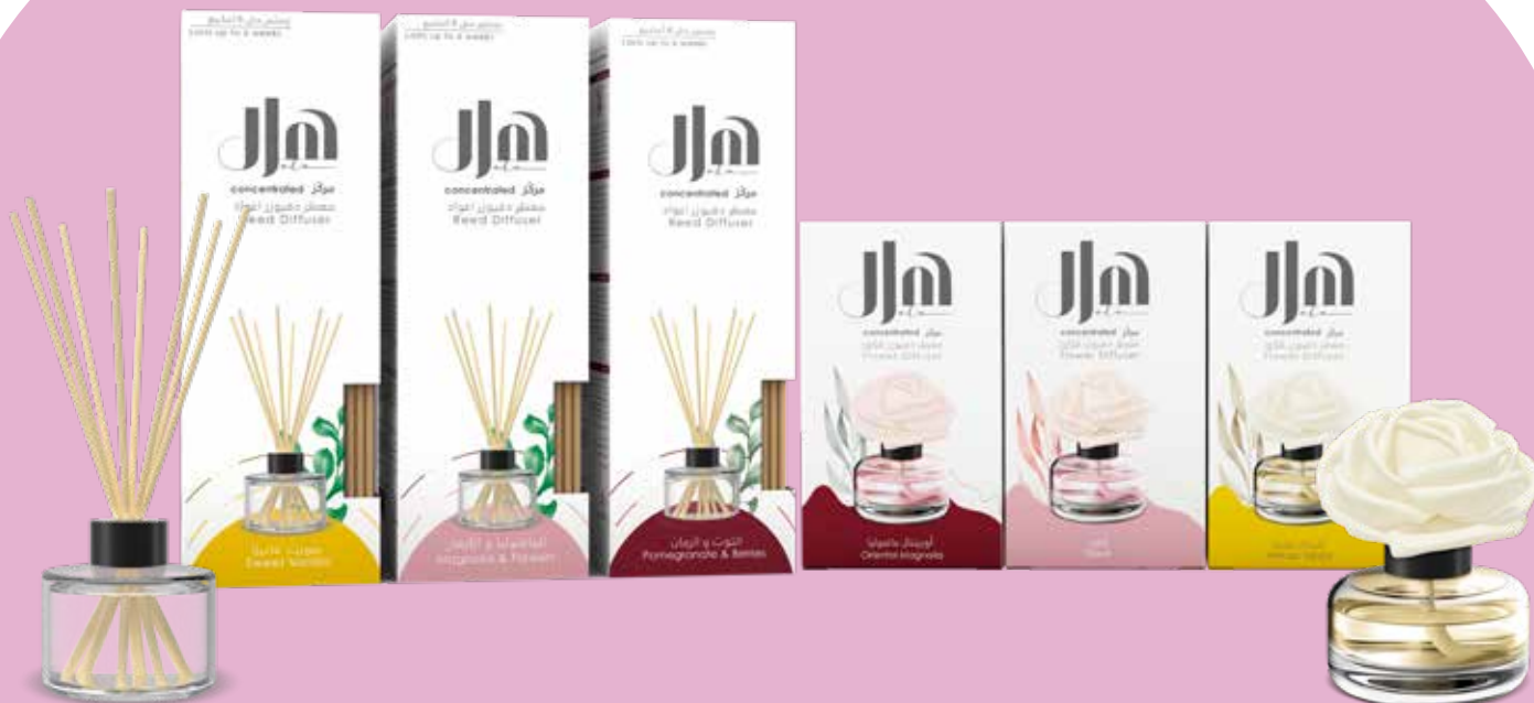
Hala Diffuser Reeds Sweet Vanilla Size: 100ml

This range contains three different fragrances, each of them has its own interesting features.