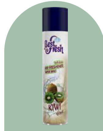
Kiwi Size: 300ml