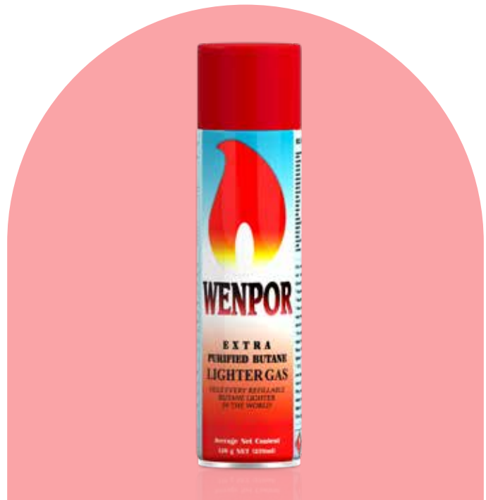
Lighter Gas Size: 250ml