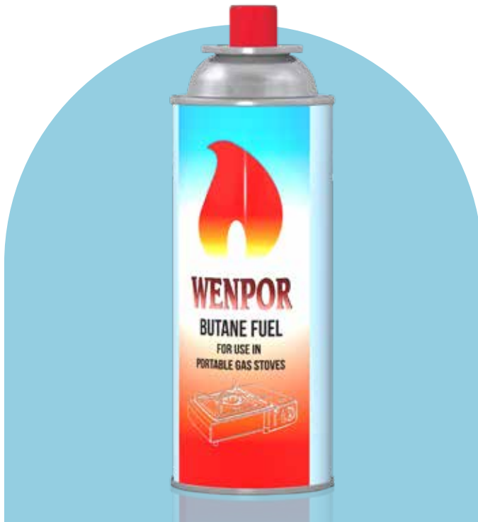
Portable Stoves Gas Size: 220g

Compatible with a diverse variety of camp stoves. Each can lasts approximately 2 to 10 hours of burn time. Automatically reseals when removed from stove. Notched Collar provides easier alignment in portable gas burners! UL Listed (UL Recognized Safety Container for butane fuel).