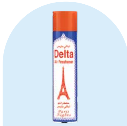
Paris Night Size: 300ml