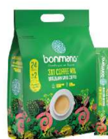
3X1 COFFEE MIX BRAZILIAN GOLD COFFEE