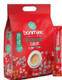
3X1 COFFEE MIX CLASSIC