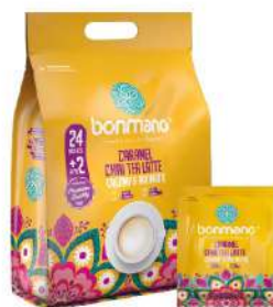
CARAMEL CHAI TEA LATTE