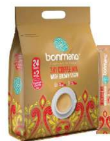
3X1 COFFEE MIX WITH BROWN SUGAR