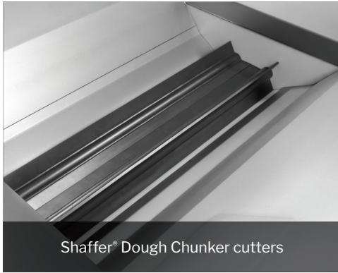
Shaffer® Dough Chunker cutters