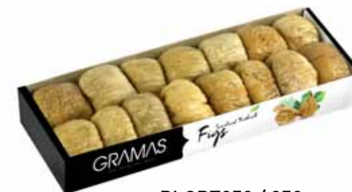
PLCRT250 / 250g 48x250g: 12 kg