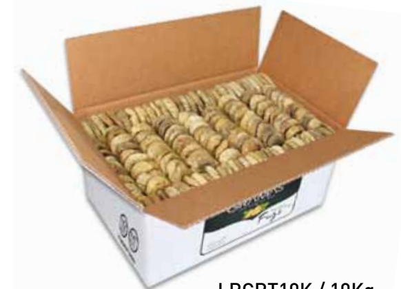
LRCRT10K / 10Kg