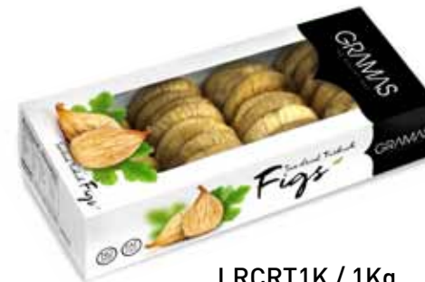
LRCRT1K / 1Kg 12x1kg: 12 kg