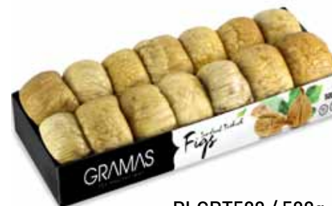
PLCRT500 / 500g 24x500g: 12 kg