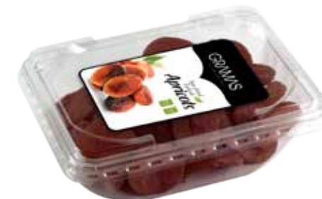
NKPET400 / 400g 24x400g: 9,6 kg