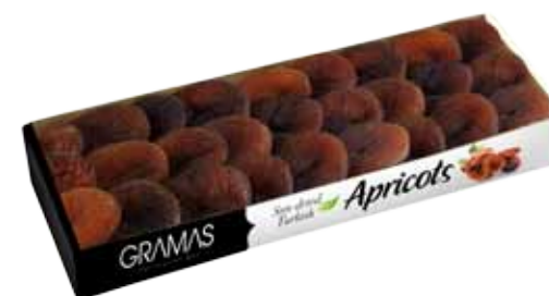
NKCRT500 / 500g 24x500g: 12 kg