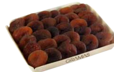
NKWDB400 / 400g 24x400g: 9,6 kg