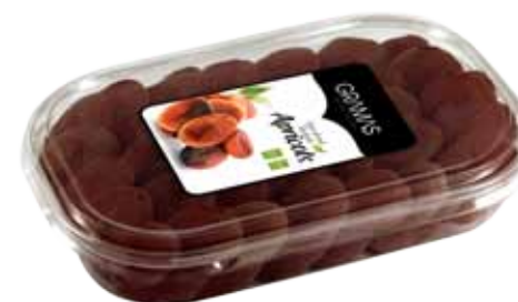
NKPVC500-1 / 500g 12x500g: 6 kg