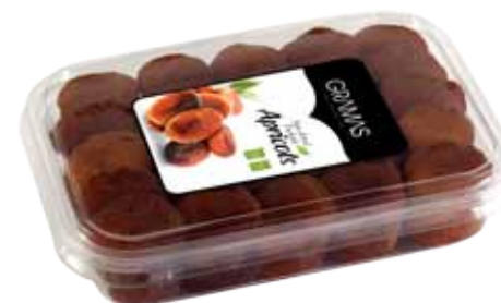
NKPVC500 / 500g 24x500g: 12 kg