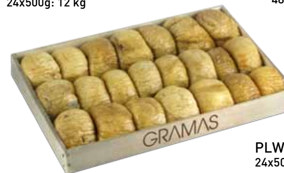
PLWD500 / 500g 24x500g: 12 kg