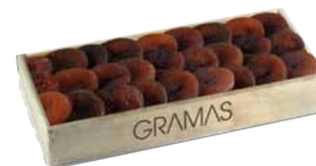
NKWD500 / 500g 12x500g: 6 kg