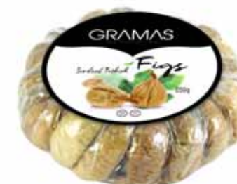
GRCEL250 / 250g 48x250g: 12 kg