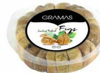
GRVAK500 / 500g 24x500g: 12 kg