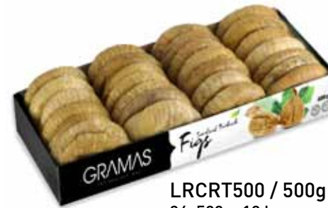
LRCRT500 / 500g 24x500g: 12 kg