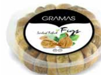
GRVAK250 / 250g 48x250g: 12 kg