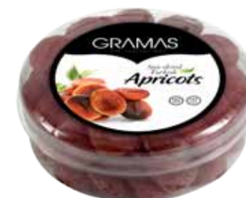
NKPVC250 / 250g 48x250g: 12 kg