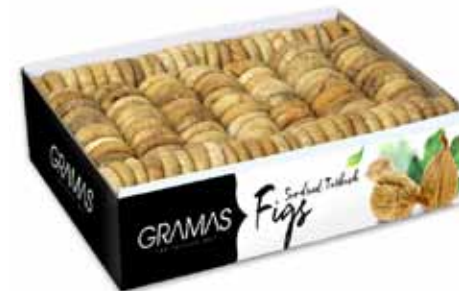
LRCRT5K / 5Kg