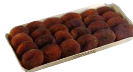
NKWDB200 / 200g 24x200g: 4,8 kg