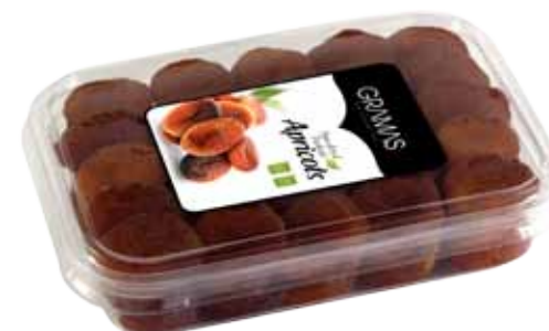
NKPVC400 / 400g 30x400g: 12 kg