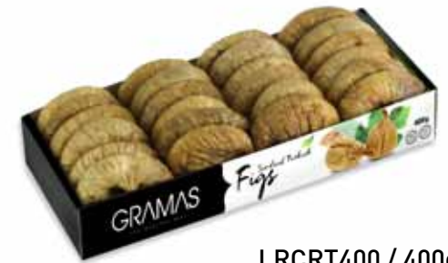
LRCRT400 / 400g 24x400g: 9,6 kg