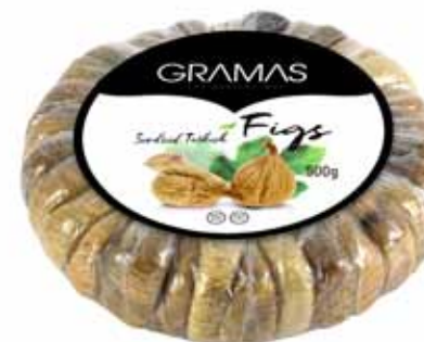
GRCEL500 / 500g 24x500g: 12 kg