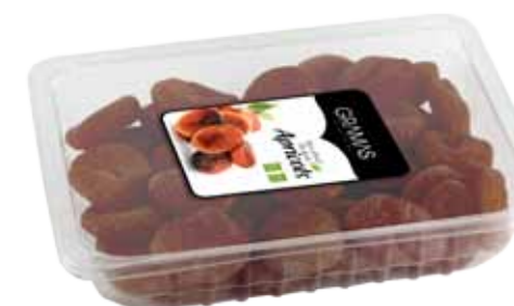
NKVAK400 / 400g 24x400g: 9,6 kg