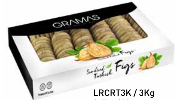
LRCRT3K / 3Kg 4x3kg: 12 kg