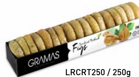
LRCRT250 / 250g 30x250g: 7,5 kg