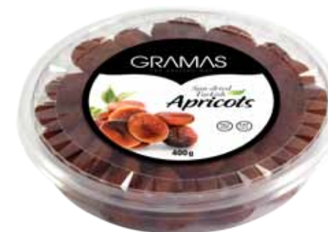
NKPVC400R / 400g 12x400g: 4,8 kg