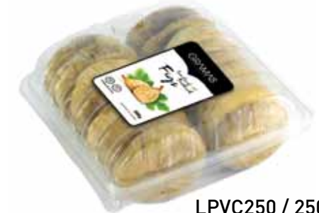
LPVC250 / 250g 30x250g: 7,5 kg