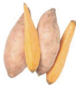
Sweet Potato (Diced)