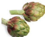
Artichoke Bottom- Quarter