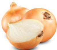
Onions (White/Red) (10x6-10x6)