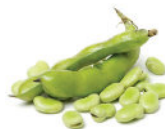
Broad Beans Peeled-Double Peeled