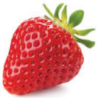
Strawberry (Whole-Diced-Sliced Calibrated-Halves)