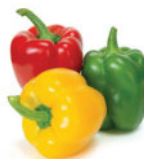
Bell Peppers (Green/Yellow/Red) (Strips-Diced)