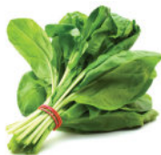
Spinach Minced-Leaves Cubes