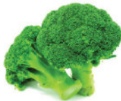
Broccoli (20mm-40mm) (40mm-60mm) (30mm-50mm)