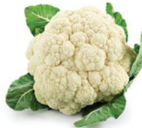
Cauliflower (20mm-40mm) (40mm-60mm) (30mm-50mm)