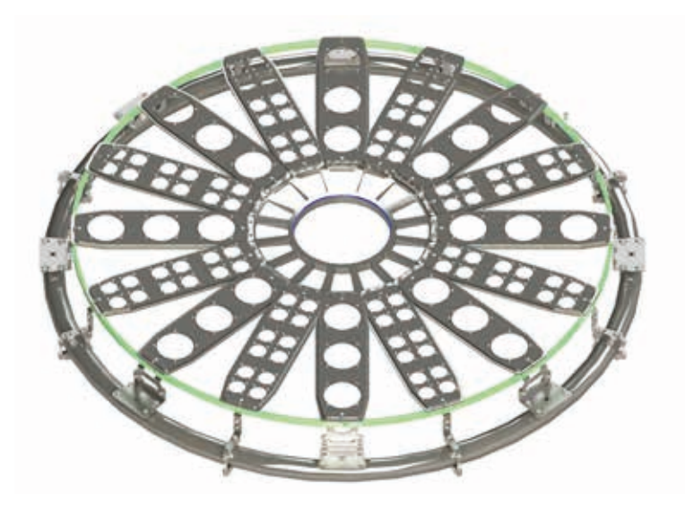
Possible execution with 2 different formats