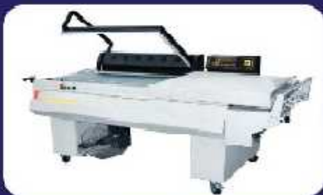
Sleeve Wrapping Machine

Semi Automatic Modular Heat Shrinking Wrapping Machine Model: TS80 Output up to 0-900 packs/hour Sealing bar: 940 x 900 mm