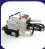
POLI WELDING 10/19