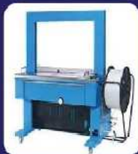
Automatic PP Strapping Machine

Easy operation, simple maintenance Mechanical outside tension control Tension can be easily set with a dial Affordable for every budget