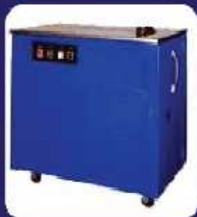
Semi Automatic Strapping Machines

High engineering standard and simple design