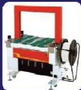
Automatic Strapping Machine Belt Driven

Multiple straps for single, double and continuous strapping or transit mode UP and down stream interlock with complete plug connection