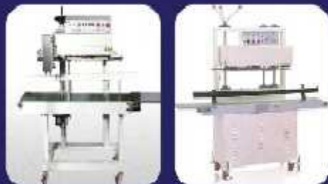
Vertical Band Sealer

Thick and solid body for semi-permanent life Easy operating and replacing for parts Emergency stop button against danger