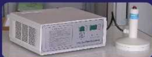
Table Auto Sealer