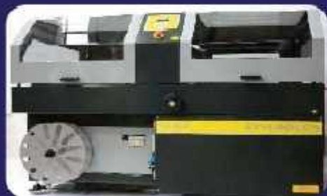
Single Block Wrapping Plant

Automatic L Sealer Model: Model: GTI F00LCS Output up to 3000 packs/hour Sealing bar: 940 x 210 mm