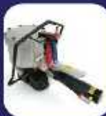
STSR 3 BUTTONS 19/32