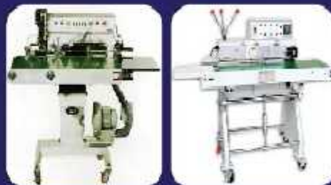
Horizontal Band Sealer

Sealing width: 6, 10, 16 mm Sealing temperature : U-38U Cooling Type : Forced air cooling (1bar) Power Supply: 230V, AC, 50Hz, 1ph, Electric Height: Adjusting device (Standard)