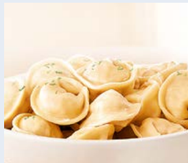
Semi-finished dough products