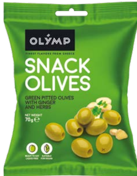
Green Pitted Olives with Ginger and Herbs