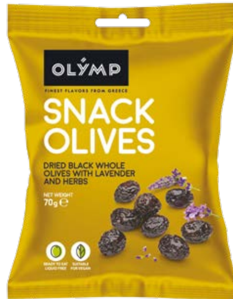
Dried Black Whole Olives with Lavender and Herbs