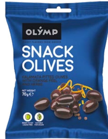
Kalamata Pitted Olives with Orange peel and Herbs