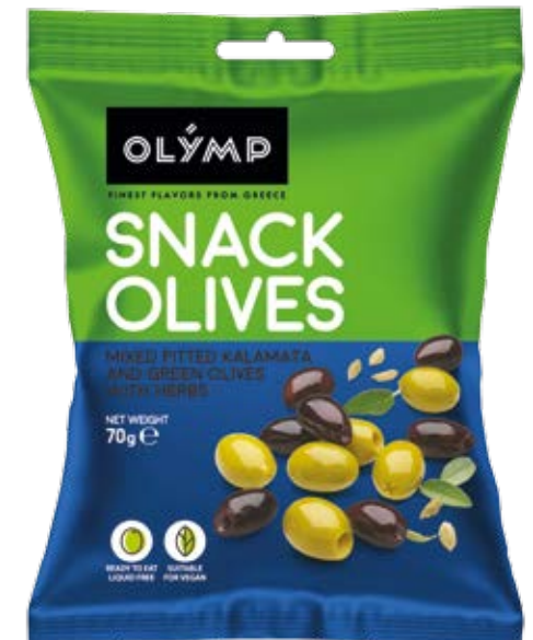
Mixed Pitted Kalamata and Green Olives with Herbs