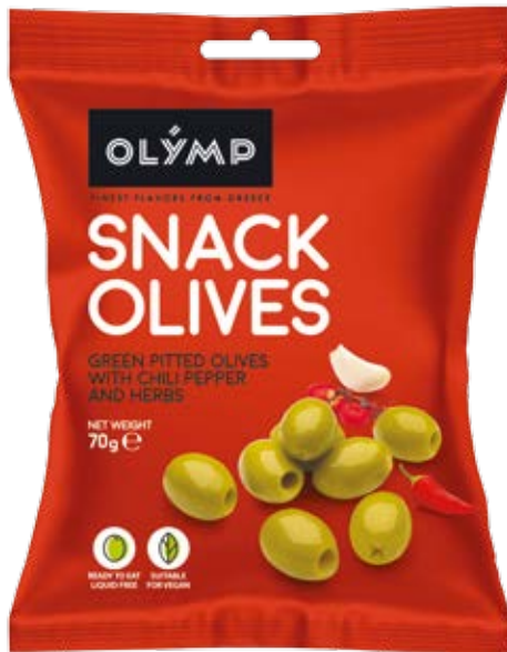
Green Pitted Olives with Chili Pepper and Herbs