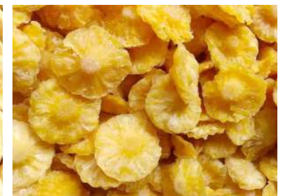
Dried Pineapple (SOFT)