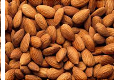
Almond (WHOLE & SLICE)