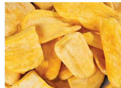
Dried Jackfruit (HARD)