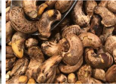
Salted Roasted Cashew Nuts With Skin