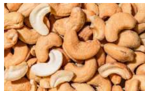
Salted Roasted Cashew Nuts