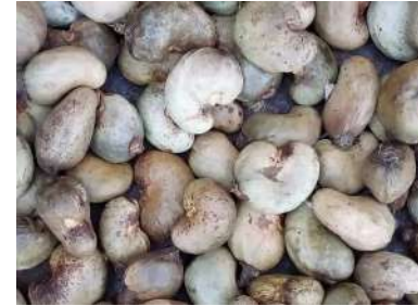
Raw Cashew Nuts

Our customers are all over the world: Europe, Middle East (UAE, Jordan, Qatar, Saudi Arabia, etc.), America, Canada, Australia, South Africa, Asia (China, Taiwan, Japan, Korea, India, etc.).