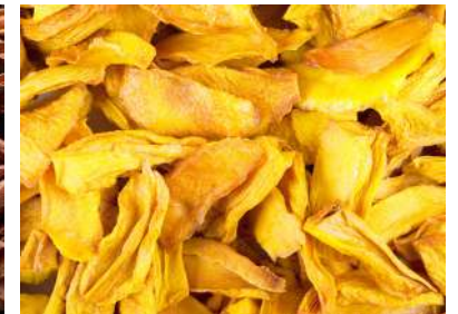
Dried Mango (SOFT)