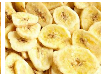
Dried Banana (HARD)