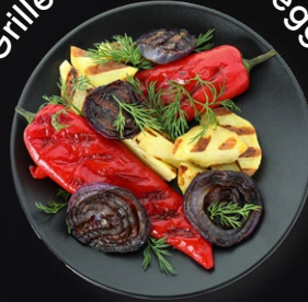
Grilled & Roasted Veggies