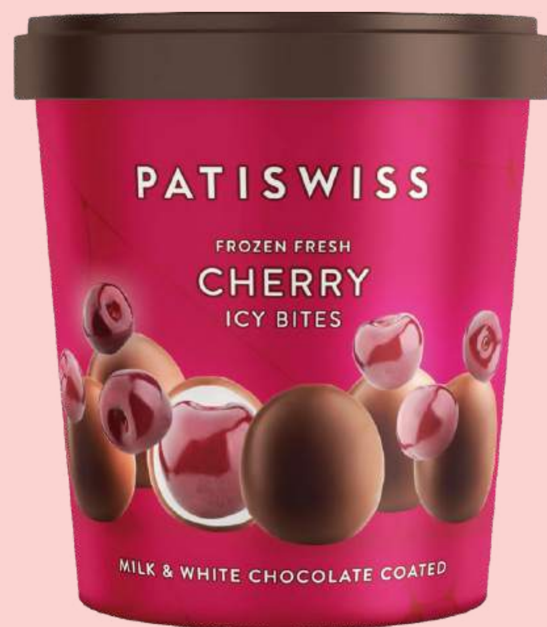
Milk & White Chocolate Coated Cherry Icy Bites 250g