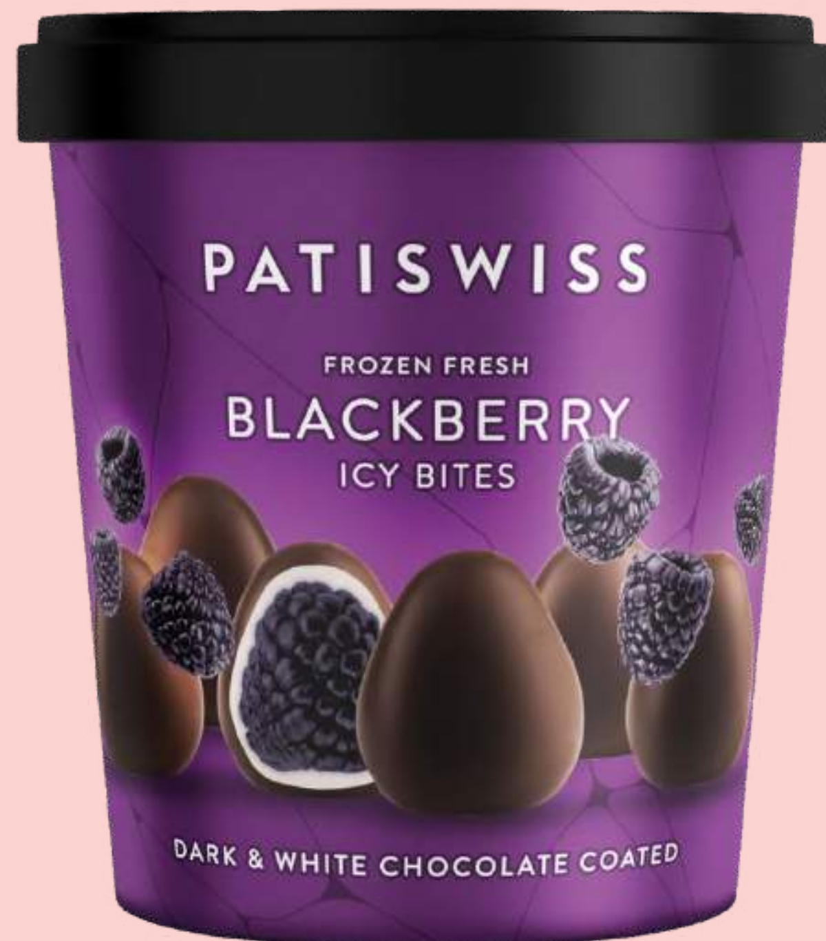
Dark & White Chocolate Coated Blackberry Icy Bites 250g