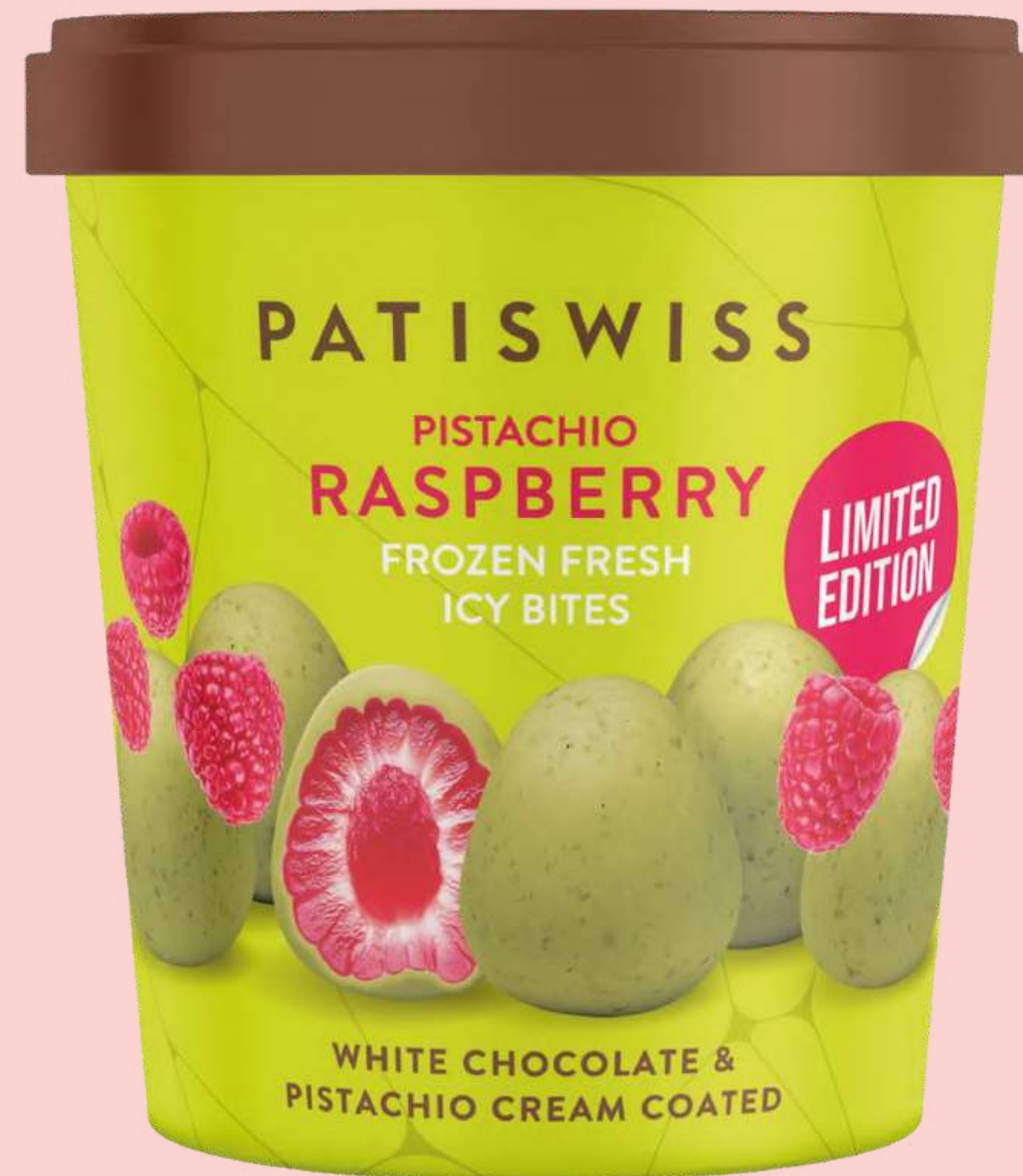
White Chocolate with Pistachio Raspberry Cream Coated Icy Bites 250g