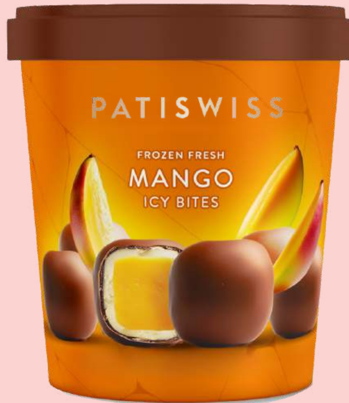
Milk & White Chocolate Coated Mango Icy Bites 250g