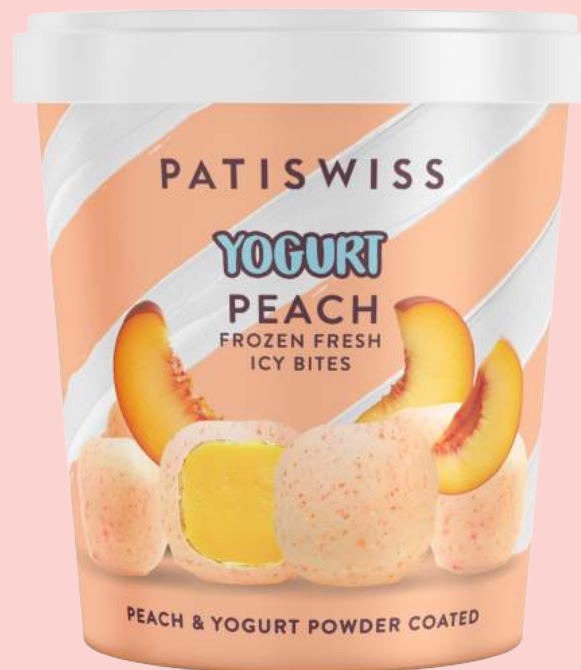
Peach & Yogurt Powder Coated Peach Icy Bites 250g