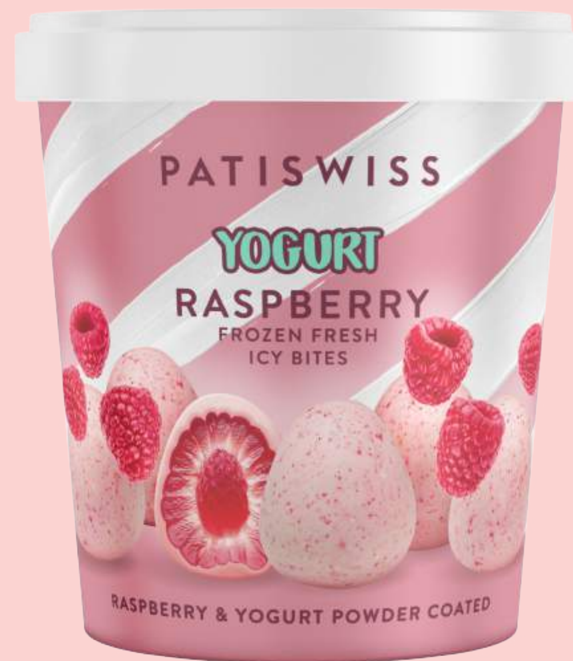
Raspberry & Yogurt Powder Coated Raspberry Icy Bites 250g