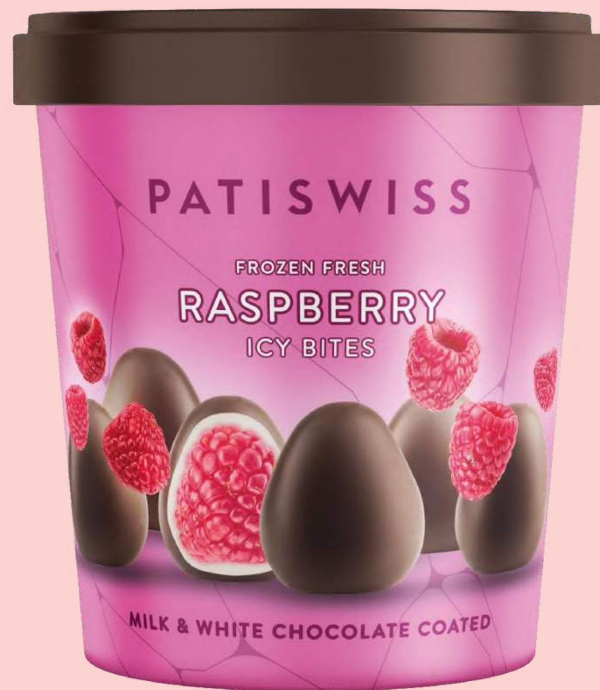
Milk & White Chocolate Coated Raspberry Icy Bites 250g