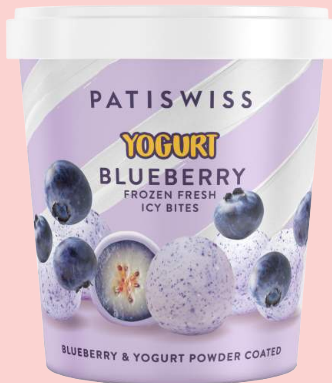
Blueberry & Yogurt Powder Coated Blueberry Icy Bites 250g