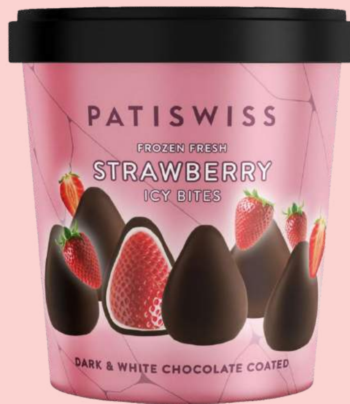
Dark & White Chocolate Coated Strawberry Icy Bites 250g