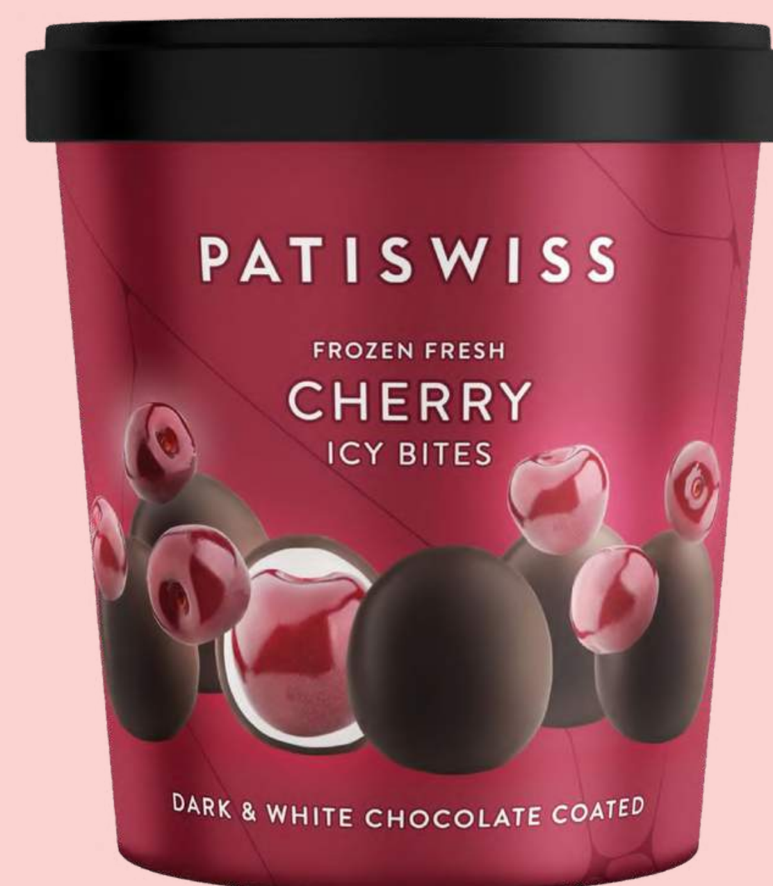
Dark & White Chocolate Coated Cherry Icy Bites 250g