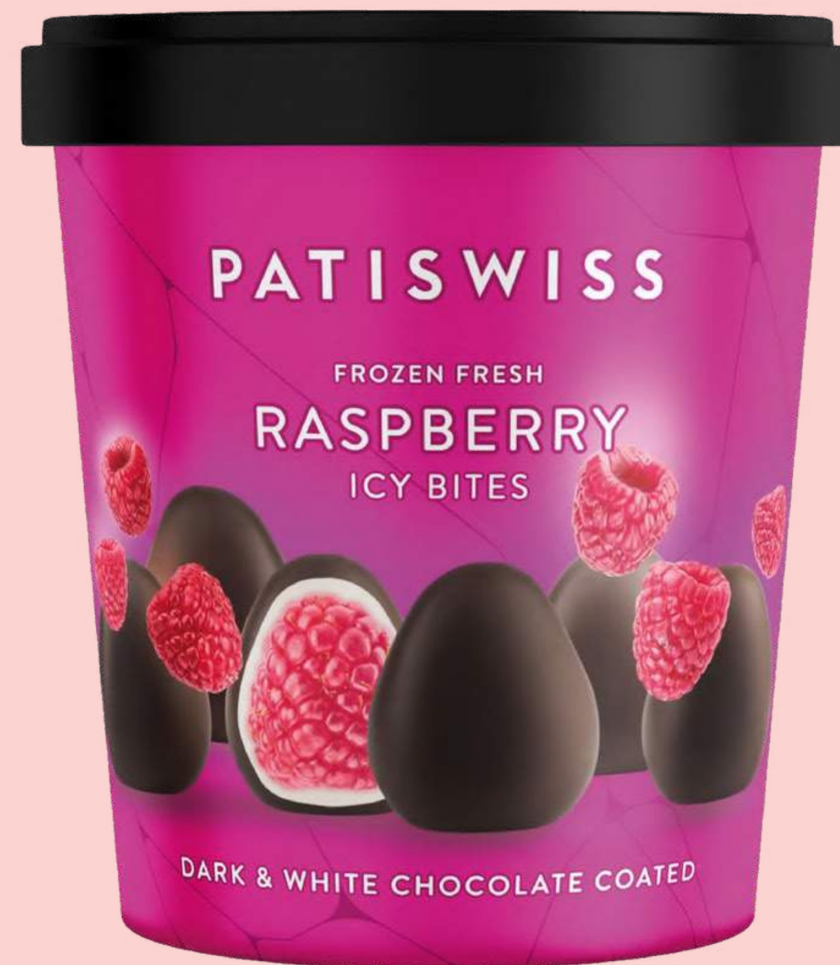
Dark & White Chocolate Coated Raspberry Icy Bites 250g