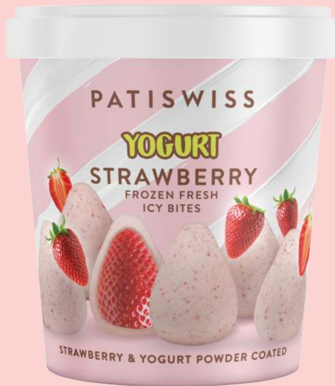
Strawberry & Yogurt Powder Coated Strawberry Icy Bites 250g