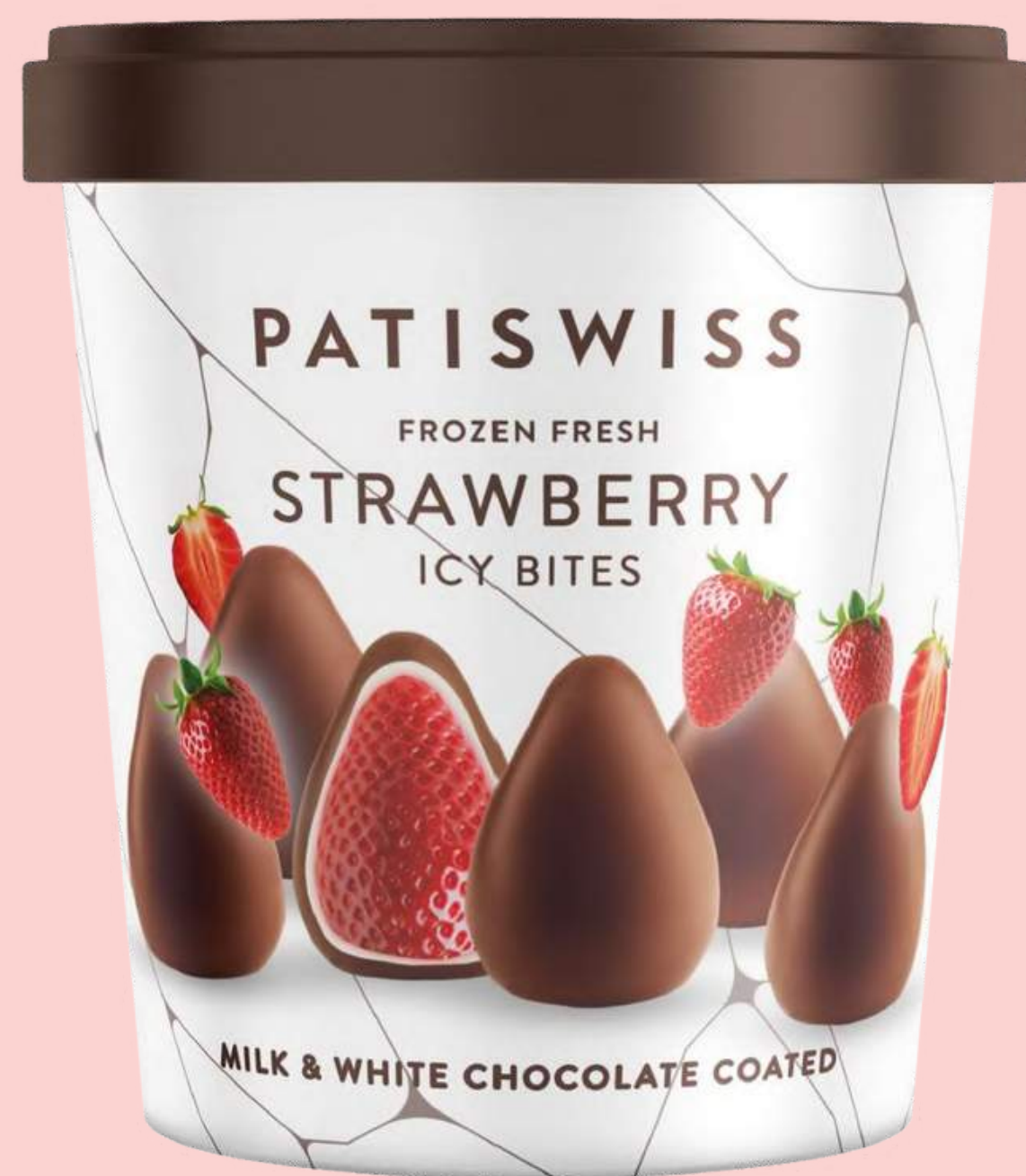
Milk & White Chocolate Coated Strawberry Icy Bites 250g