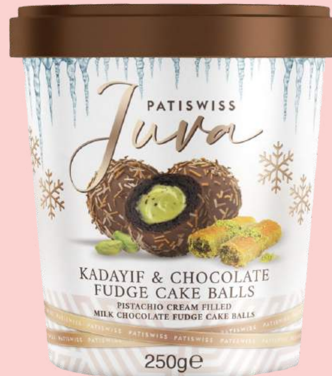
Kadayif & Chocolate Fudge Cake Balls Icy Bites 250g

BETTER AND HEALTHIER ALTERNATIVE TO ICE-CREAM with real frozen fresh berries