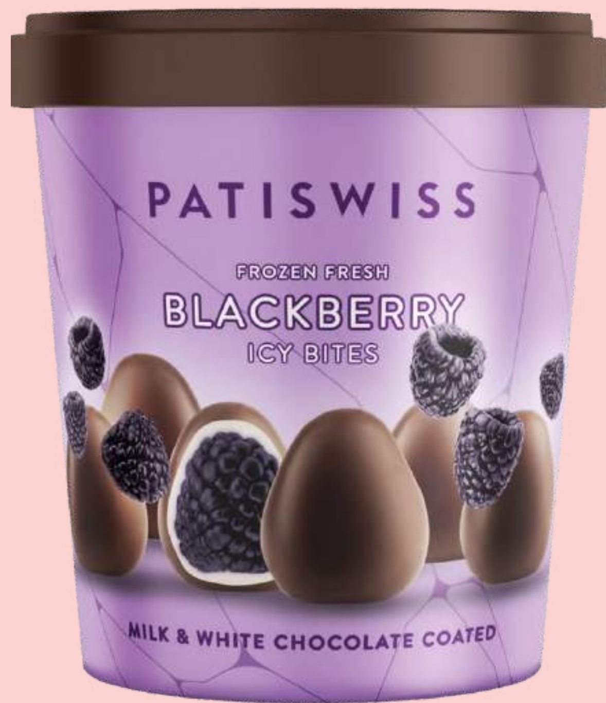
Milk & White Chocolate Coated Blackberry Icy Bites 250g