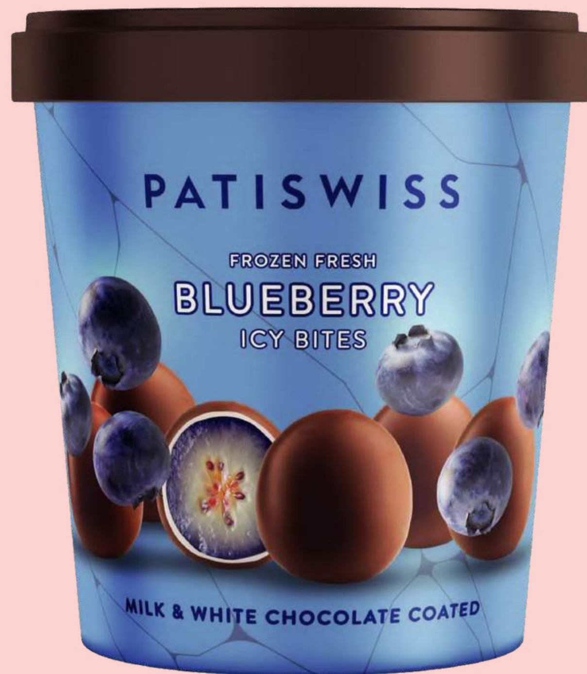
Milk & White Chocolate Coated Blueberry Icy Bites 250g