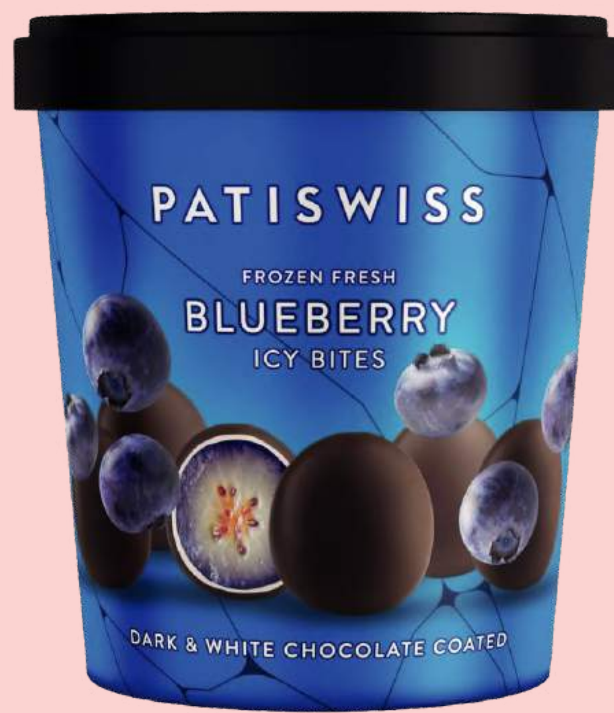
Dark & White Chocolate Coated Blueberry Icy Bites 250g