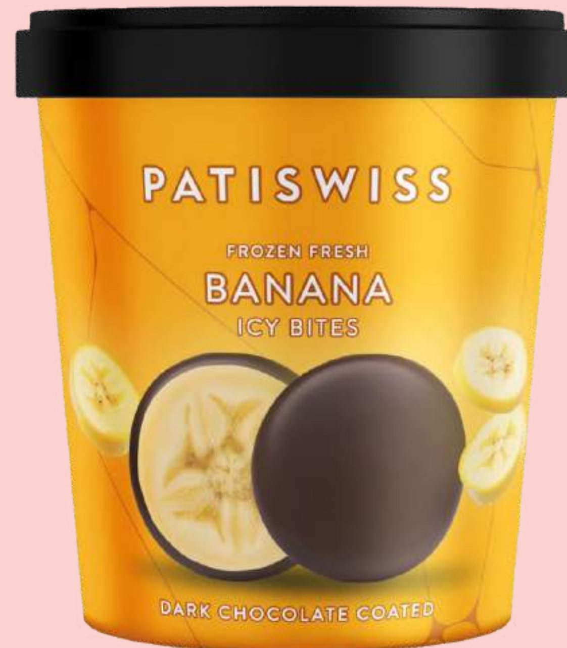
Dark Chocolate Coated Banana Icy Bites 250g