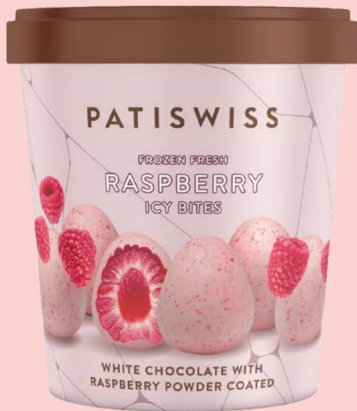
White Chocolate with Raspberry Powder Coated Icy Bites 250g