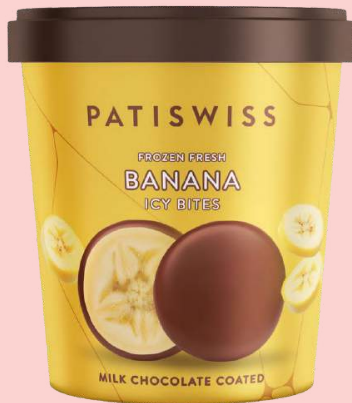
Milk Chocolate Coated Banana Icy Bites 250g