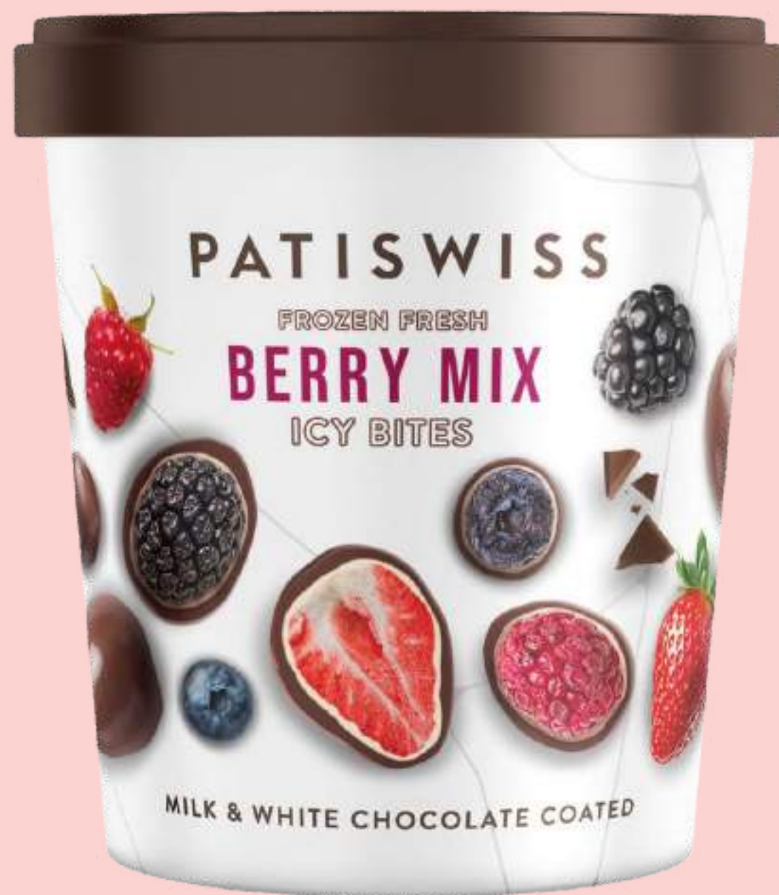
Milk & White Chocolate Coated Berry Mix Icy Bites 250g