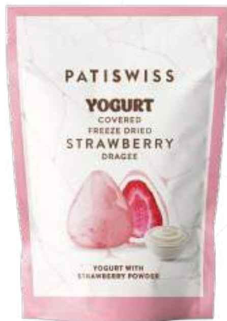
Yogurt covered Strawberry Powder Strawberry Dragee 80g