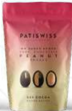
NO SUGAR ADDED Dark Chocolate Peanut Dragee 80g