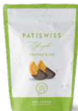
NO SUGAR ADDED Milk Chocolate Salted Orange Slice 80g