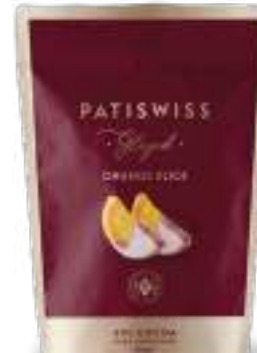
Ruby Chocolate Orange Slice 80g