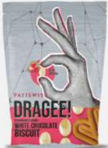
Biscuit Dragee Coated with Strawberry Flavored White Chocolate 80g