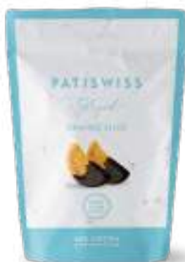
NO SUGAR ADDED Dark Chocolate Salted Orange Slice 80g