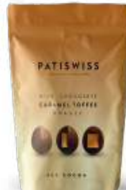
Milk Chocolate Caramel Toffee Dragee 80g