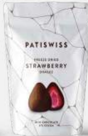
Milk Chocolate Strawberry Dragee 80g