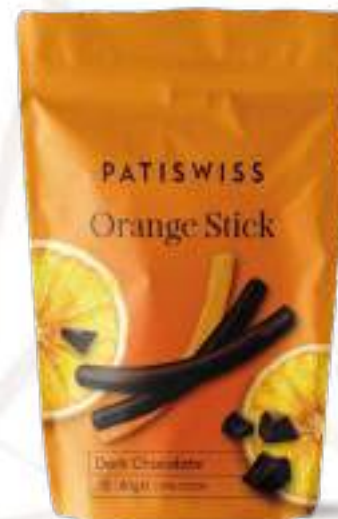
Dark Chocolate Orange Stick 80g