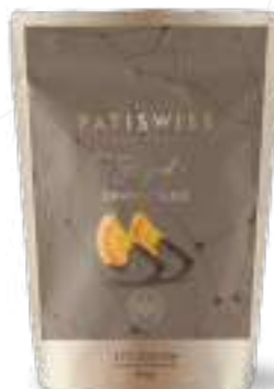
Milk Chocolate Orange Slice 80g