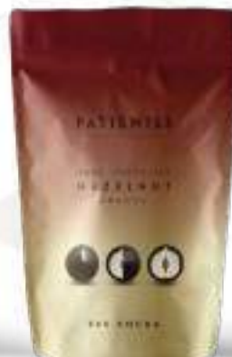
Dark Chocolate Hazelnut Dragee 80g