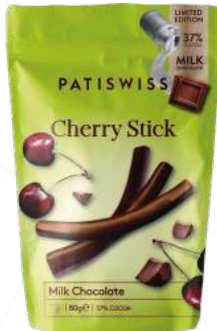
Milk Chocolate Cherry Stick 80g