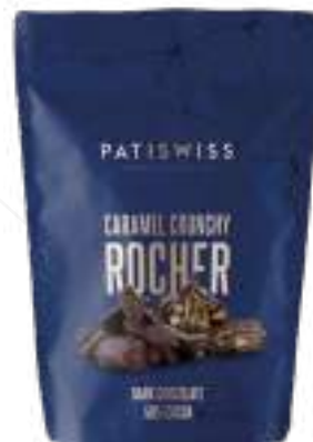
Milk Chocolate Crunchy Rocher 80g