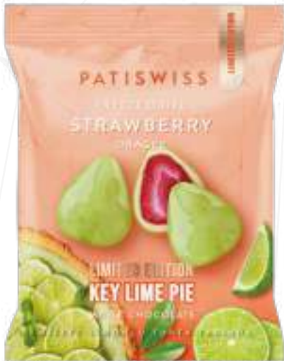
White Chocolate Key Lime Pie Strawberry Dragee 50g