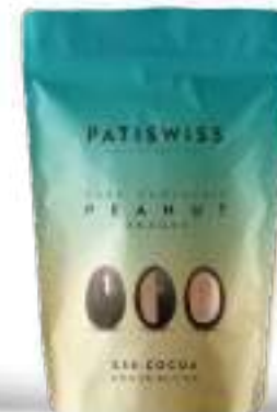
Dark Chocolate Peanut Dragee 80g