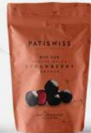
Bite Size Dark Chocolate Dragee 80g