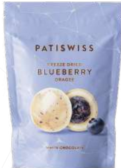
White Chocolate Covered Blueberry Dragee 80g