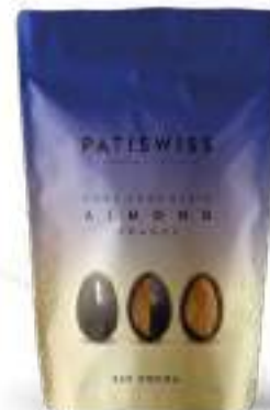
Dark Chocolate Almond Dragee 80g