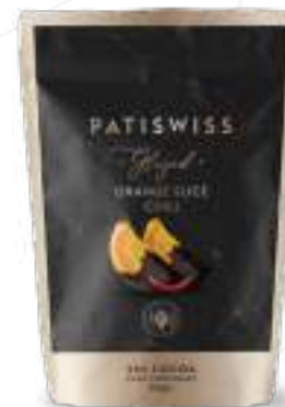
Dark Chocolate Chili Pepper Orange Slice 80g