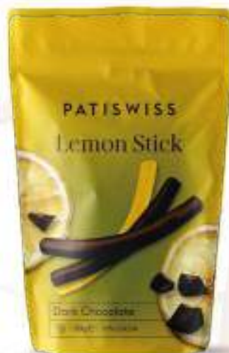
Dark Chocolate Lemon Stick 80g