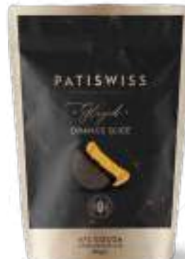
Dark Chocolate Orange Stick 80g