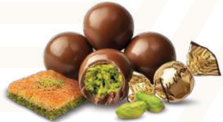
Kadayıf and Pistachio Cream Filled Milk Chocolate Truffle 100g