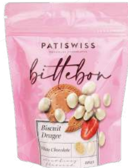
Strawberry Flavored White Chocolate Covered Biscuit Dragee 120g