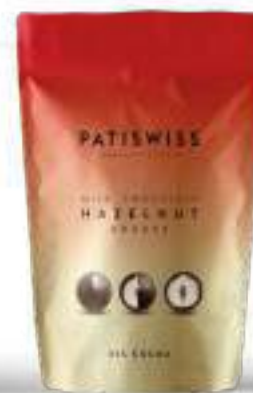
Milk Chocolate Hazelnut Dragee 80g