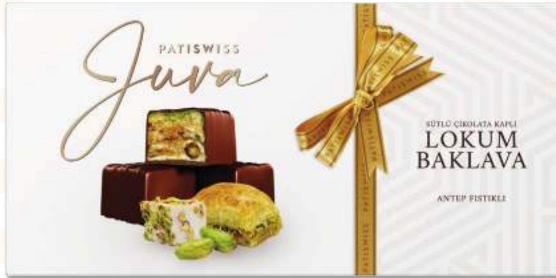
Milk Chocolate Covered Pistachio Baklava Crumb Turkish Delight