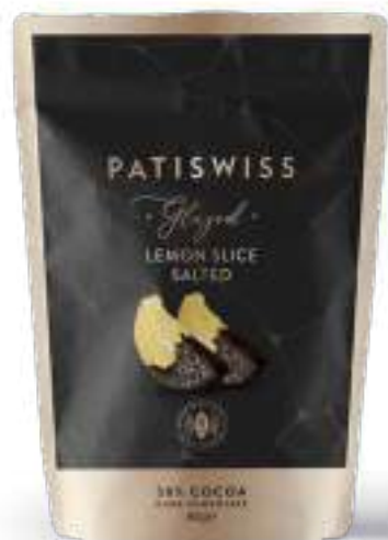
Dark Chocolate Salted Lemon Slice 80g