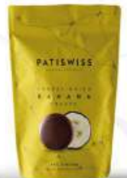
Milk Chocolate Banana Dragee 80g