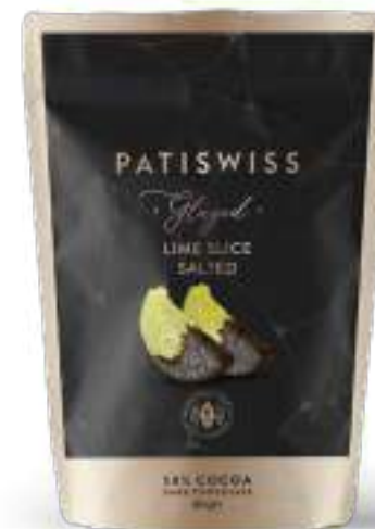
Dark Chocolate Salted Lime Slice 80g