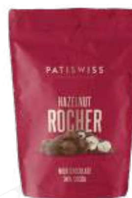
Milk Chocolate Hazelnut Rocher 80g