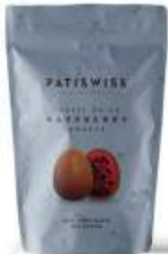
Milk Chocolate Raspberry Dragee 80g