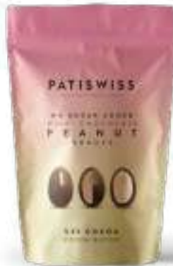
NO SUGAR ADDED Milk Chocolate Peanut Dragee 80g