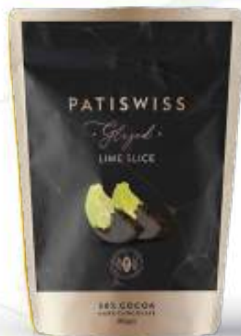
Dark Chocolate Lime Slice 80g