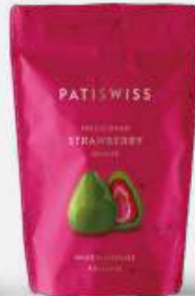
Pistachio White Chocolate Strawberry Dragee 80g