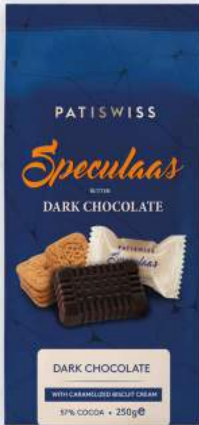
Dark Chocolate with Caramelized Biscuit Cream 250g