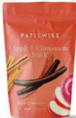
Dark Chocolate Apple & Cinnamon Stick 80g