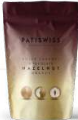
Dolce Caramel Chocolate Hazelnut Dragee 80g