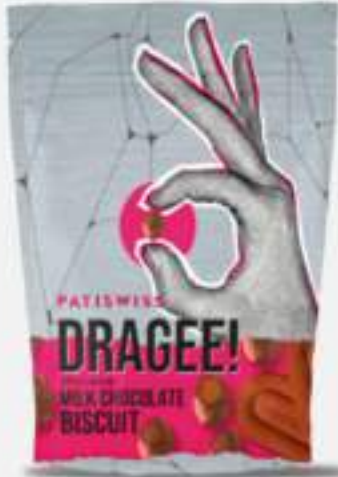
Coffee Flavored Milk Chocolate Covered Cocoa Biscuit Dragee 80g