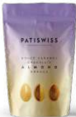
Dolce Caramel Chocolate Almond Dragee 80g