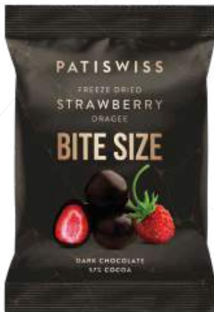
Bite Size Dark Chocolate Strawberry Dragee 30g