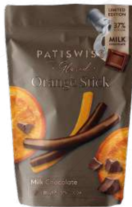
Milk Chocolate Orange Stick 80g