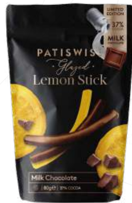
Milk Chocolate Lemon Stick 80g