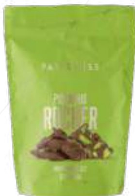
Milk Chocolate Pistachio Rocher 80g