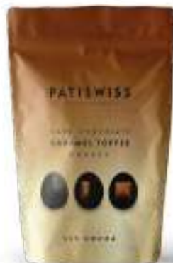
Dark Chocolate Caramel Toffee Dragee 80g