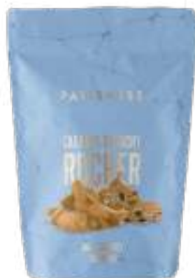
Dolce Caramel Chocolate Crunchy Rocher 80g