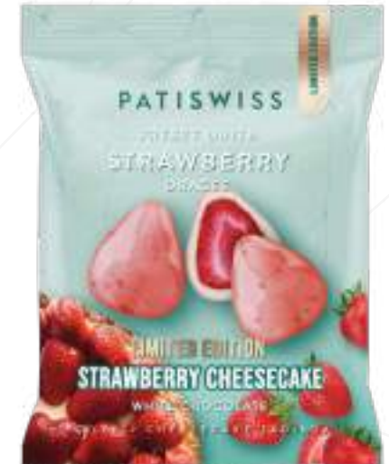
White Chocolate Strawberry Cheesecake Strawberry Dragee 50g