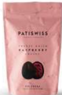
Dark Chocolate Raspberry Dragee 80g