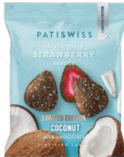
Milk Chocolate Coconut Strawberry Dragee 50g