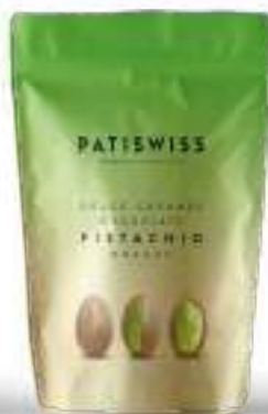
Dolce Caramel Chocolate Pistachio Dragee 80g