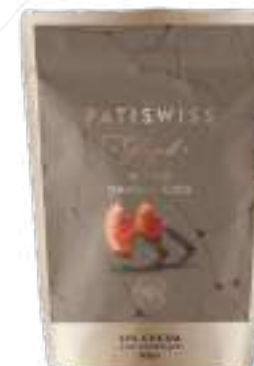
Milk Chocolate Blood Orange Slice 80g