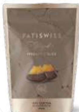
Milk Chocolate Pineapple Slice 80g