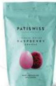
Ruby Chocolate Raspberry Dragee 80g