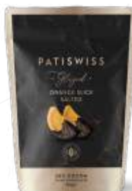
Dark Chocolate Salted Orange Slice 80g