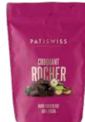
Milk Chocolate Croquant Rocher 80g