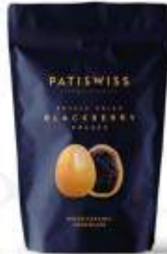
Dolce Caramel Chocolate Blackberry Dragee 80g