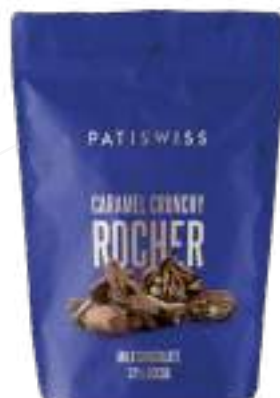
Dark Chocolate Caramel Crunchy Rocher 80g