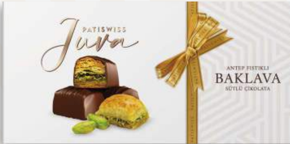
Milk Chocolate Covered Baklava with Pistachio