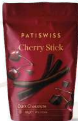
Dark Chocolate Cherry Stick 80g