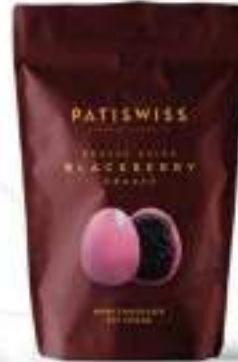
Ruby Chocolate Blackberry Dragee 80g