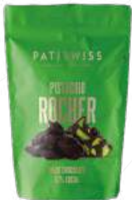
Dark Chocolate Pistachio Rocher 80g