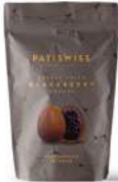
Milk Chocolate Blackberry Dragee 80g