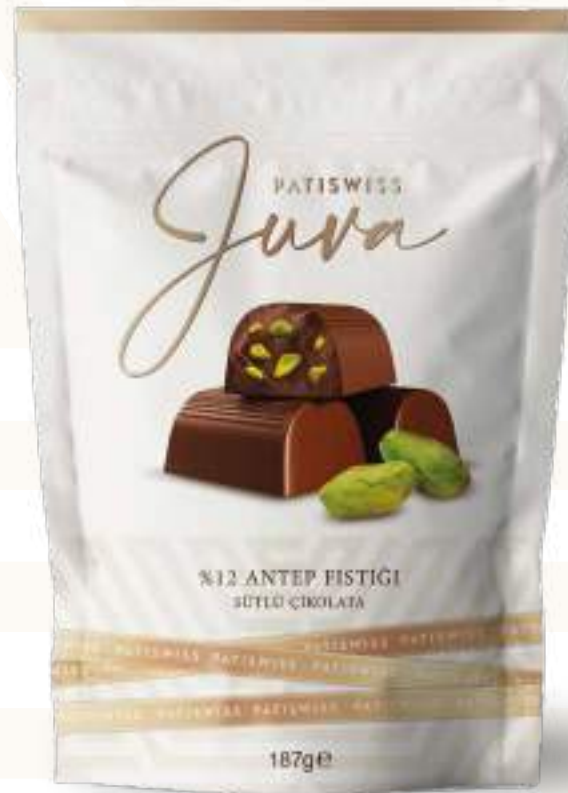
Milk Chocolate with Pistachio 187g