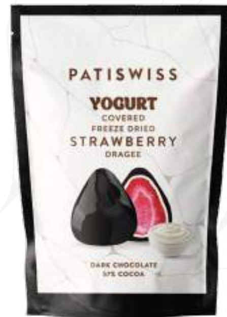
Yogurt covered Dark Chocolate Strawberry Dragee 80g