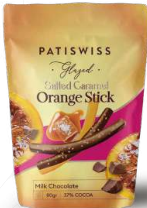
Milk Chocolate Salted Caramel Orange Stick 80g