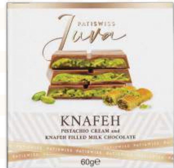
Pistachio Cream and Knafeh Filled Milk Chocolate 60g