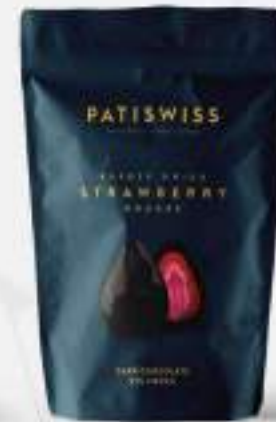
85% Dark Chocolate Strawberry Dragee 80g