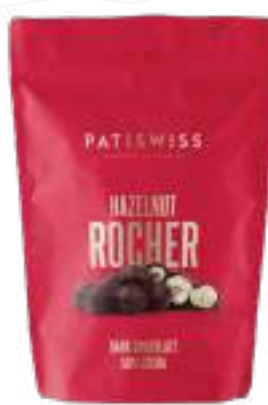
Dark Chocolate Hazelnut Rocher 80g