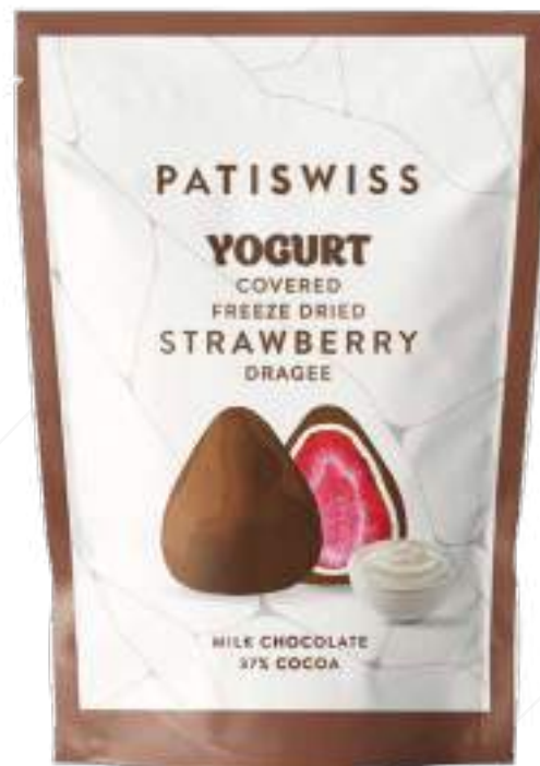
Yogurt covered Milk Chocolate Strawberry Dragee 80g