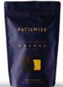
Dark Chocolate Orange Dragee 80g