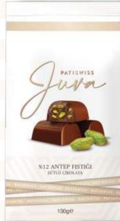
Milk Chocolate with Pistachio 130g