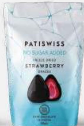
NO SUGAR ADDED Dark Chocolate Strawberry Dragee 80g