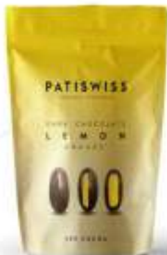
Dark Chocolate Lemon Dragee 80g