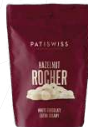
White Chocolate Hazelnut Rocher 80g