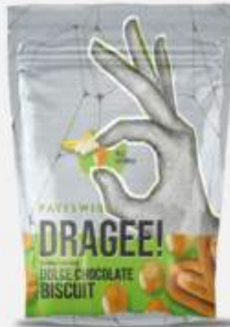
Biscuit Dragee Coated with Banana Flavored White Chocolate 80g