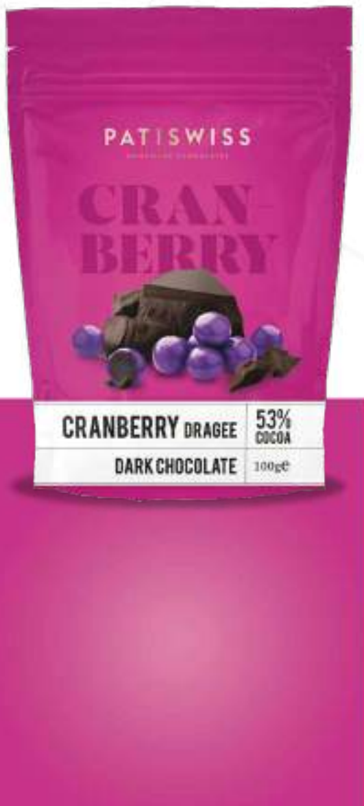
Cranberry Dragee with Dark Chocolate 100g