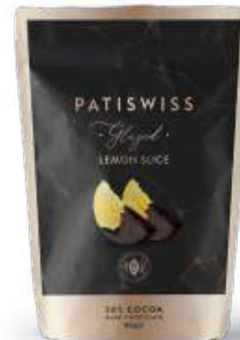
Dark Chocolate Lemon Slice 80g