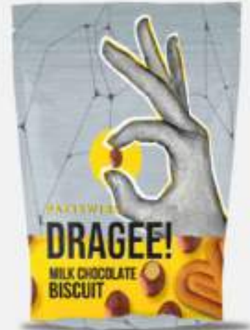
Biscuit Dragee Coated Milk Chocolate 80g