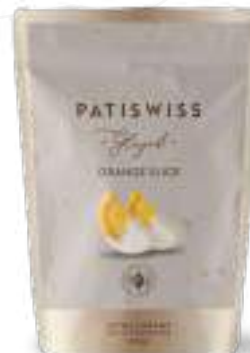
White Chocolate Orange Slice 80g