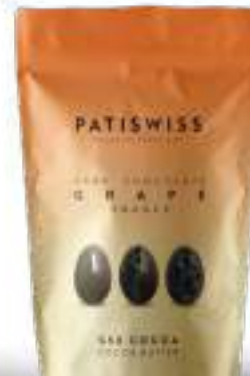
Dark Chocolate Grape Dragee 80g