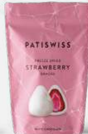
White Chocolate Strawberry Dragee 80g