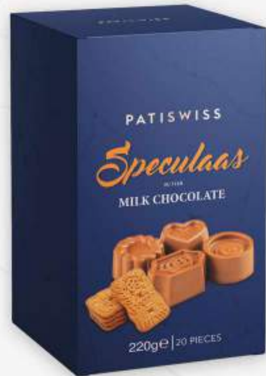
Speculaas Butter Milk Chocolate 220g