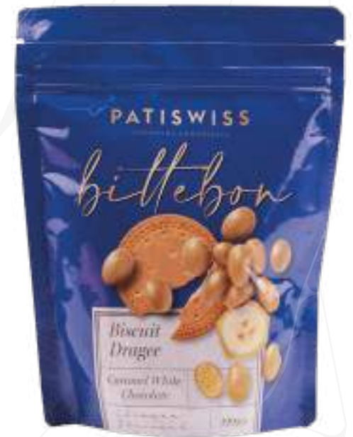
Banana Flavored Caramel White Chocolate Covered Biscuit Dragee 120g