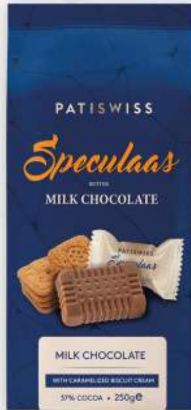
Milk Chocolate with Caramelized Biscuit Cream 250g