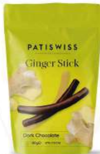
Dark Chocolate Ginger Stick 80g