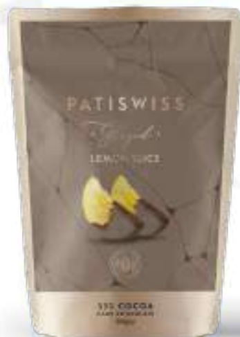
Milk Chocolate Lemon Slice 80g