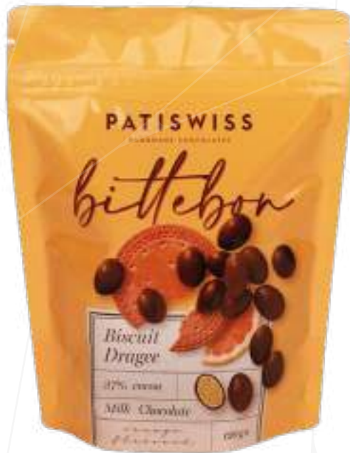
Orange Flavored Dark Chocolate Covered Biscuit Dragee 120g