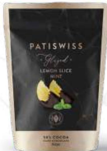
Dark Chocolate Mint Lemon Slice 80g