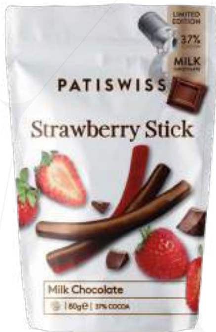
Milk Chocolate Strawberry Stick 80g