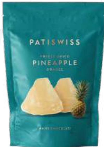
White Chocolate Covered Pineapple Dragee 80g