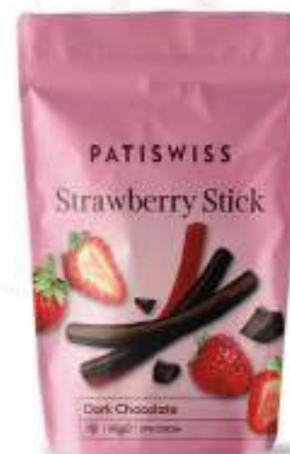
Dark Chocolate Strawberry Stick 80g