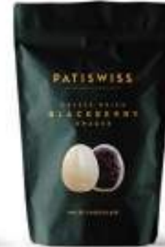
White Chocolate Blackberry Dragee 80g