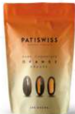
Dark Chocolate Orange Dragee 80g