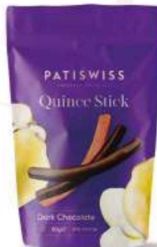
Dark Chocolate Quince Stick 80g