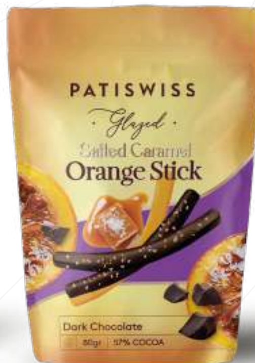
Dark Chocolate Salted Caramel Orange Stick 80g