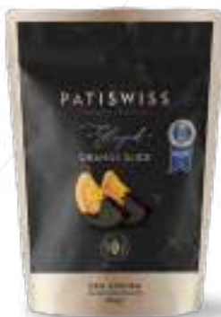
Dark Chocolate Orange Slice 80g