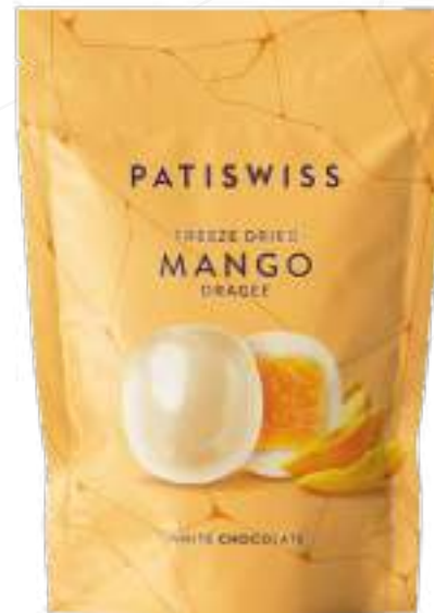
White Chocolate Covered Mango Dragee 80g