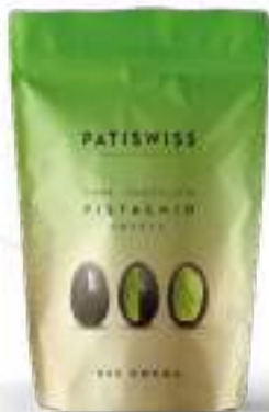
Dark Chocolate Pistachio Dragee 80g