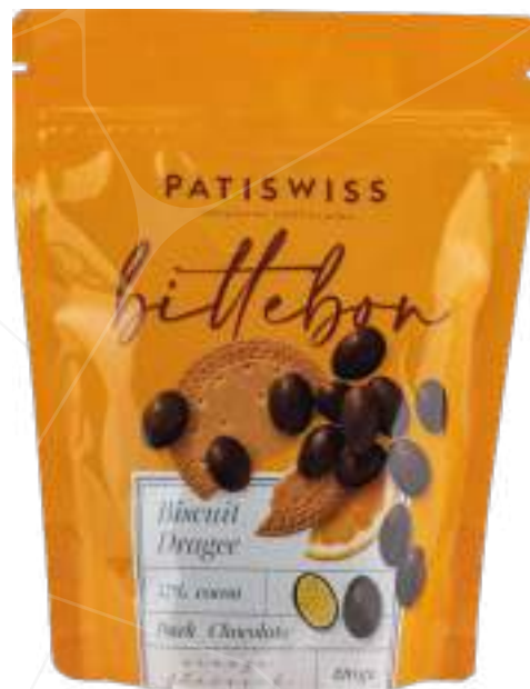
Orange Flavored Milk Chocolate Covered Biscuit Dragee 120g