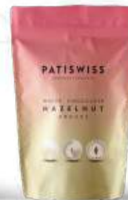
White Chocolate Hazelnut Dragee 80g