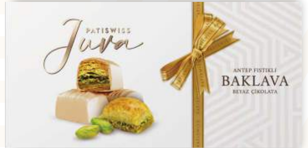
White Chocolate Covered Baklava with Pistachio