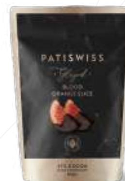
Dark Chocolate Blood Orange Slice 80g