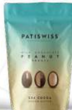
Milk Chocolate Peanut Dragee 80g