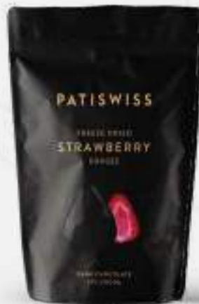
Dark Chocolate Strawberry Dragee 80g