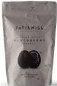
Dark Chocolate Blackberry Dragee 80g