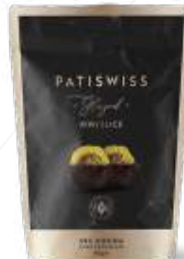
Dark Chocolate Kiwi Slice 80g