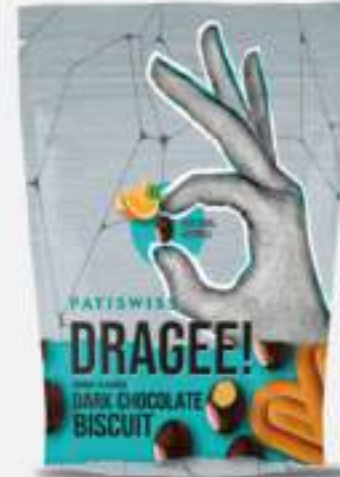
Biscuit Dragee Coated with Orange Flavored Dark Chocolate 80g