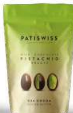
Milk Chocolate Pistachio Dragee 80g