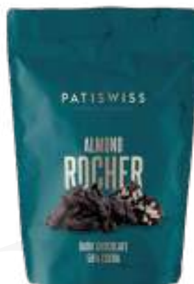
Dark Chocolate Almond Rocher 80g