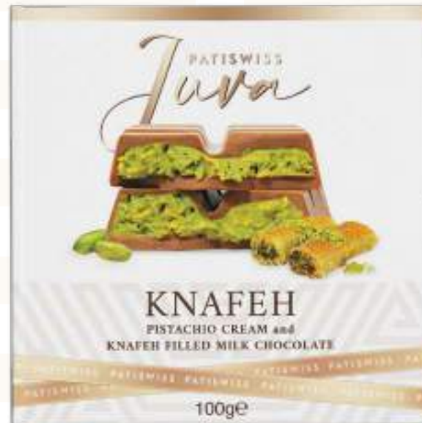
Pistachio Cream and Knafeh Filled Milk Chocolate 100g