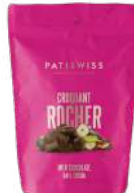
Dark Chocolate Croquant Rocher 80g