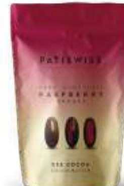
Dark Chocolate Raspberry Dragee 80g