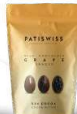
Milk Chocolate Grape Dragee 80g