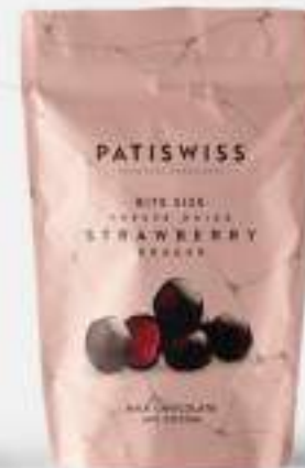
Bite Size Milk Chocolate Dragee 80g