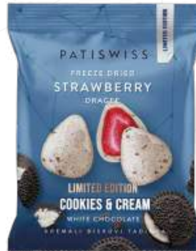
White Chocolate Cookies & Cream Strawberry Dragee 50g