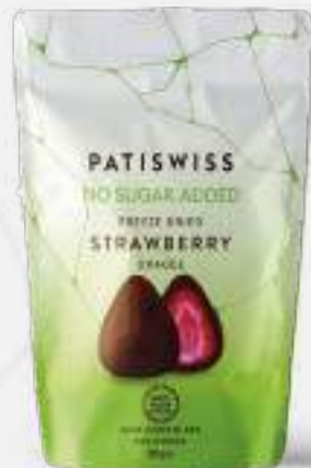
NO SUGAR ADDED Milk Chocolate Strawberry Dragee 80g