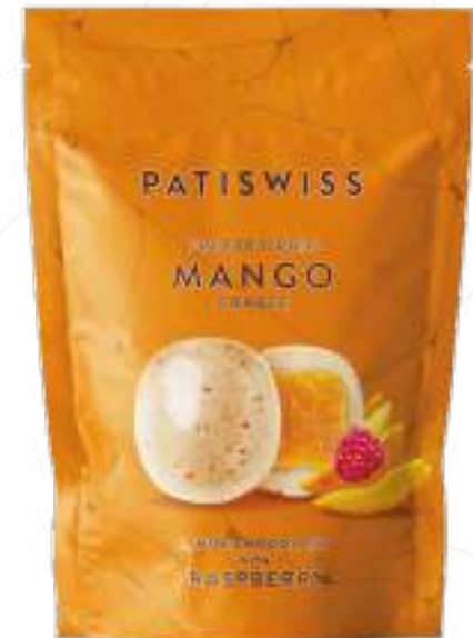
White Chocolate Covered Raspberry Powder Mango Dragee 80g