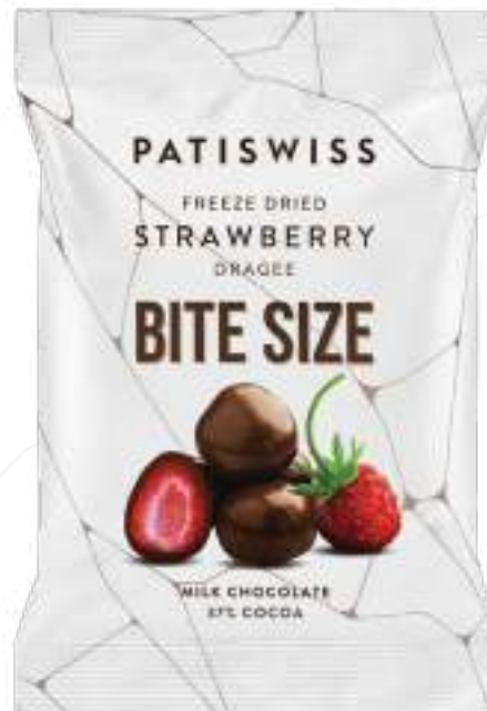
Bite Size Milk Chocolate Strawberry Dragee 30g