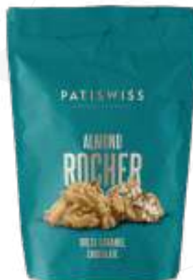
Dolce Caramel Chocolate Almond Rocher 80g