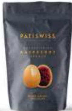
Dolce Caramel Chocolate Raspberry Dragee 80g