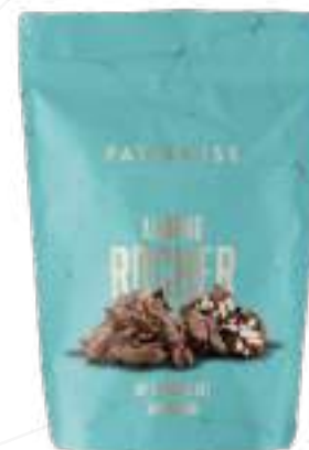
Milk Chocolate Almond Rocher 80g