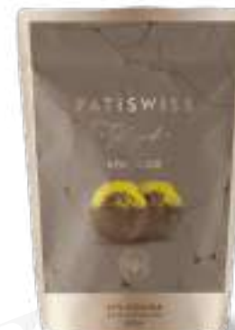
Milk Chocolate Kiwi Slice 80g