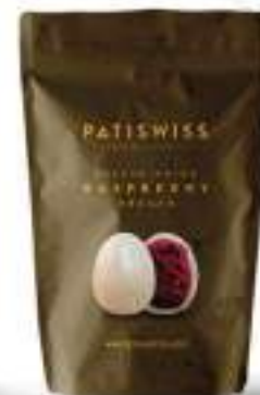
White Chocolate Raspberry Dragee 80g