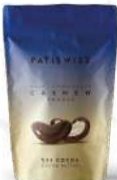
Milk Chocolate Cashew Dragee 80g