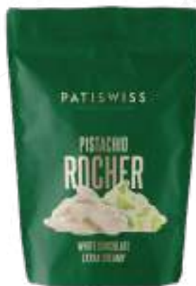
White Chocolate Pistachio Rocher 80g