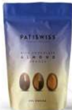
Milk Chocolate Almond Dragee 80g