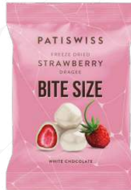
Bite Size White Chocolate Strawberry Dragee 30g