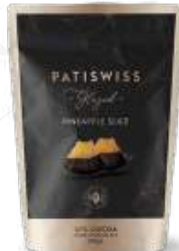
Dark Chocolate Pineapple Slice 80g