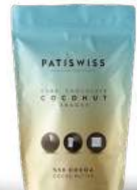
Dark Chocolate Coconut Dragee 80g