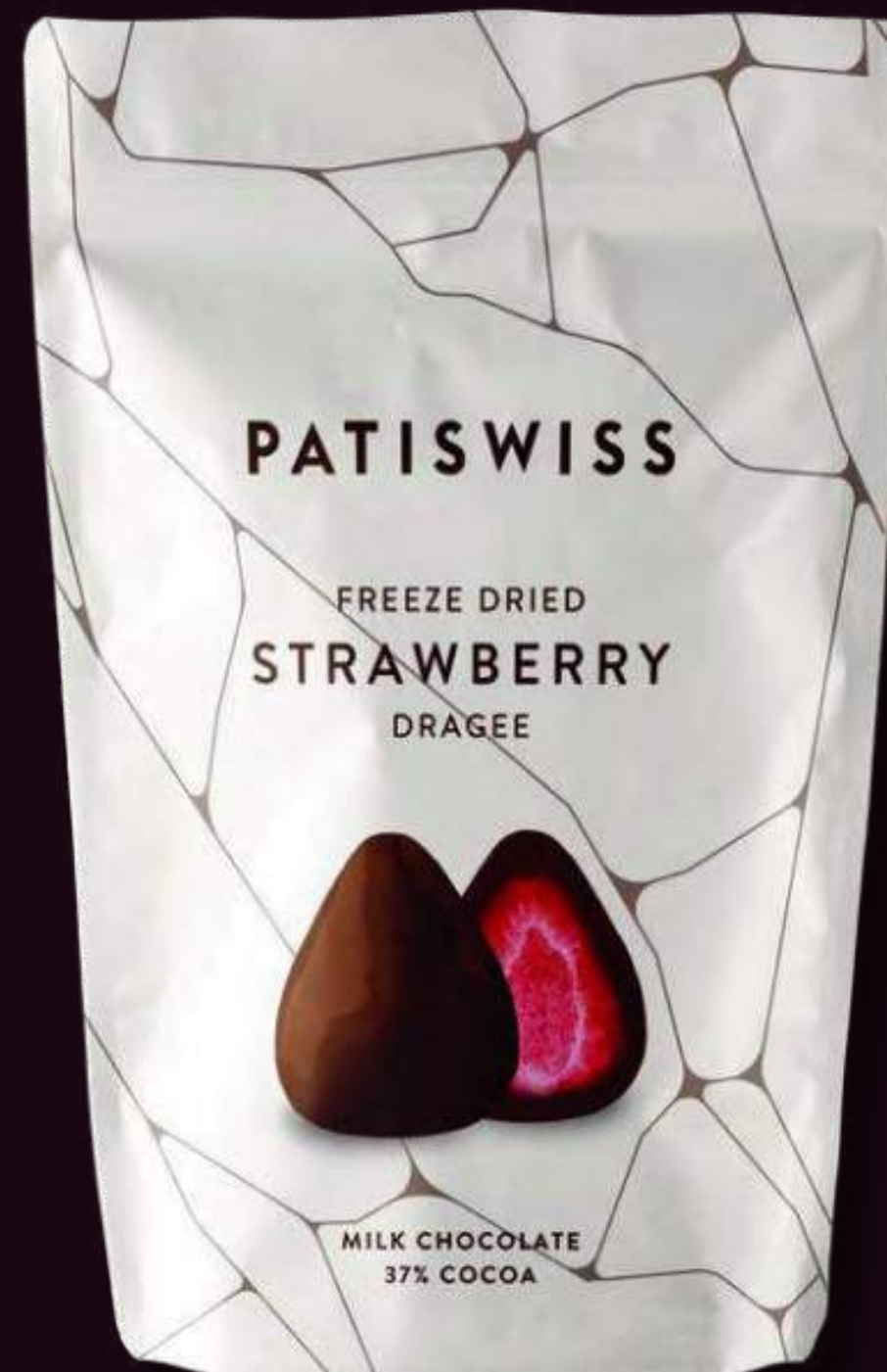
%37 Cocoa Milk Chocolate Coated Freeze Dried Strawberry Dragee 80g