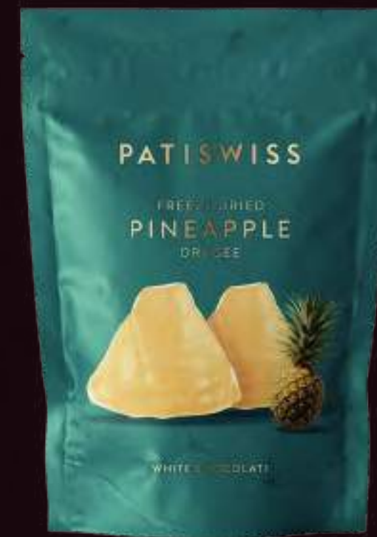
White Chocolate Coated Freeze Dried Pineapple Dragee 80g