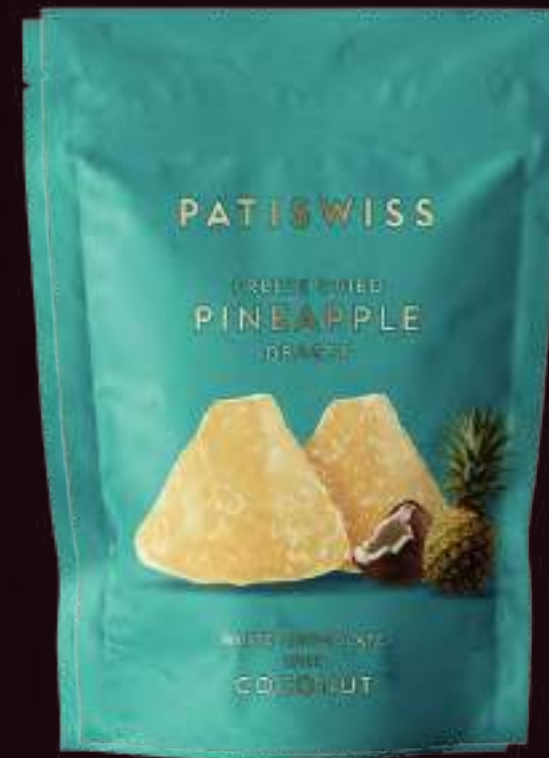
White Chocolate & Coconut Coated Freeze Dried Pineapple Dragee 80g