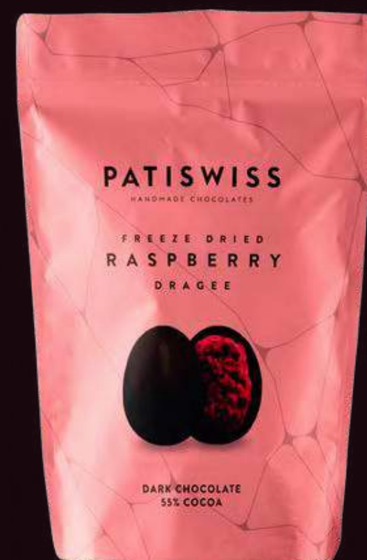
%55 Cocoa Dark Chocolate Coated Freeze Dried Raspberry Dragee 80g