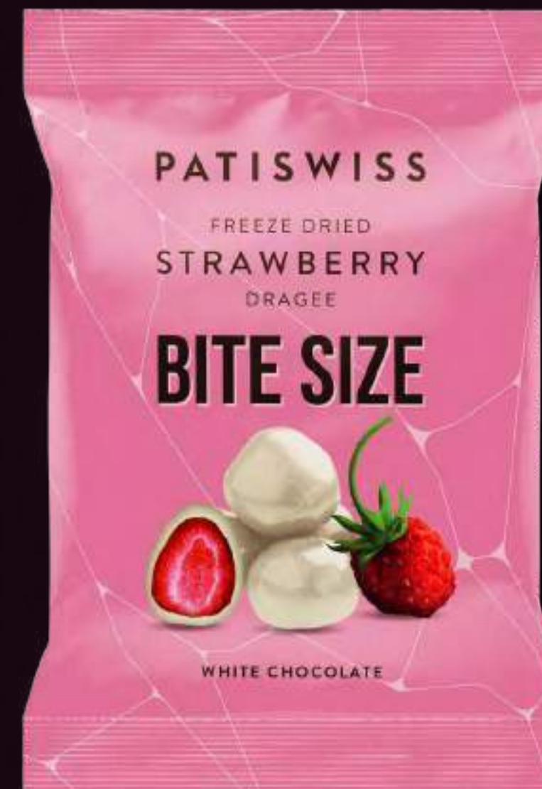
%37 Cocoa White Chocolate Coated Bite Size Strawberry Dragee 30g