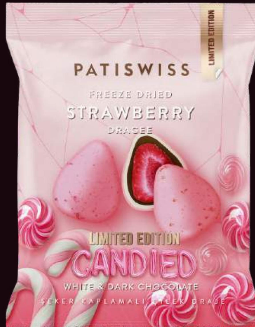
Limited Edition White & Dark Chocolate Coated Candied Freeze Dried Strawberry Dragee 50g