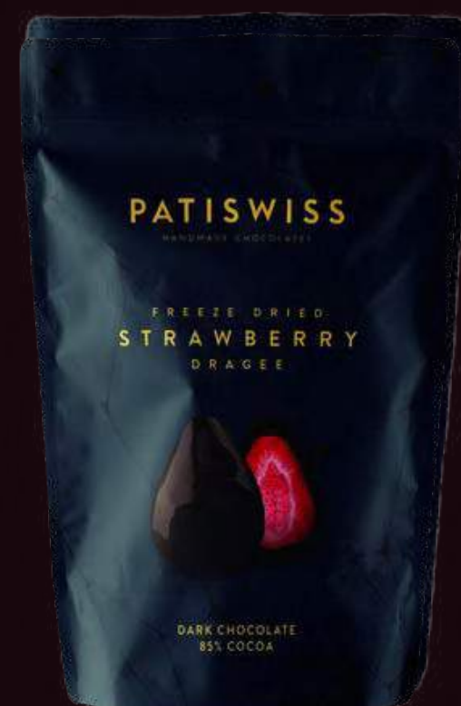
%85 Cocoa Dark Chocolate Coated Freeze Dried Strawberry Dragee 80g