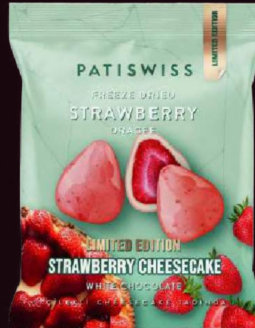
Limited Edition White Chocolate Coated Strawberry Cheesecake Freeze Dried Strawberry Dragee 50g