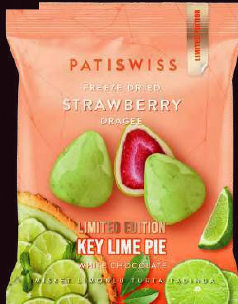
Limited Edition White Chocolate Coated Key Lime Pie Freeze Dried Strawberry Dragee 50g