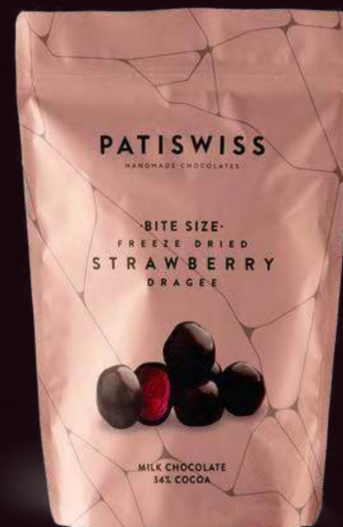
%34 Cocoa Milk Chocolate Coated Bite Size Freeze Dried Strawberry Dragee 80g