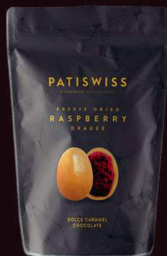
Dolce Caramel Chocolate Coated Freeze Dried Raspberry Dragee 80g