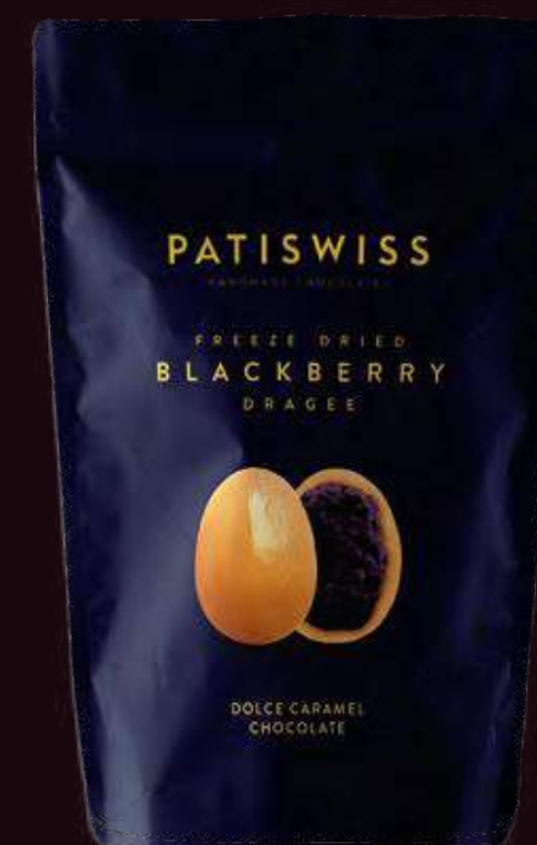
Dolce Caramel Chocolate Coated Freeze Dried Blackberry Dragee 80g