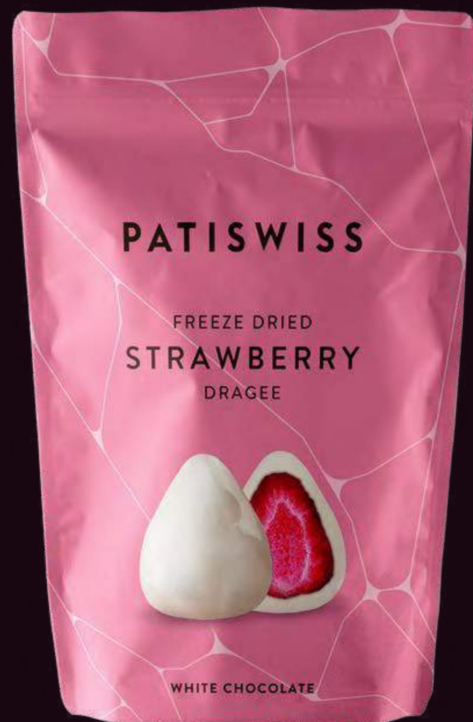
White Chocolate Coated Freeze Dried Strawberry Dragee 80g