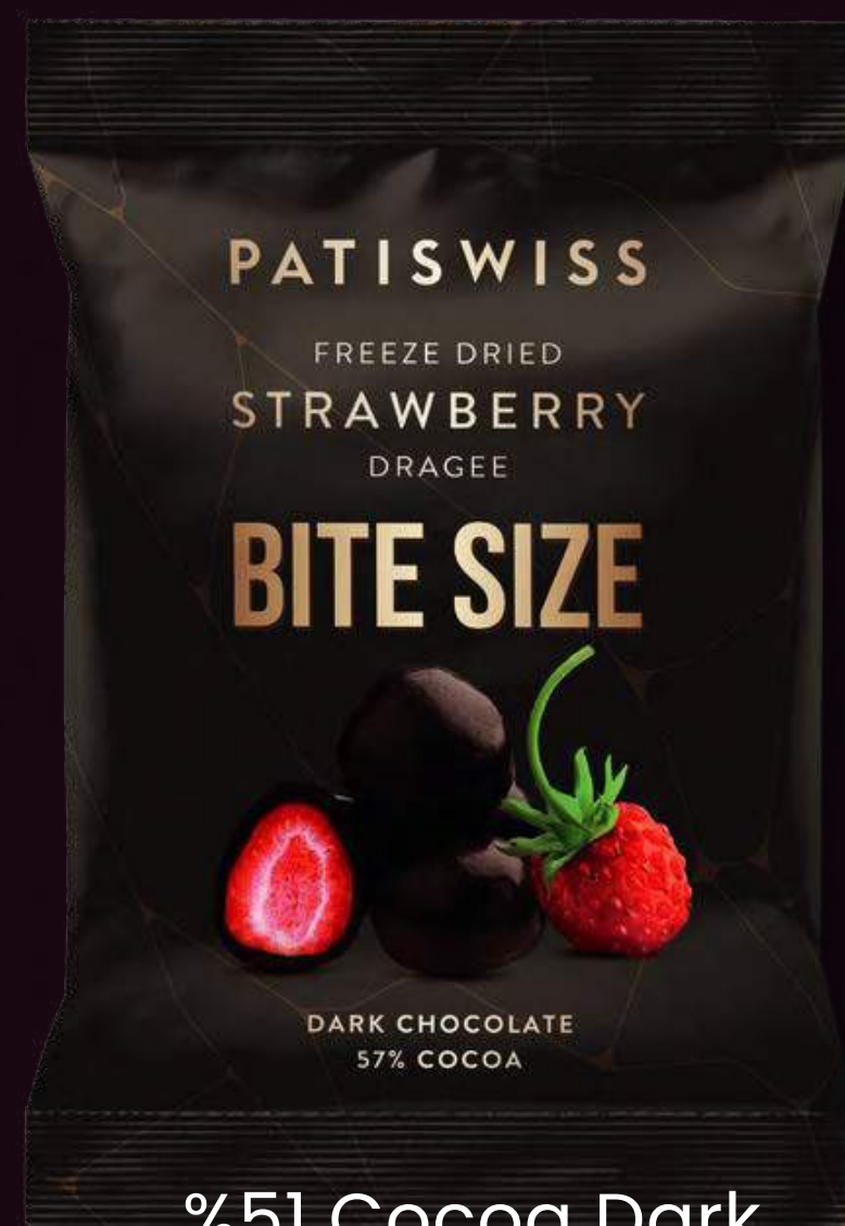
%51 Cocoa Dark Chocolate Coated Bite Size Strawberry Dragee 30g