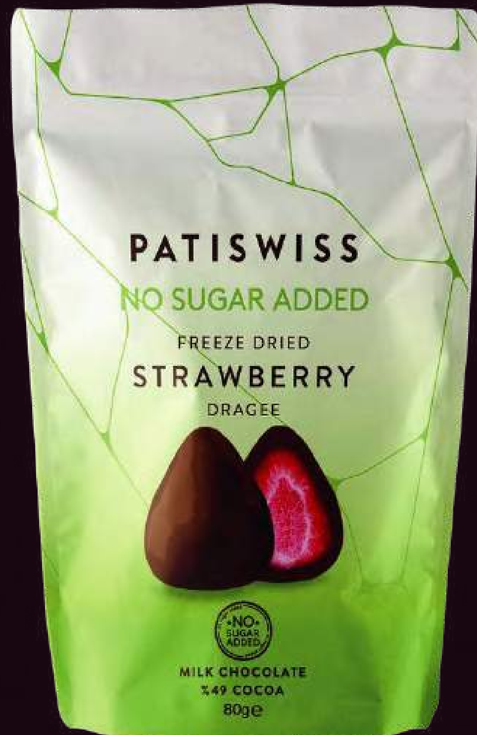
No Sugar added %49 Cocoa Milk Chocolate Coated Strawberry Dragee 80g