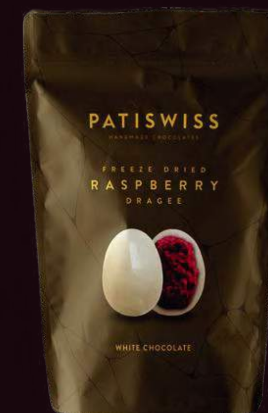
White Chocolate Coated Freeze Dried Raspberry Dragee 80g