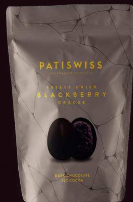
%55 Cocoa Dark Chocolate Coated Freeze Dried Blackberry Dragee 80 g