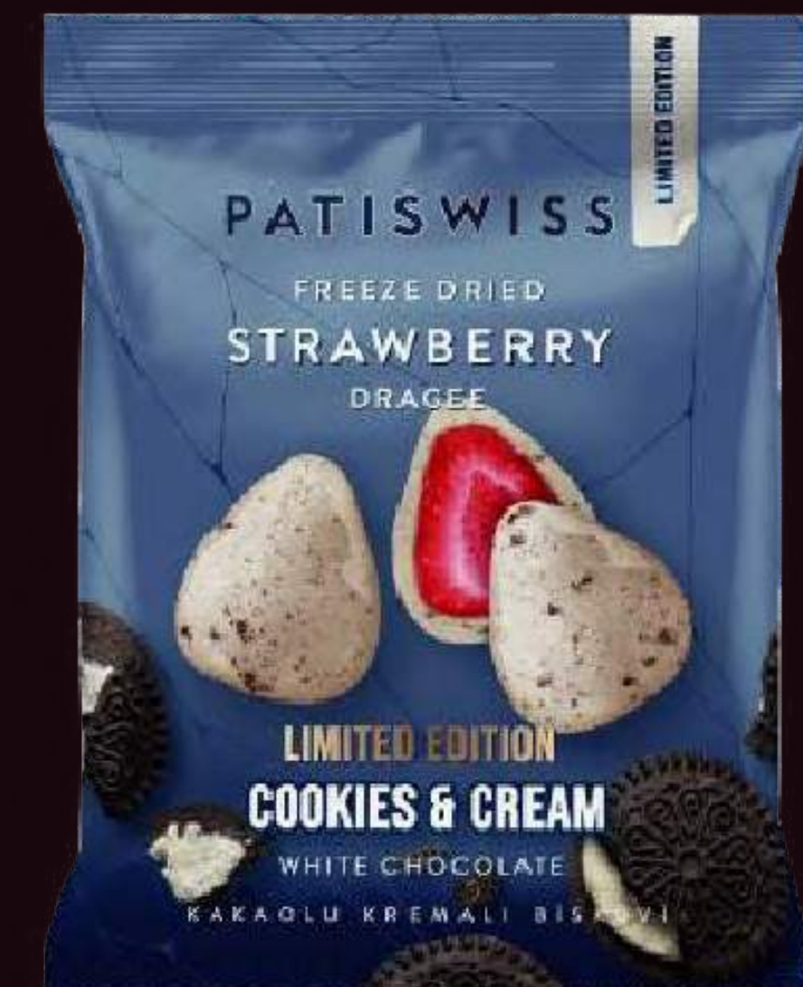
Limited Edition White Chocolate Coated Cookies&Cream Freeze Dried Strawberry Dragee 50g