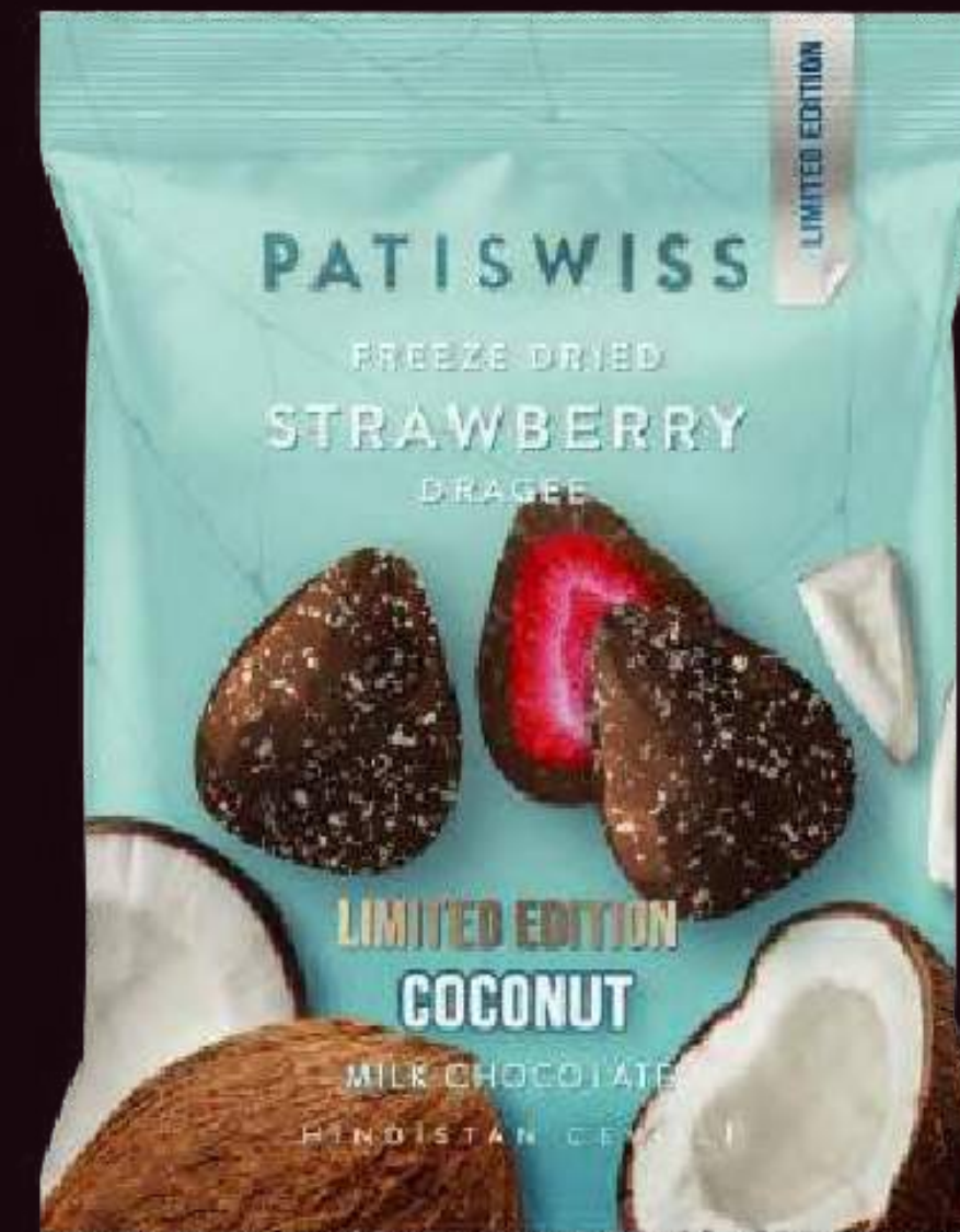
Limited Edition Milk Chocolate Coated Coconut Freeze Dried Strawberry Dragee 50g