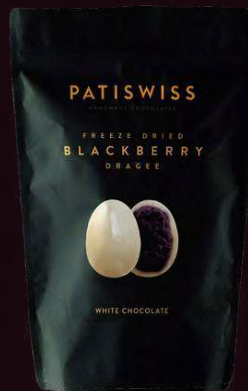
White Chocolate Coated Freeze Dried Blackberry Dragee 80g