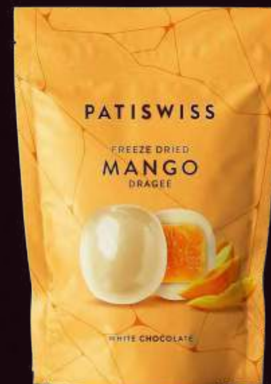
White Chocolate Coated Freeze Dried Mango Dragee 80g