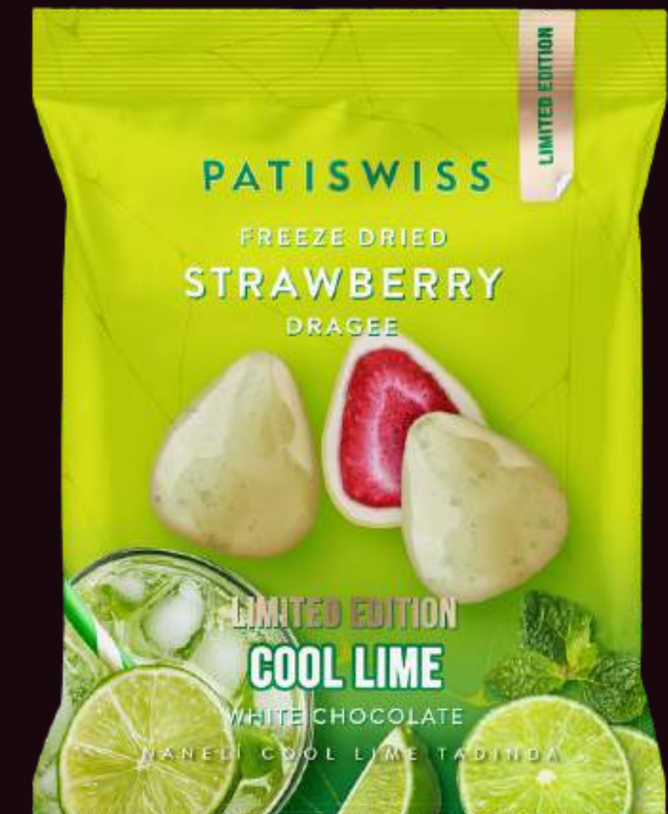
Limited Edition Milk Chocolate Coated Cool Lime Freeze Dried Strawberry Dragee 50g