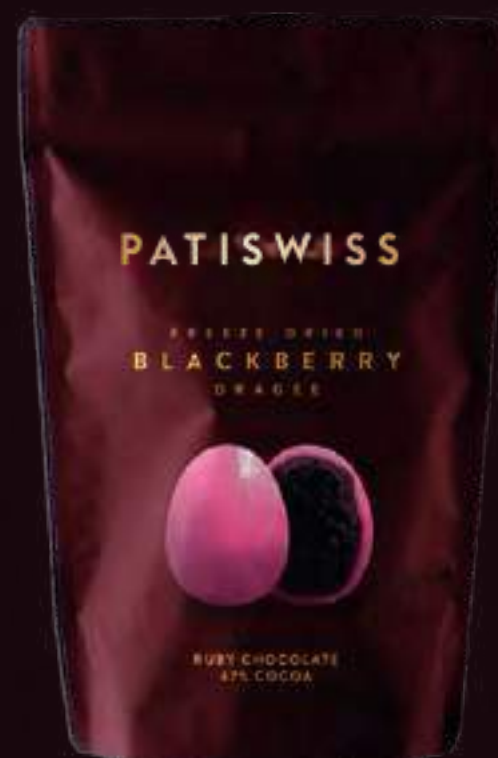
%85 Cocoa Ruby Chocolate Coated Freeze Dried Blackberry Dragee 80g