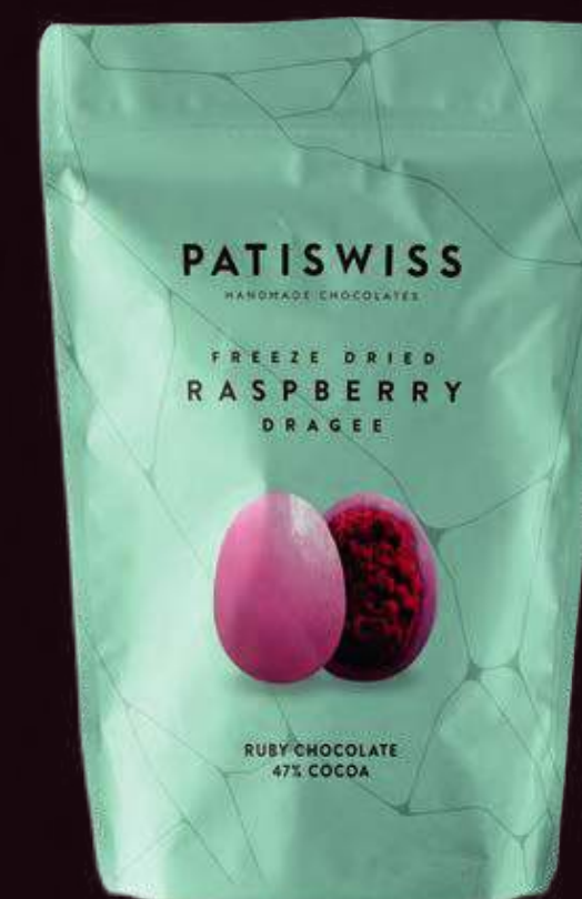
%47 Cocoa Ruby Chocolate Coated Freeze Dried Strawberry Dragee 80g