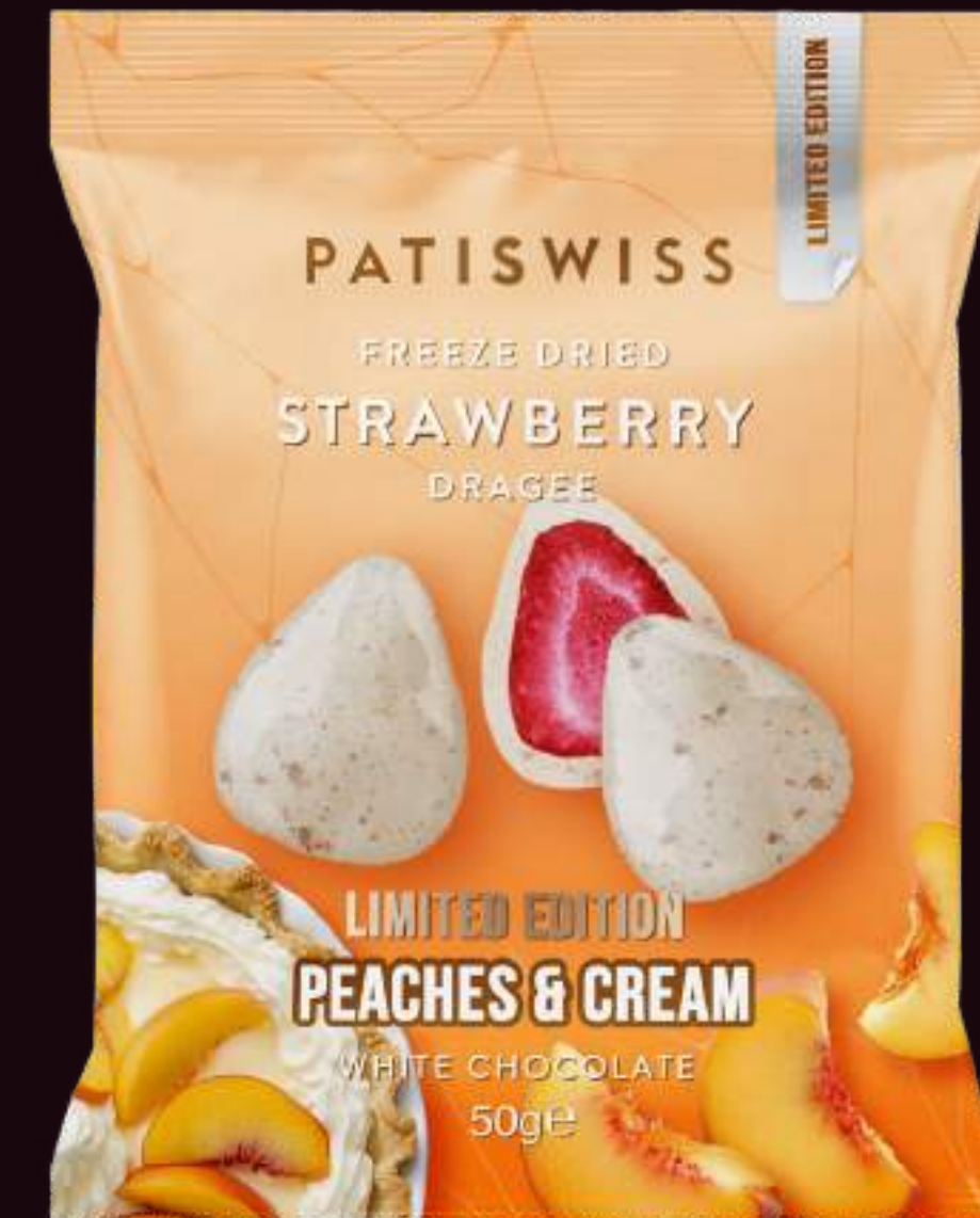
Limited Edition White Chocolate Coated Peaches & Cream Freeze Dried Strawberry Dragee 50g