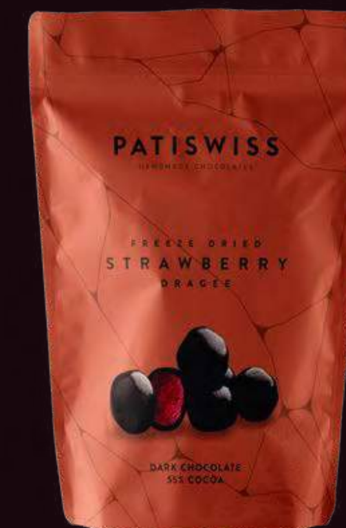
%55 Cocoa Dark Chocolate Coated Freeze Dried Strawberry Dragee 80g