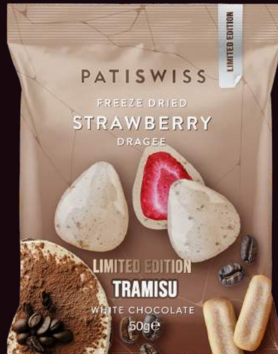
Limited Edition White Chocolate Coated Tramsu Freeze Dried Strawberry Dragee 50g