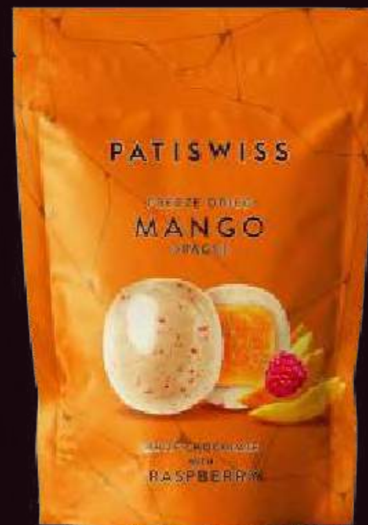
White Chocolate & Raspberry Coated Freeze Dried Mango Dragee 80g