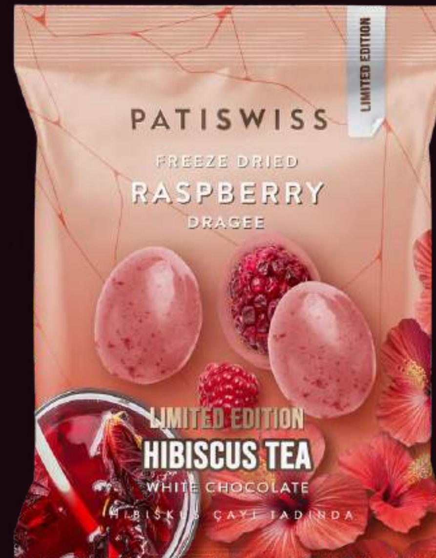
Limited Edition White Chocolate Coated Hibiscus Tea Freeze Dried Raspberry Dragee 50g