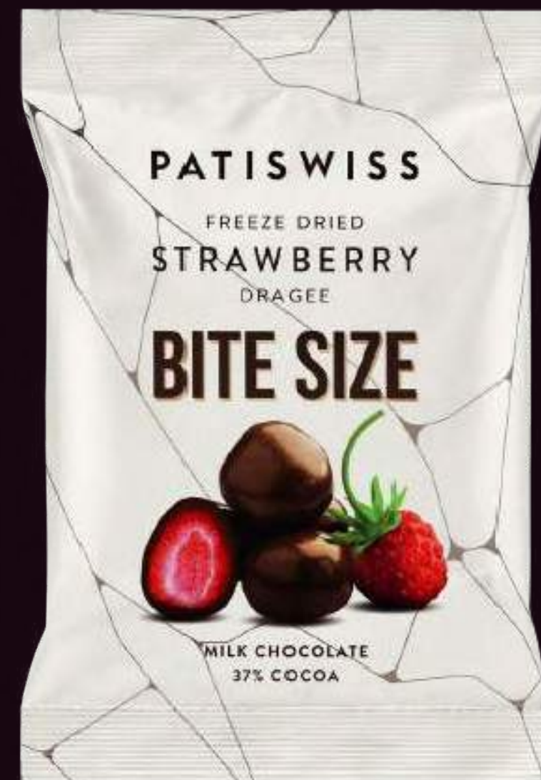
%37 Cocoa Milk Chocolate Coated Bite Size Strawberry Dragee 30g