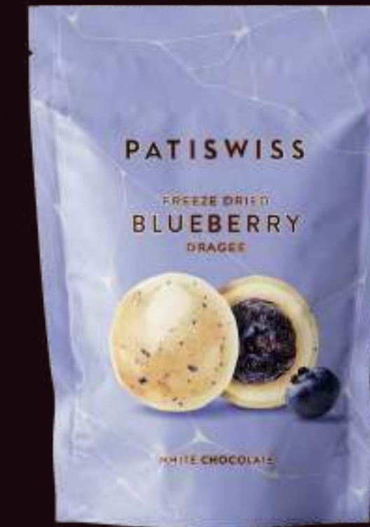
White Chocolate Coated Freeze Dried Blueberry Dragee 80g