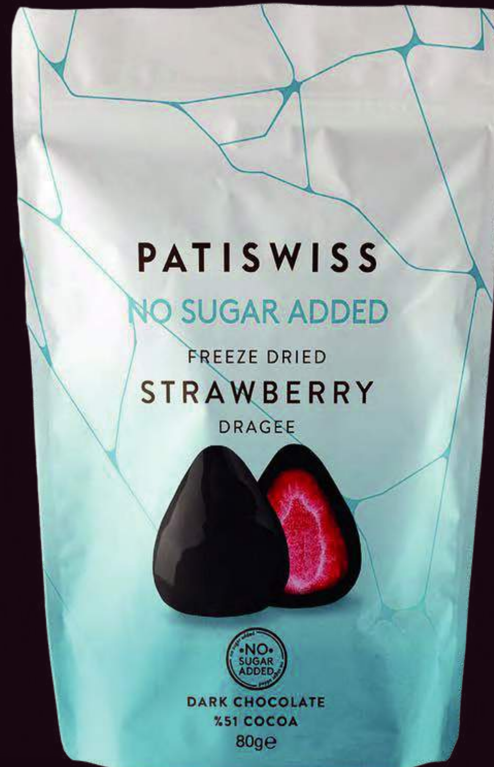
No Sugar added %51 Cocoa Dark Chocolate Coated Strawberry Dragee 80g