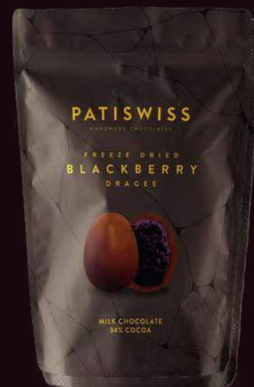
%34 Cocoa Milk Chocolate Coated Freeze Dried Blackberry Dragee 80g