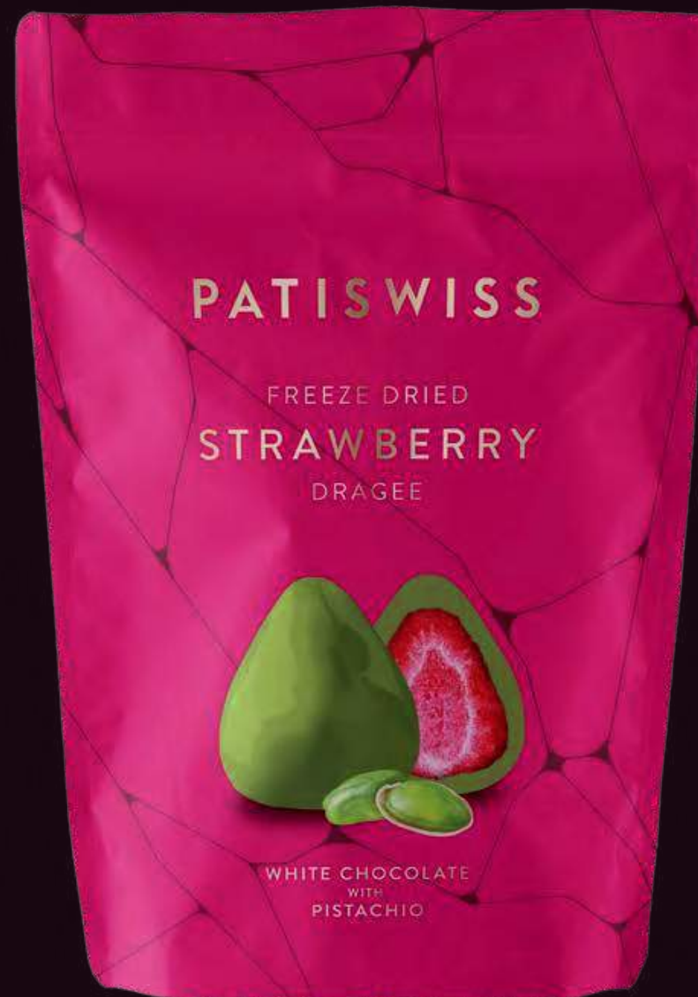
White Chocolate & Pistachio Coated Strawberry Dragee 80g