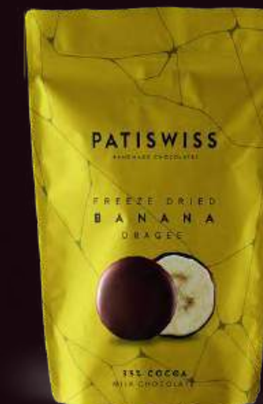
%35 Cocoa Milk Chocolate Coated Freeze Dried Banana Dragee 80g