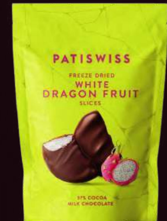
37% Cocoa Milk Chocolate Coated Freeze Dried White Dragon Fruit Slices 80g