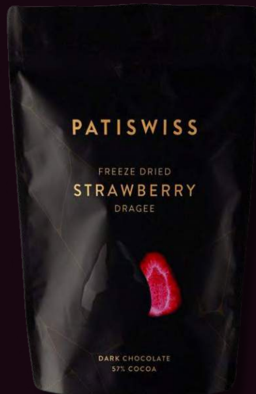
%57 Cocoa Dark Chocolate Coated Freeze Dried Strawberry Dragee 80g