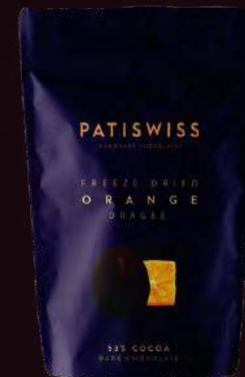
%53 Cocoa Dark Chocolate Coated Freeze Dried Orange Dragee 80g