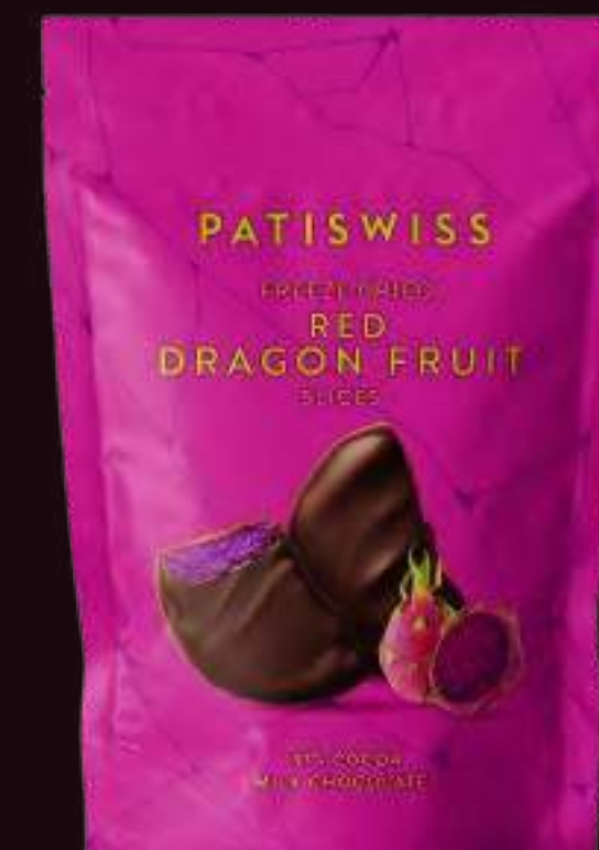
37% Cocoa Milk Chocolate Coated Freeze Dried Red Dragon Fruit Slices 80g