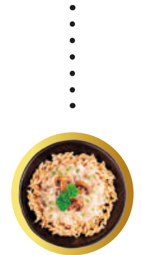
READY MEALS PASTAS DAIRY AND MEAT PRODUCTS