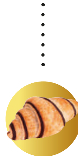
PASTRY BAKERY FROZEN PRODUCTS

We operate with transparency and honesty, ensuring our customers are informed about our products and their benefits.