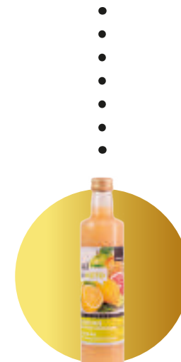
SOFT DRINKS BEVERAGES