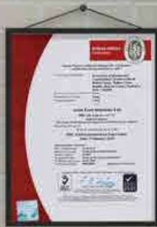
BRC ISSUE 8