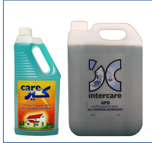
All Purpose Detergent