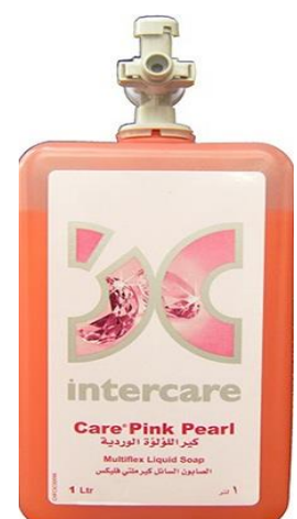
Multiflex Pink Pearl Hand Soap