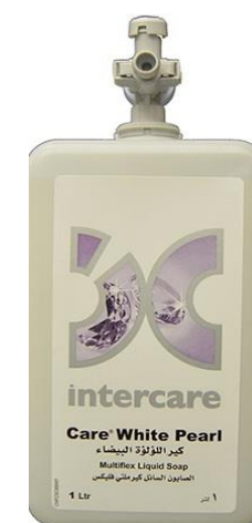
Multiflex White Pearl Hand Soap