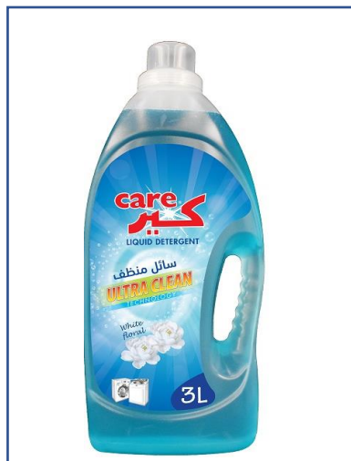
Liquid Laundry Detergent