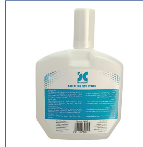
Sani Clean Drip System (Toilet Sanitizer)