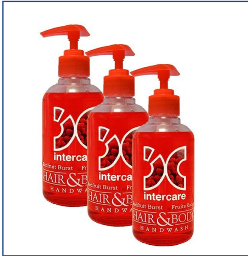
Red Fruit Hand Wash