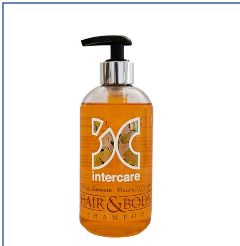
Orange Blossom Shampoo