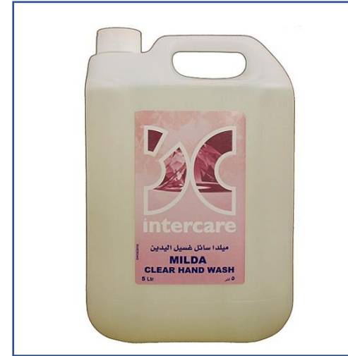
Milda Hand Wash