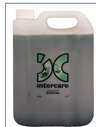
Interpine Floor Cleaner