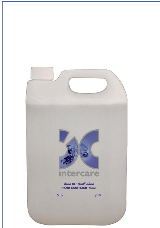
Neutral Hand Sanitizer