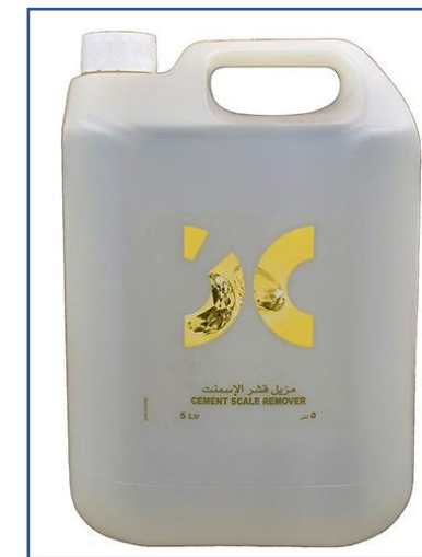
Cement Scale Remover