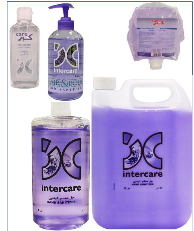
Lavender Hand Sanitizer Gel