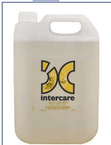
Low Foam Detergent