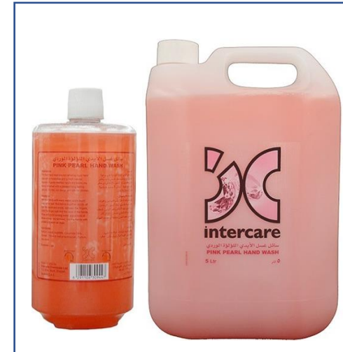
Pink Pearl Hand Wash