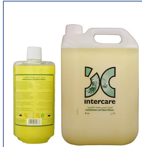
Antibacterial Hand Wash