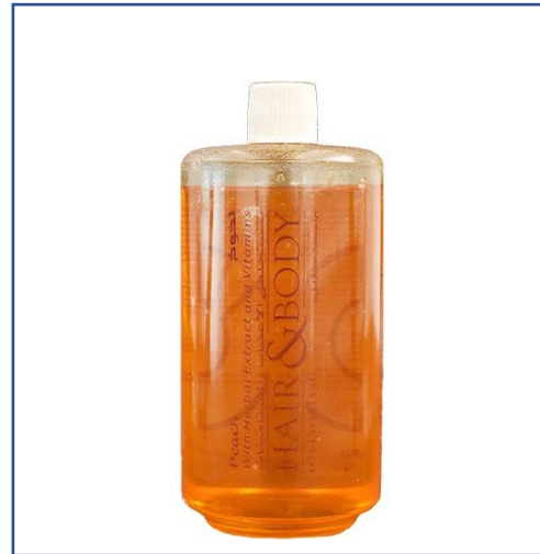
Peach Bath & Shower Gel