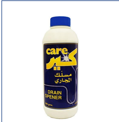
Solid Drain Opener