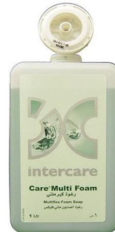
Multiflex Multi Foam Soap