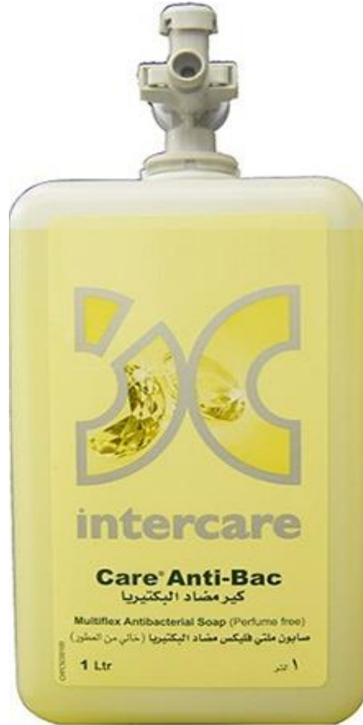
Multiflex Antibacterial Soap