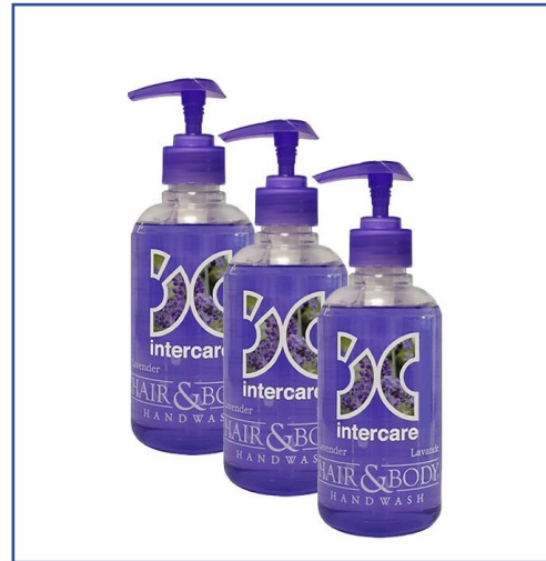
Lavender Hand Wash