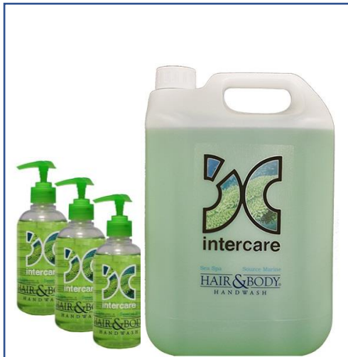
Sea Spa Hand Wash