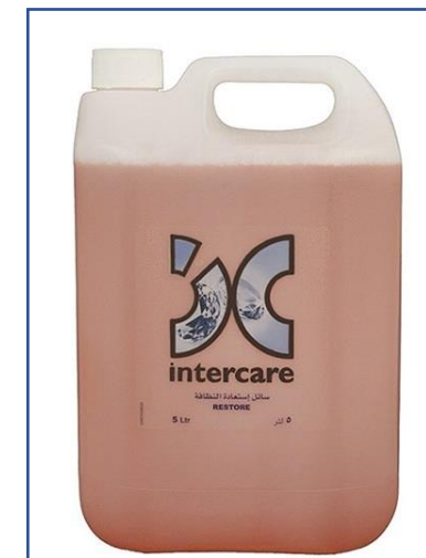
Restore Stain Remover