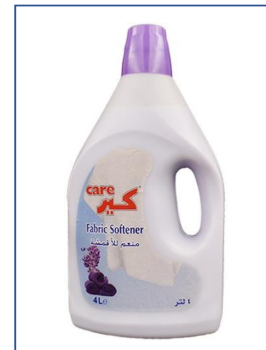
Lavender - Fabric Softener