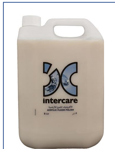
Acrylic Floor Polish