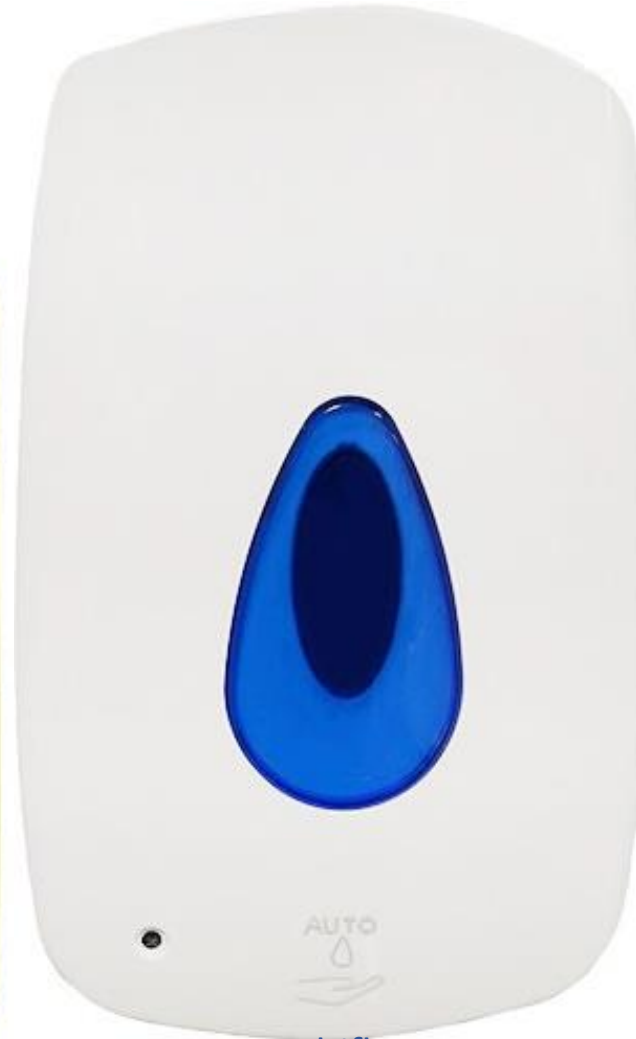
Multiflex - Touchfree Soap Dispenser