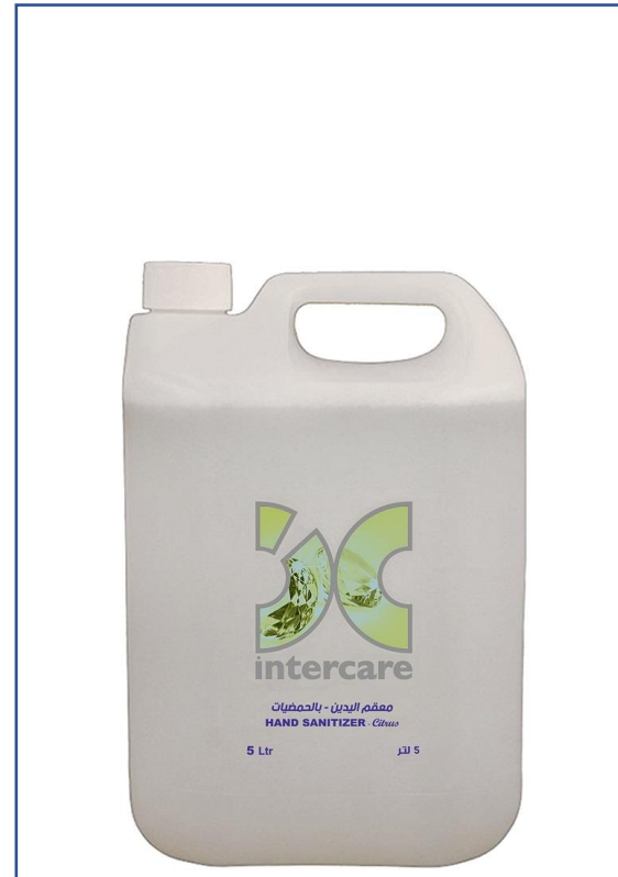
Light Citrus Hand Sanitizer