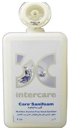
Multiflex Alcohol Free – Hand Sanitizer