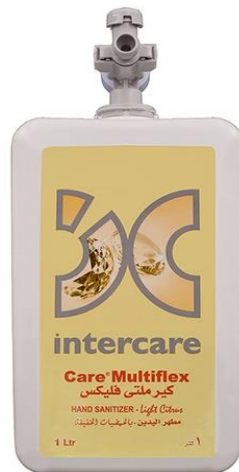
Multiflex Light Citrus – Hand Sanitizer