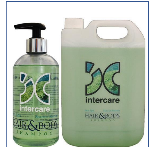
Green Apple Shampoo