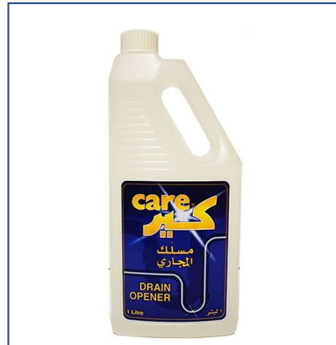
Liquid Drain Opener