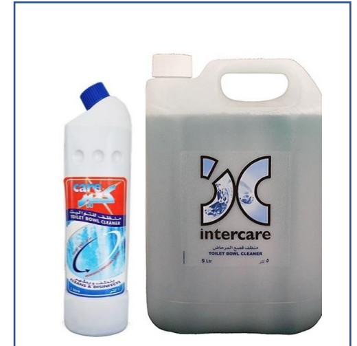
Toilet Bowl Cleaner