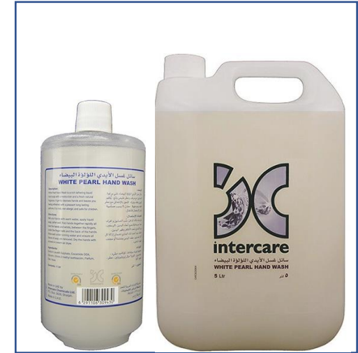
White Pearl Hand Wash