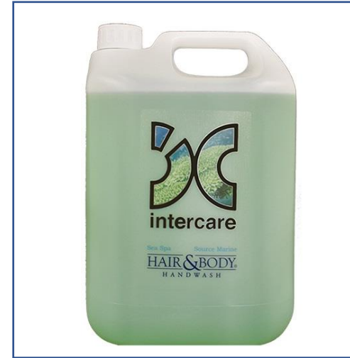
Sea Spa Bath & Shower Gel