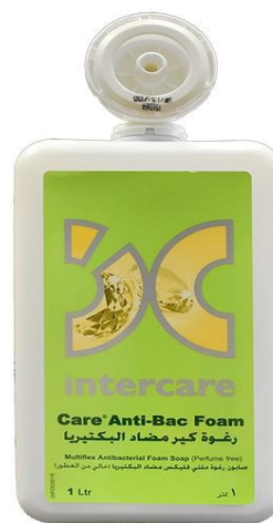
Multiflex Anti-Bac Foam Soap