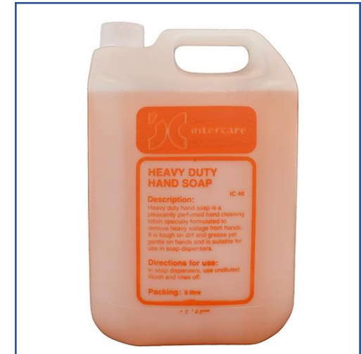
Heavy Duty – Hand Soap