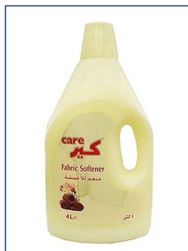
White - Fabric Softener