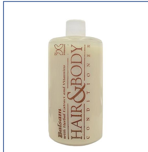
Balsam Hair Conditioner