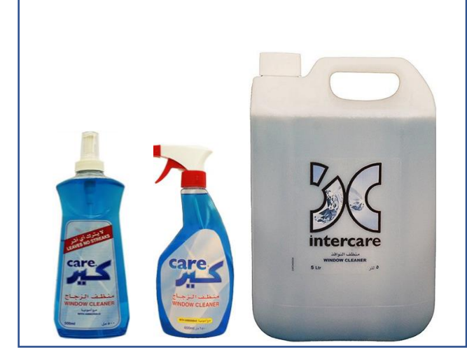
Glass Window Cleaner