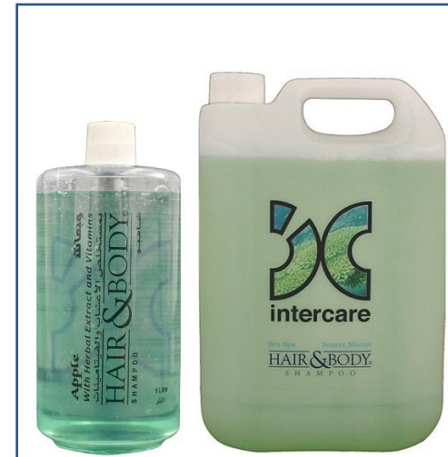
Sea Spa Shampoo