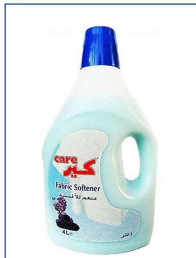
Blue - Fabric Softener