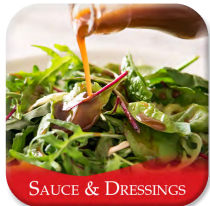
SAUCE & DRESSINGS