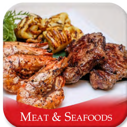
MEAT & SEAFOODS

Each unit is equipped with an application lab managed by food technologists with years of experience.