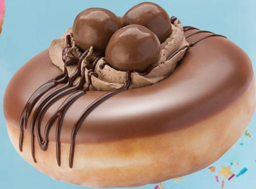
Maltesers / coated rice crisps