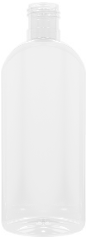
Ref Code: CPB/VXL200ML

Title : 100ml VXL Material : PET Weight : 13.5 gm Neck Diameter : 20 mm OFC : 110 ml Standard Pack : 800 pcs/carton Carton Size : 505 x 445 x 695