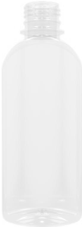
Ref Code: CPB/VXL200ML2

Title : 200ml VXL Material : PET Weight : 20.00 gm Neck Diameter : 24 mm OFC : 220 ml Standard Pack : 416 pcs/carton Carton Size : 505 x 445 x 695