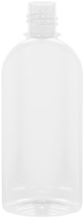
Ref Code: CPB/VXL100ML

Title : 50ml VXL Material : PET Weight : 9.5 gm Neck Diameter : 20 mm OFC : 60 ml Standard Pack : 1540 pcs/carton Carton Size : 505 x 445 x 695