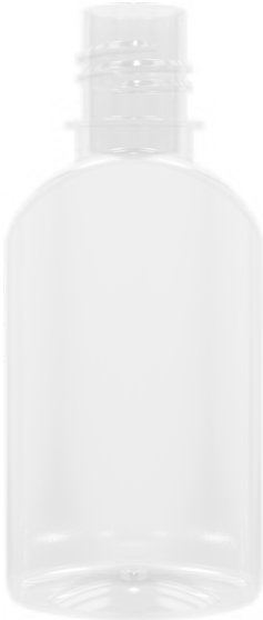
Ref Code: CPB/VXL50ML

Title : 50ml VXL Material : PET Weight : 9.5 gm Neck Diameter : 20 mm OFC : 60 ml Standard Pack : 1540 pcs/carton Carton Size : 505 x 445 x 695