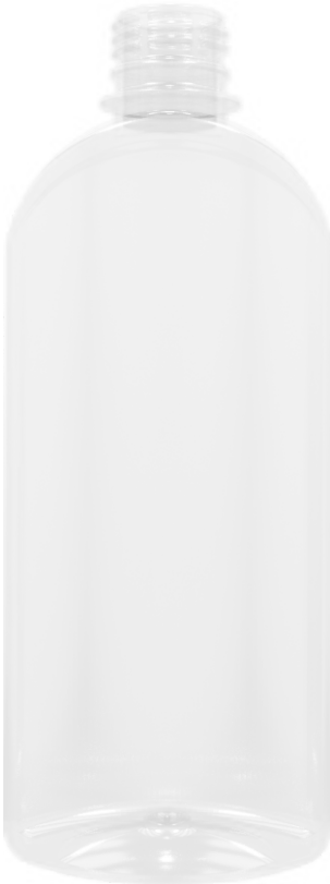
Ref Code: CPB/VXL400ML

Title : 200ml VXL Material : PET Weight : 26.5 gm Neck Diameter : 28 mm OFC : 220 ml Standard Pack : 416 pcs/carton Carton Size : 505 x 445 x 695