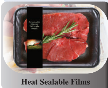
Heat Sealable Films