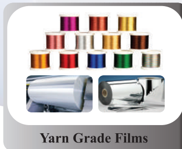
Yarn Grade Films