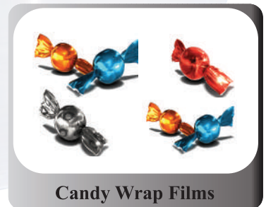
Candy Wrap Films