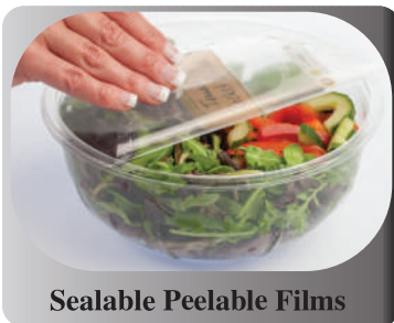
Sealable Peelable Films