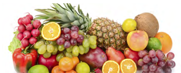
FRUIT & VEGETABLES