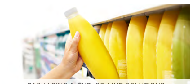
PACKAGING & END-OF-LINE SOLUTIONS