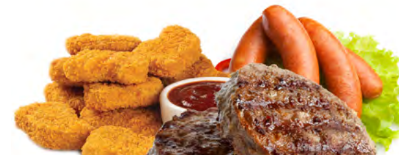
ANIMAL PROTEINS & ALTERNATIVES

Rieckermann supports the Food Processing industry across Asia and the Middle East by providing process solutions that increase efficiency, help save valuable resources, and help innovate with unique recipes as well as unique product and packaging designs. Our know-how and experience are reflected in an industry portfolio with a wide range of proprietary technologies, including the competence to integrate local content, engineering, consulting and global trade finance. Together with our expert technology partners, we supply state-of-the-art solutions that are tailored to individual requirements.