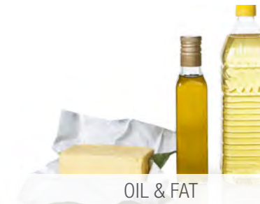
OIL & FAT