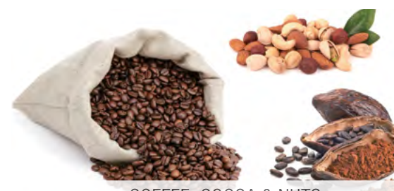
COFFEE, COCOA & NUTS