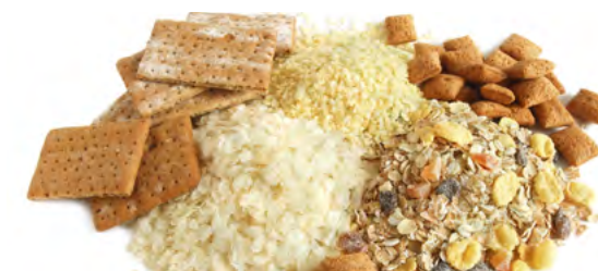
CEREALS & SUGAR