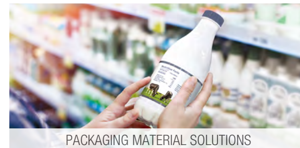
PACKAGING MATERIAL SOLUTIONS