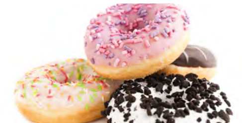
BAKERY & CONFECTIONERY