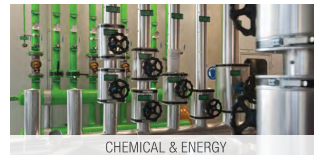
CHEMICAL & ENERGY