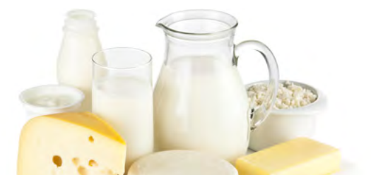
DAIRY & CHEESE