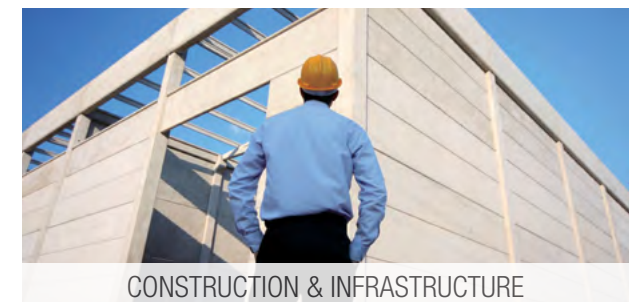
CONSTRUCTION & INFRASTRUCTURE