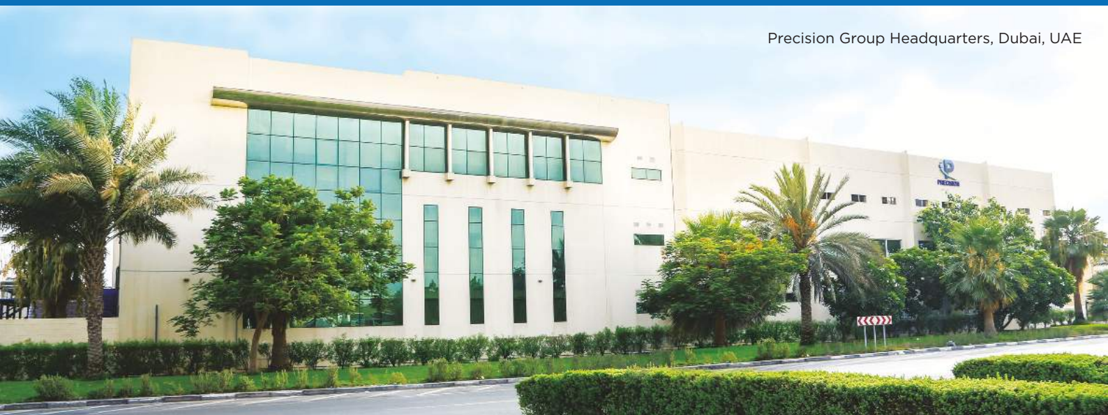
Precision Group Headquarters, Dubai, UAE

Our commitment to sustainability drives us to create eco-friendly packaging that promotes positive environmental change, reflecting our responsibility as a forward-thinking industry leader.