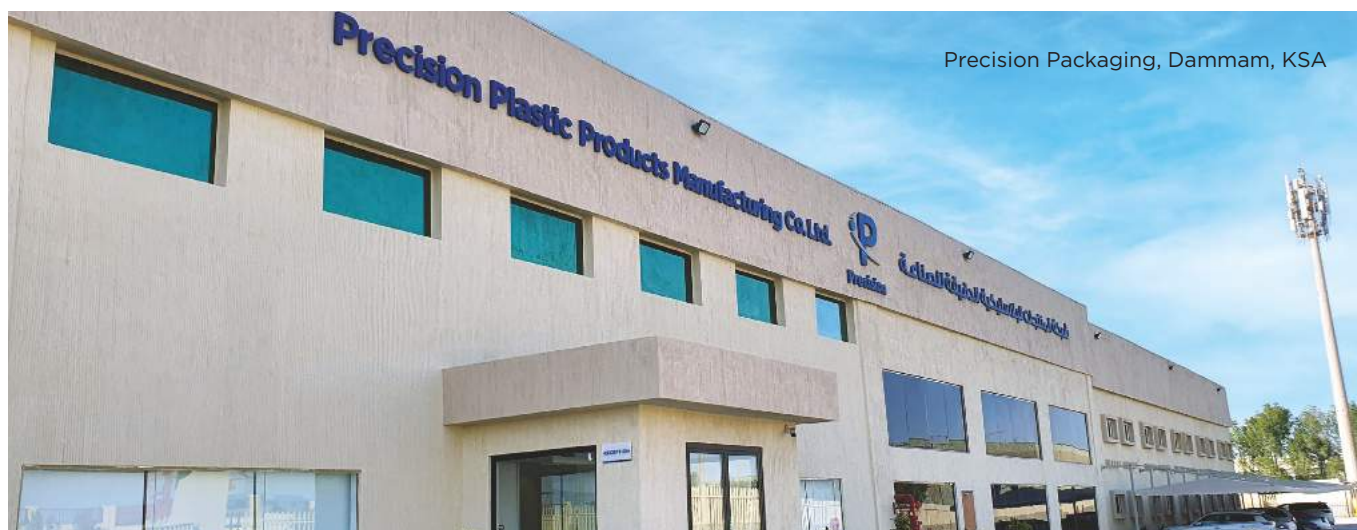
Precision Packaging, Damman, KSA

At Precision, we don't just offer packaging, we offer solutions that drive your brand forward. Every step of our process is designed to ensure your packaging is as functional as it is visually appealing, meeting the highest standards of quality and innovation.