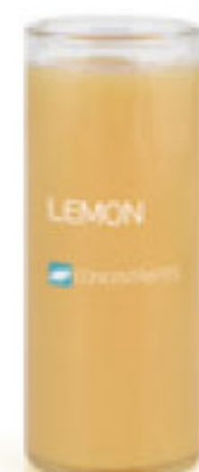
Lemon Juice Concentrate