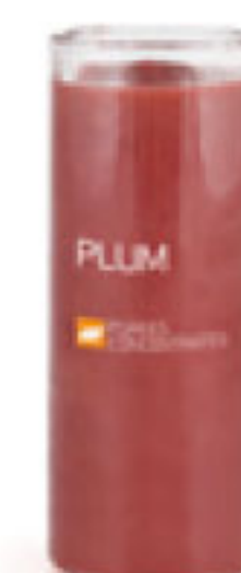
Plum Puree Concentrate