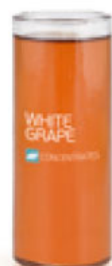
White Grapefruit Juice Concentrate