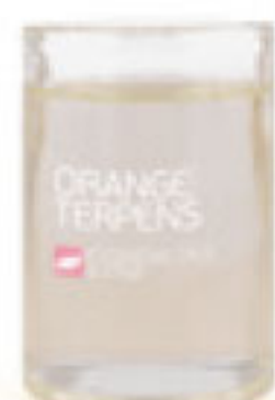
Orange Terpenes (D-Limonene)