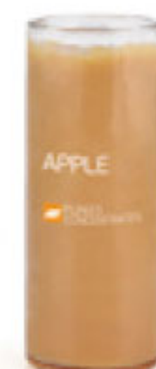
Apple Puree Concentrate