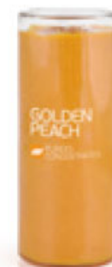
Yellow Clingstone (Golden) Peach Puree Concentrate