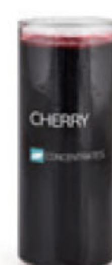
Black Cherry Juice Concentrate