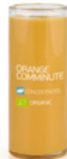
Orange Comminute Conventional / Organic