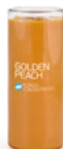
Yellow Clingstone (Golden) Peach Juice Concentrate