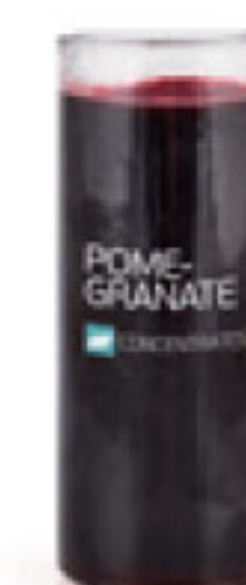
Pomegranate Juice Concentrate