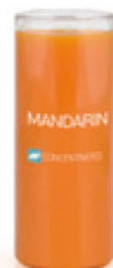
Mandarin Juice Concentrate