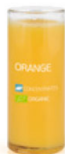
Orange NFC Conventional / Organic