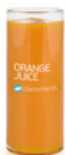
Orange Juice Concentrate