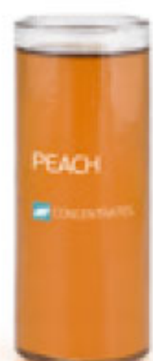
Peach Juice Concentrate