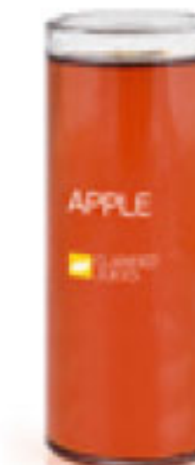
Apple Juice Concentrate