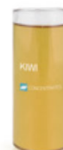
Kiwi Juice Concentrate