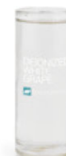
Deionized White Grape Juice Concentrate