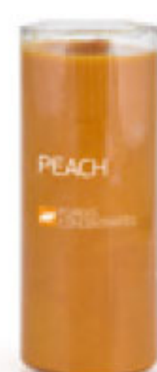
Peach Puree Concentrate