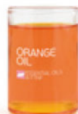
Cold Pressed Orange Oil