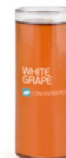
White Grape Juice Concentrate