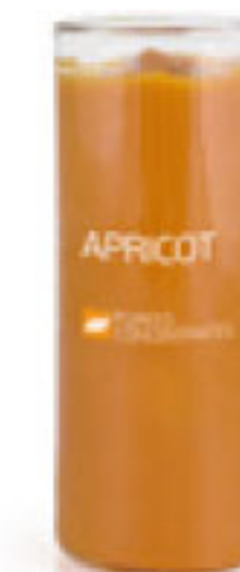
Apricot Puree Concentrate