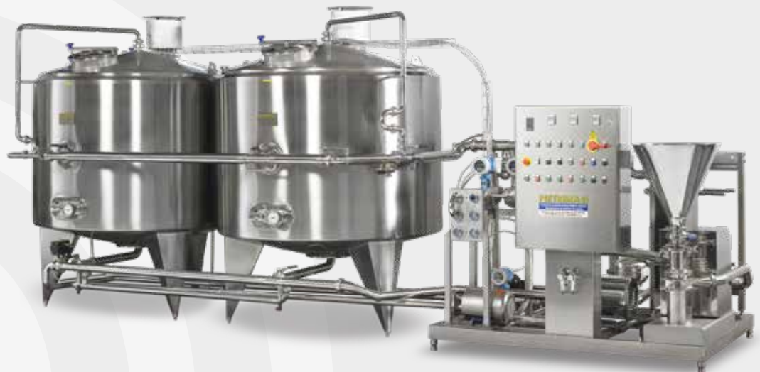
Compact drink preparation and blending units