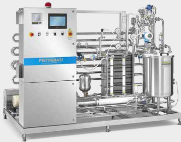
Thermo flash pasteurizer

Plants designed to meet every production need