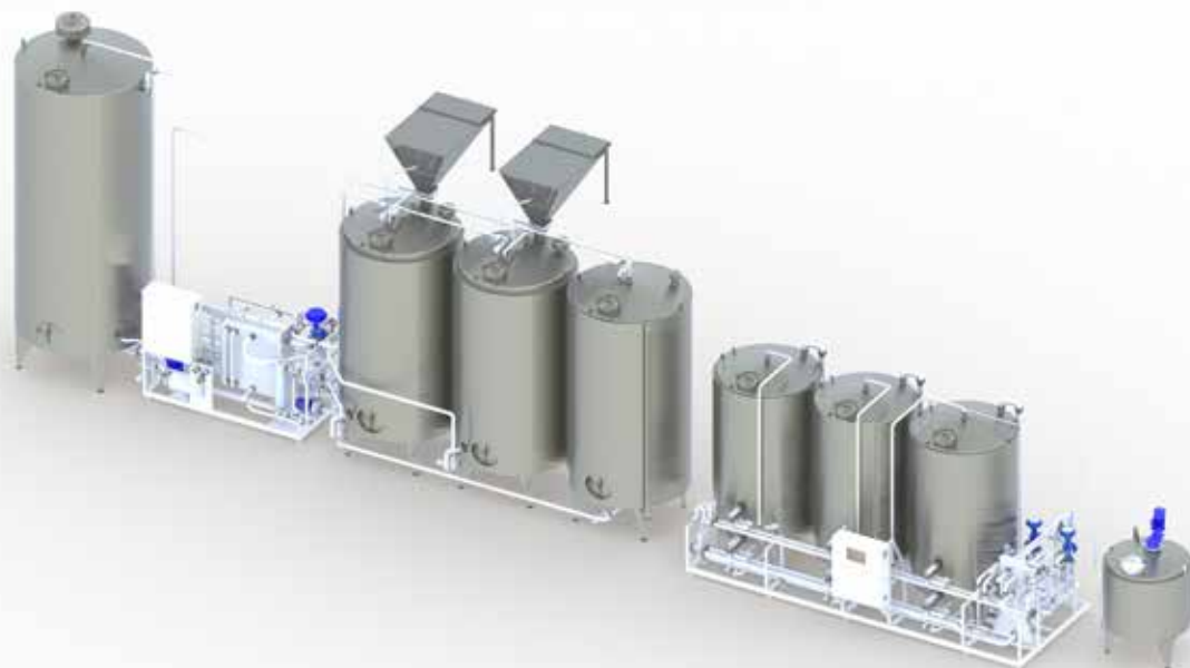
3D syrup room showcasing sugar dissolution and CIP

Customized solutions in a wide range of capacities