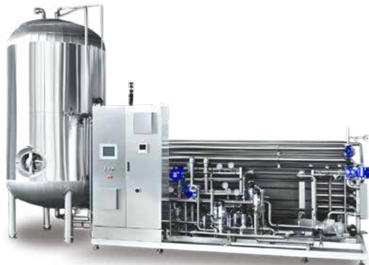
Fully automatic thermo beer pasteurizer