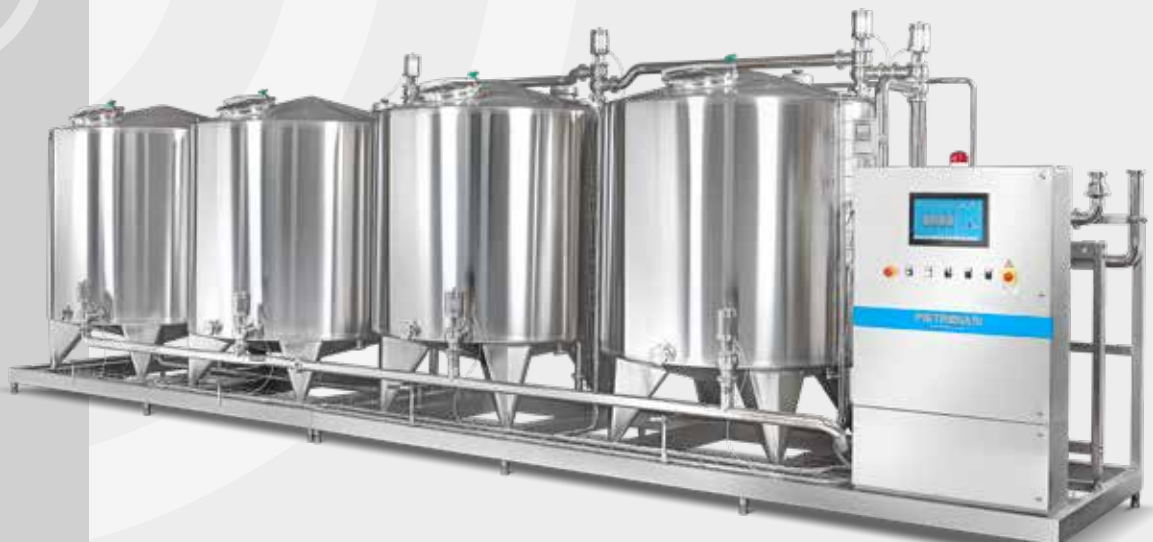
Automatic CIP units