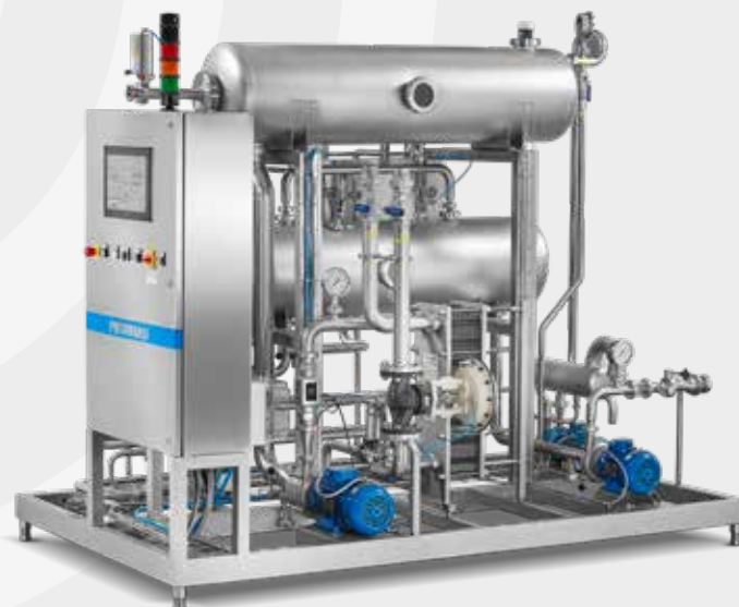
Carbonation system (Deoxy Carbo)