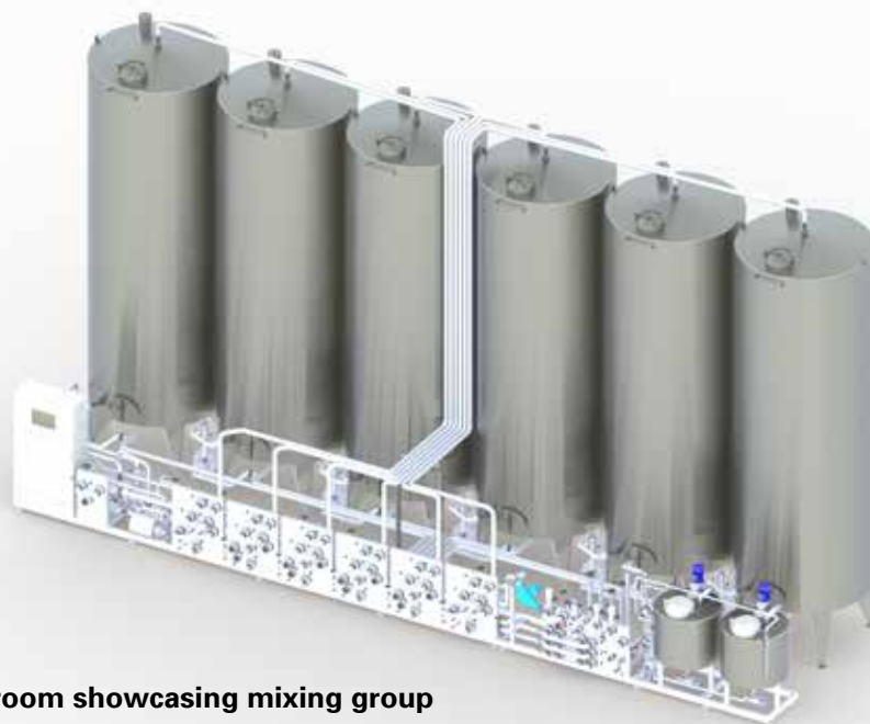
3D syrup room showcasing mixing group

Customized solutions in a wide range of capacities