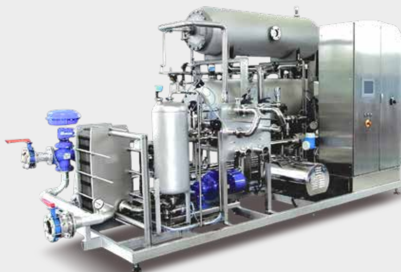
Fully Automatic mixer

Reliability and versatility for continuous production