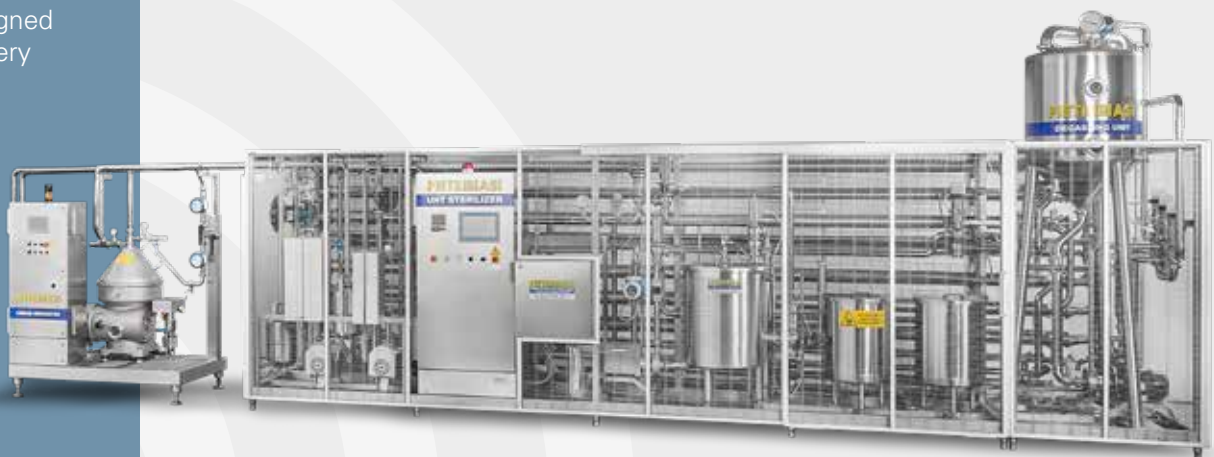
UHT Tubular pasteurizer

Plants designed to meet every production need