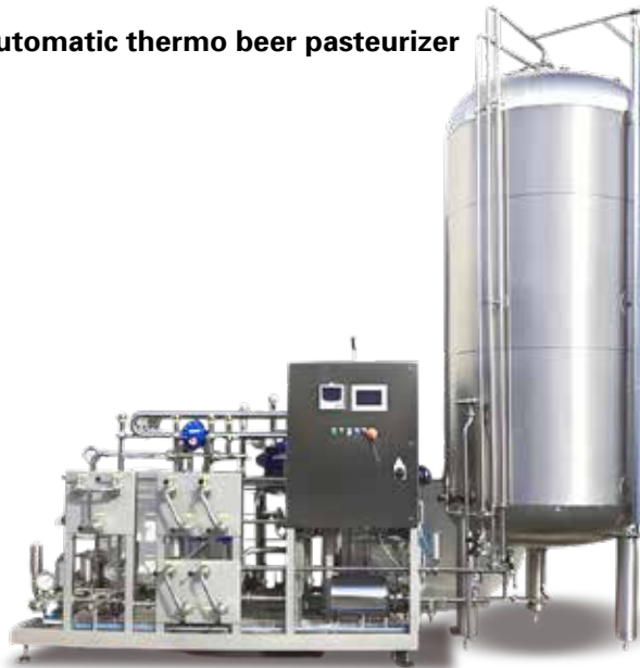
Semi Automatic thermo beer pasteurizer