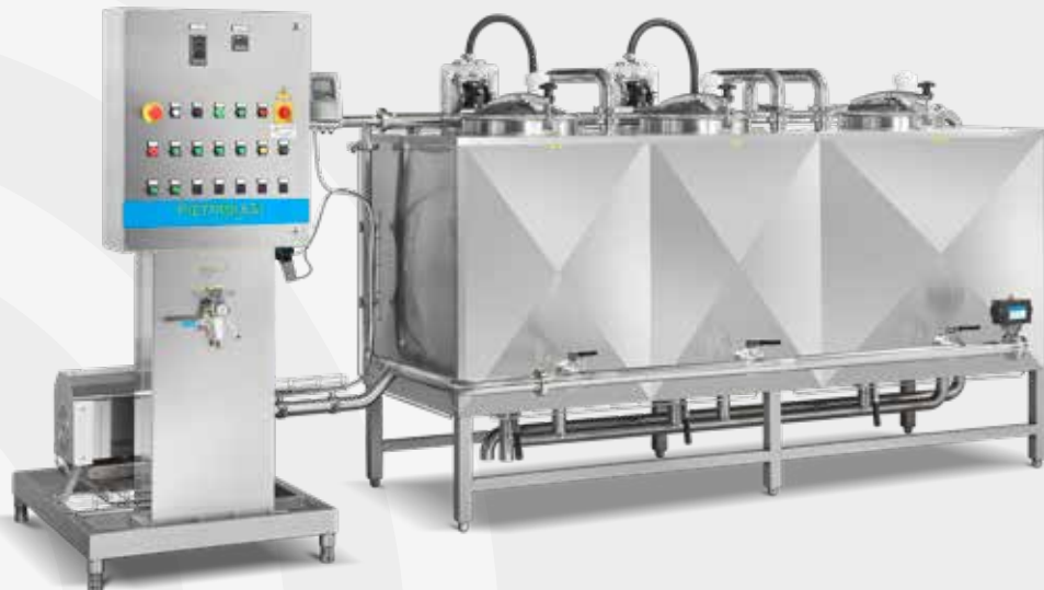
Semi Automatic CIP unit

Efficiency and quality at every stage of production