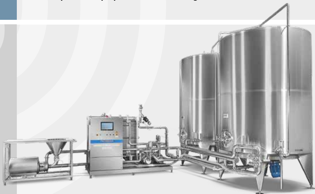
Fully automatic blending stations for drinks / fruit juices preparation and mixing