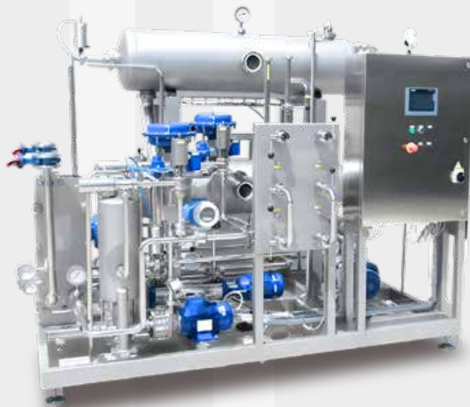
Automatic mixer (Mixy Carbo)

Reliability and versatility for continuous production