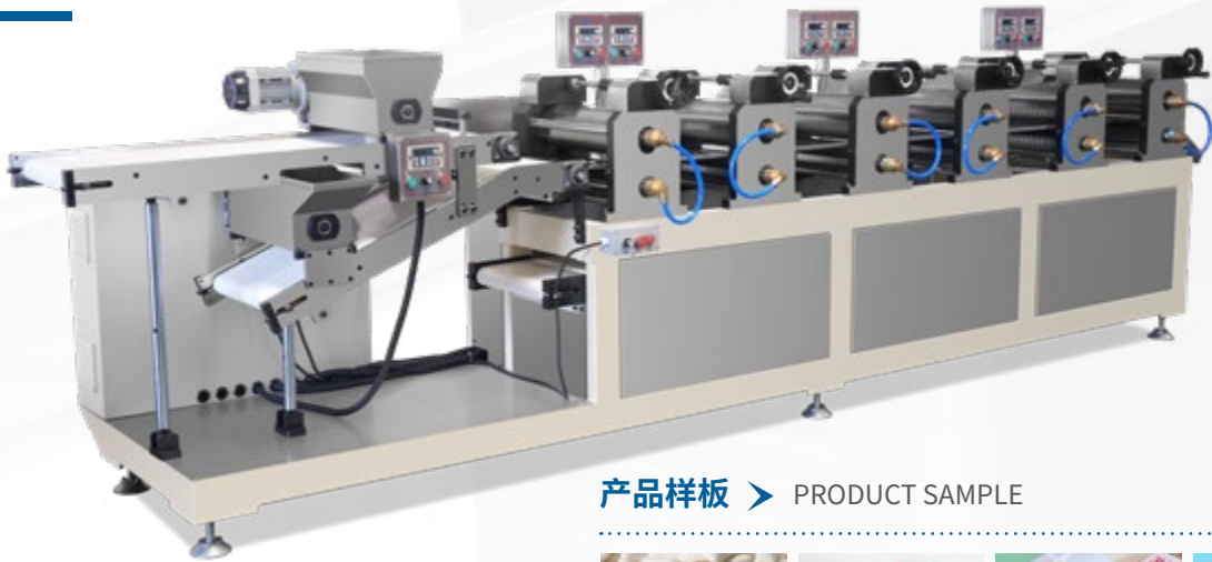
产品样板 > PRODUCT SAMPLE