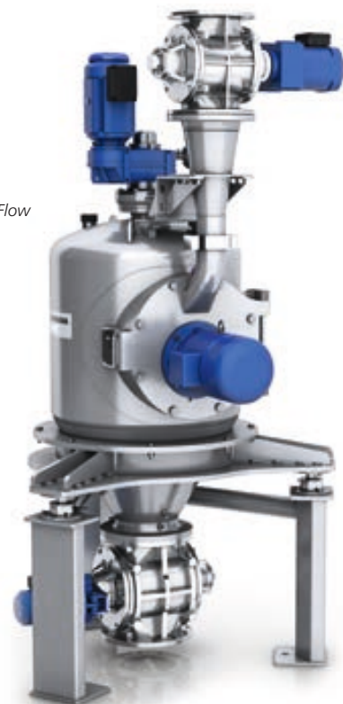
➤ Sugarplex Flow

The product exits the mill completely recrystallised and with a high storage stability – without the tendency to form deposits.