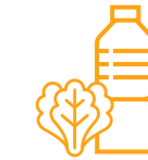
Vegetable Cooking Oil