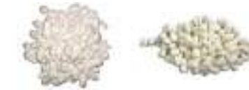
Multipurpose Soap Noodles

Soap noodles are small, uniform pellets made from a blend of Vegetable Oil. These noodles serve as the essential raw material to produce various types of soap.