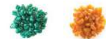
Translucent Soap Noodles