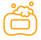
Soap Bar & Soap Noodles