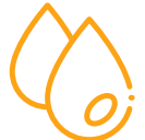
Functional & Specialty Fats