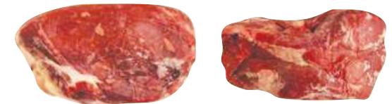
Brazilian beef |