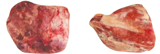
Brazilian neck meat |

With over 30 years of experience, operates as a primary producer of various frozen beef products, sourced from the most advanced and well-equipped slaughterhouses in Brazil .