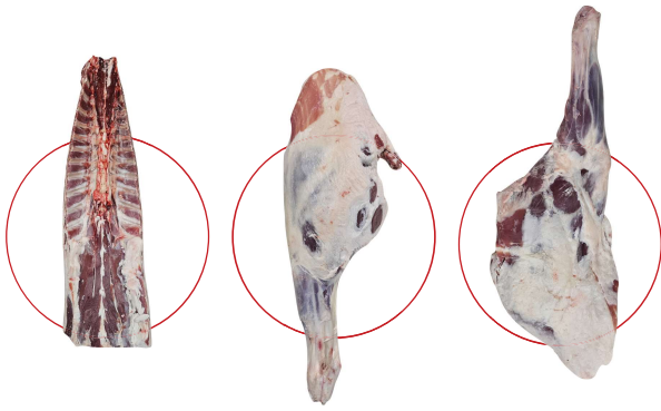
Mongolian beef |

Primary Producer of Frozen Lamb Meat from certified slaughterhouses in Mongolia