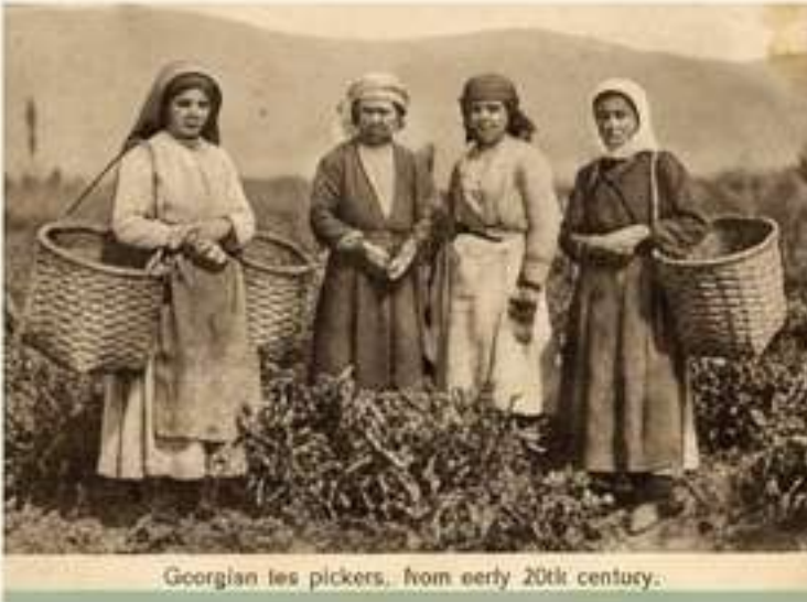
Georgian tea pickers, from early 20th century.

Georgia is a hidden gem of tea culture, offering a unique terroir where tradition meets modern organic standards.