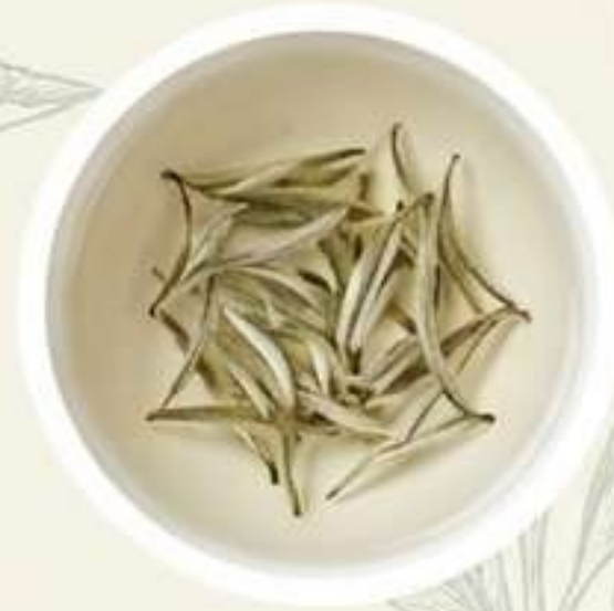
Georgian White Tea