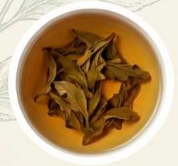
Georgian Oolong Tea