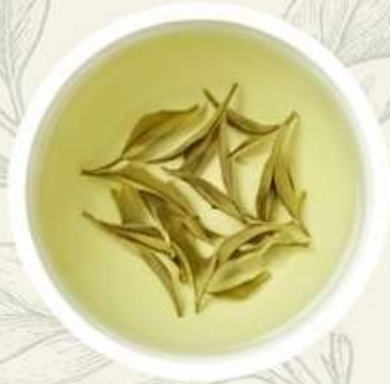
Georgian Green Tea