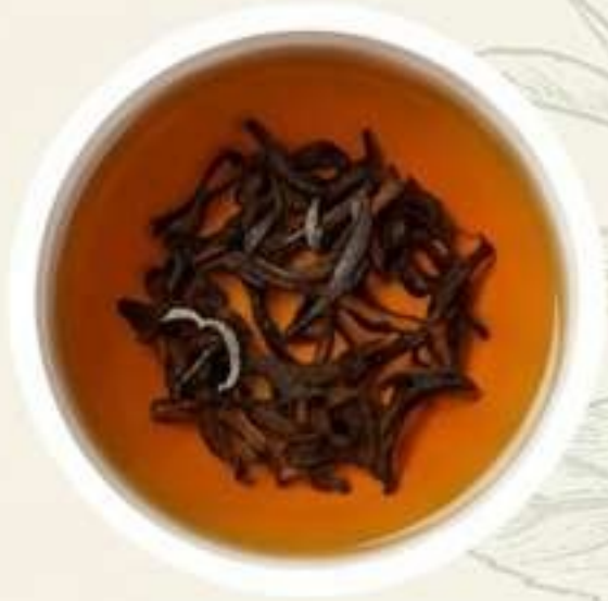
Georgian Black Tea