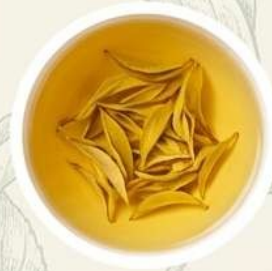
Georgian Yellow Tea